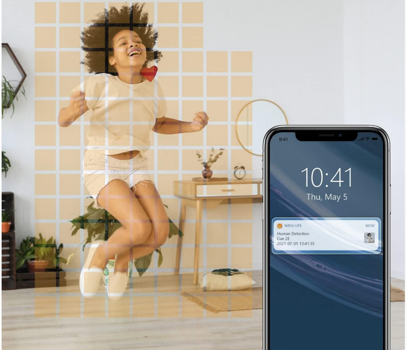
Figure 7: Receive smarter alerts with adjustable detection settings.

Adjust detection sensitivity, region and alarm scheduling to reduce unwanted notifications