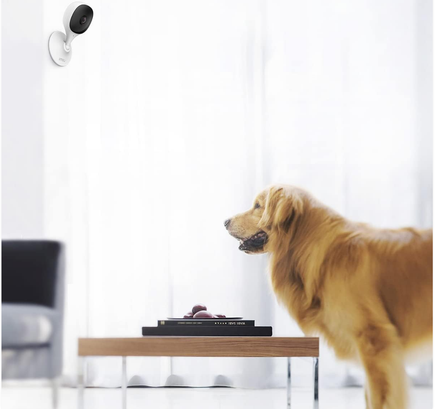
Figure 3: Flexible placement options for your Imou Cue 2E camera.

Place it on a wall or the ceiling, rotate the pivot to get the perfect angle