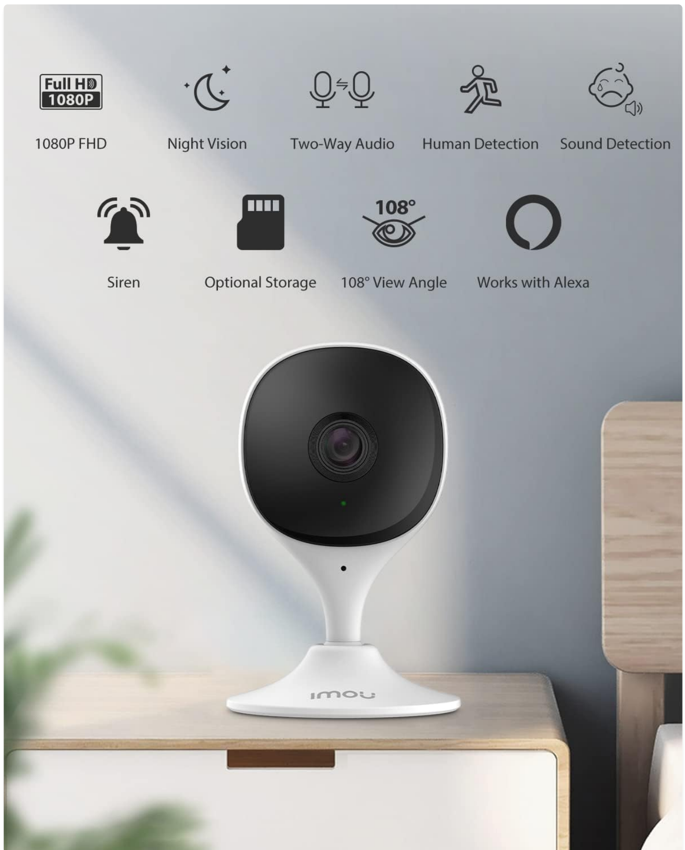
Figure 1: Key features of the Imou Cue 2E Home Security Camera.