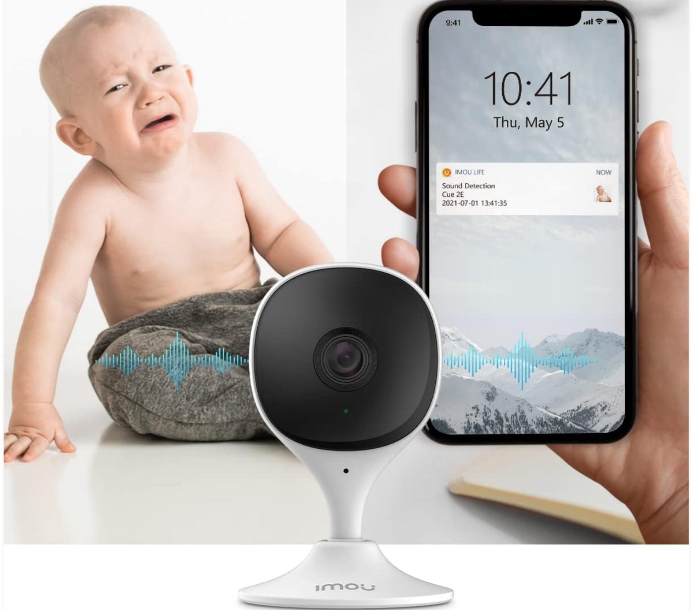
Figure 6: Instant notifications for abnormal sound detection.

Get instant notification when your baby crying