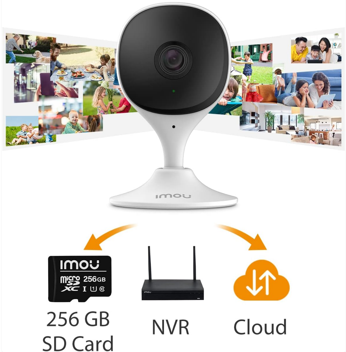
Figure 8: Diverse and secure storage options for your recordings.

Check the recording and playback in a way you like