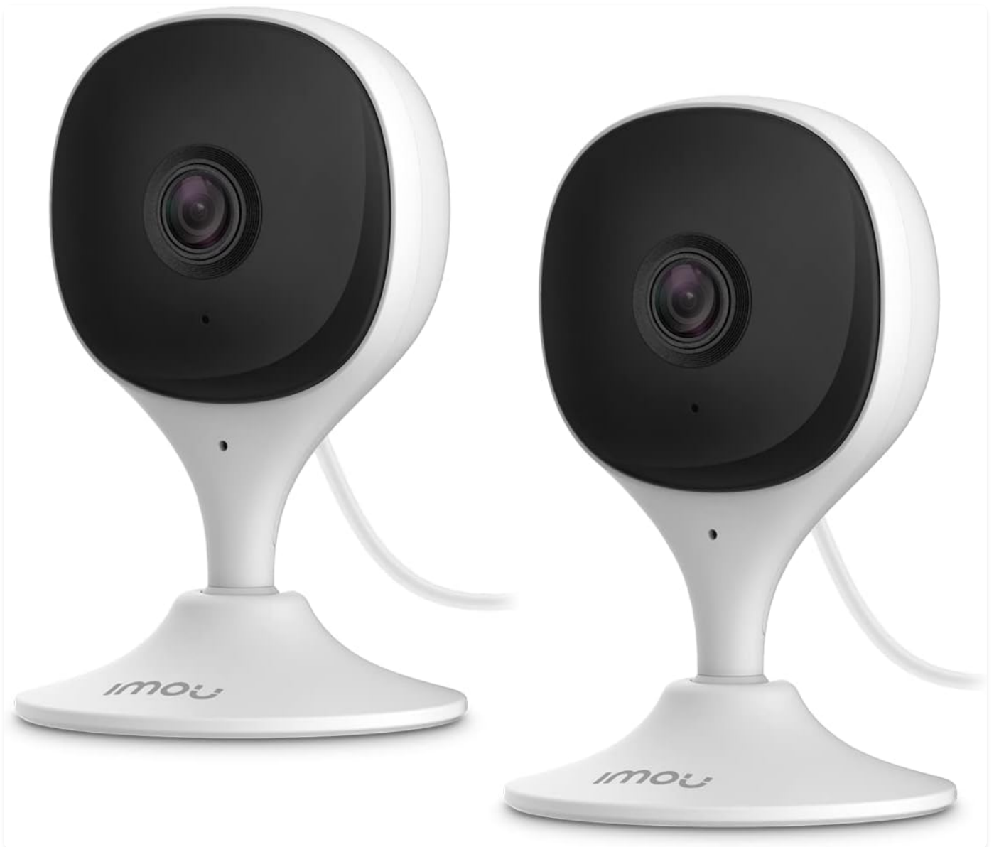
Figure 2: The Imou Cue 2E Home Security Camera (2-pack).