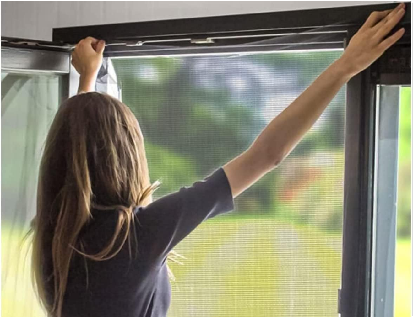
Figure 3: Attaching the mosquito net to the window frame.

Important: For optimal adhesion, allow the tape to set for a few hours before putting tension on the net.