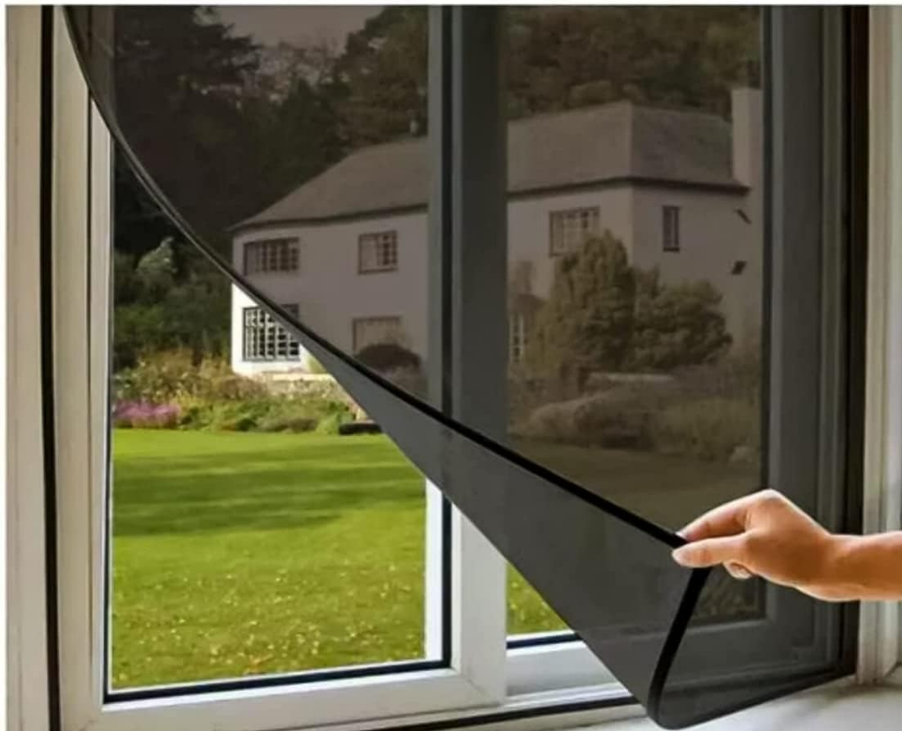
Figure 4: The mosquito net can be easily peeled back for window access.

This product is designed to enhance your comfort by keeping unwanted pests out, allowing for peaceful rest, especially for children.