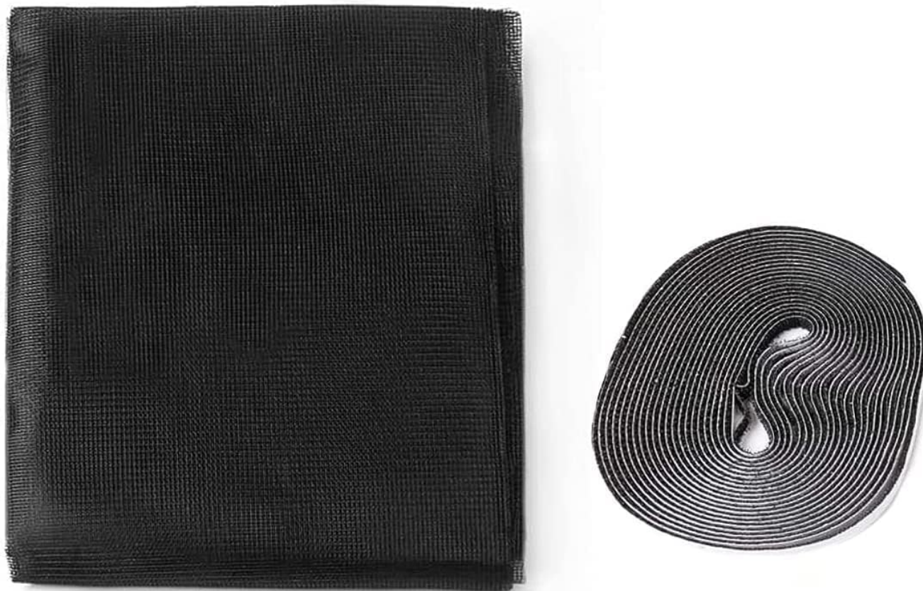
Figure 2: Included components: the mosquito net and adhesive tape.