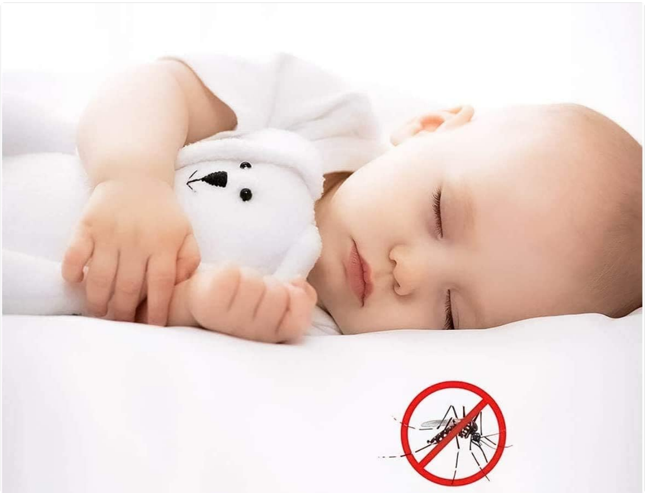
Figure 5: Enjoying a peaceful, insect-free environment.