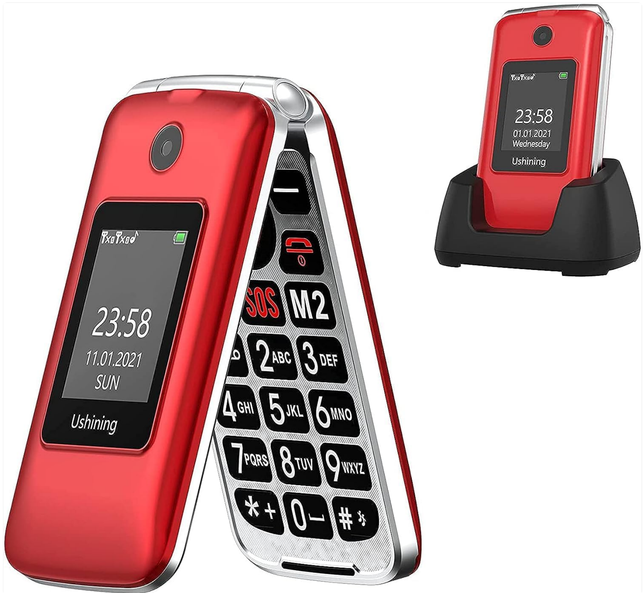
Image 1.1: The USHINING 3G Flip Phone shown with its charging dock.