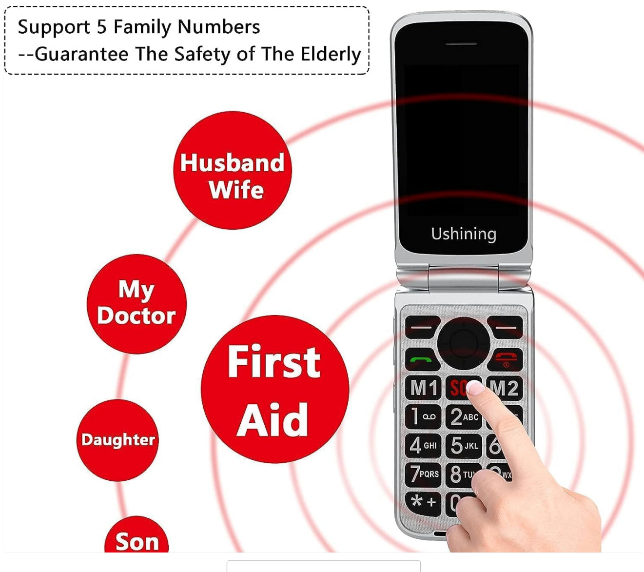
Image 5.1: Visual representation of the SOS emergency call function and its contact setup.