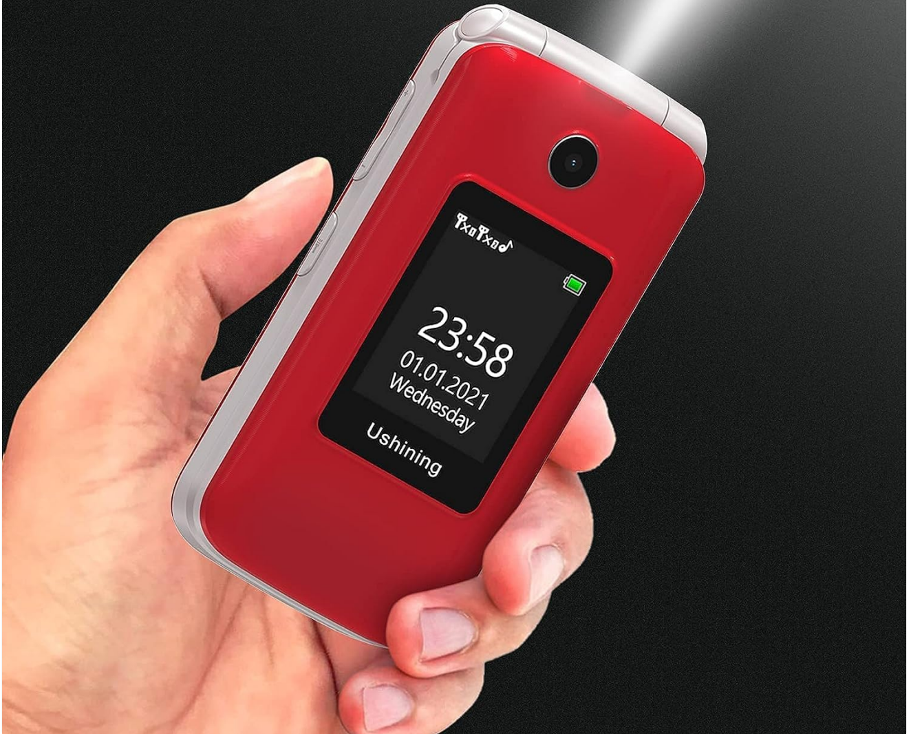
Image 5.2: Overview of the phone's various features and the flashlight in action.