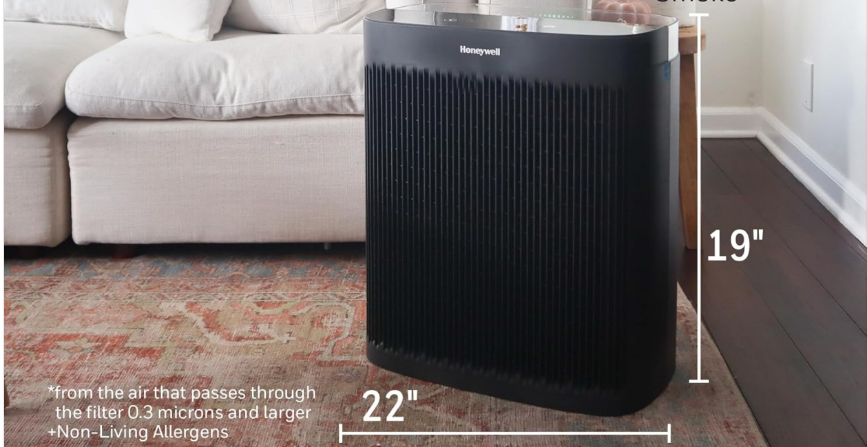
Figure 3: Example placement of the air purifier in a room, highlighting its filtration capabilities.