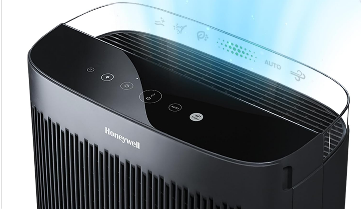
Figure 4: The control panel displaying the four available cleaning levels.