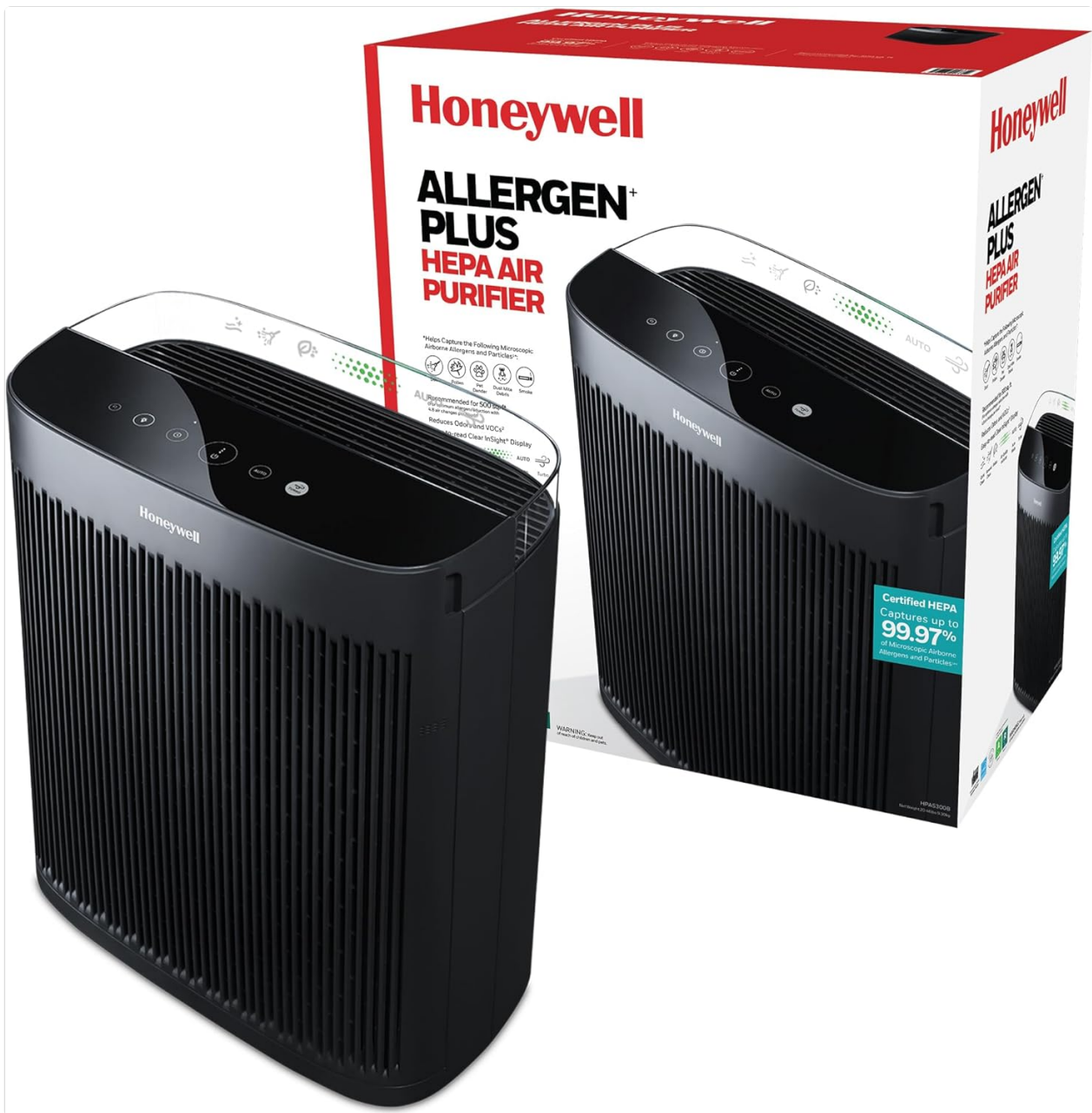
Figure 1: Honeywell Allergen Plus HEPA Air Purifier HPA5300B and its retail packaging.