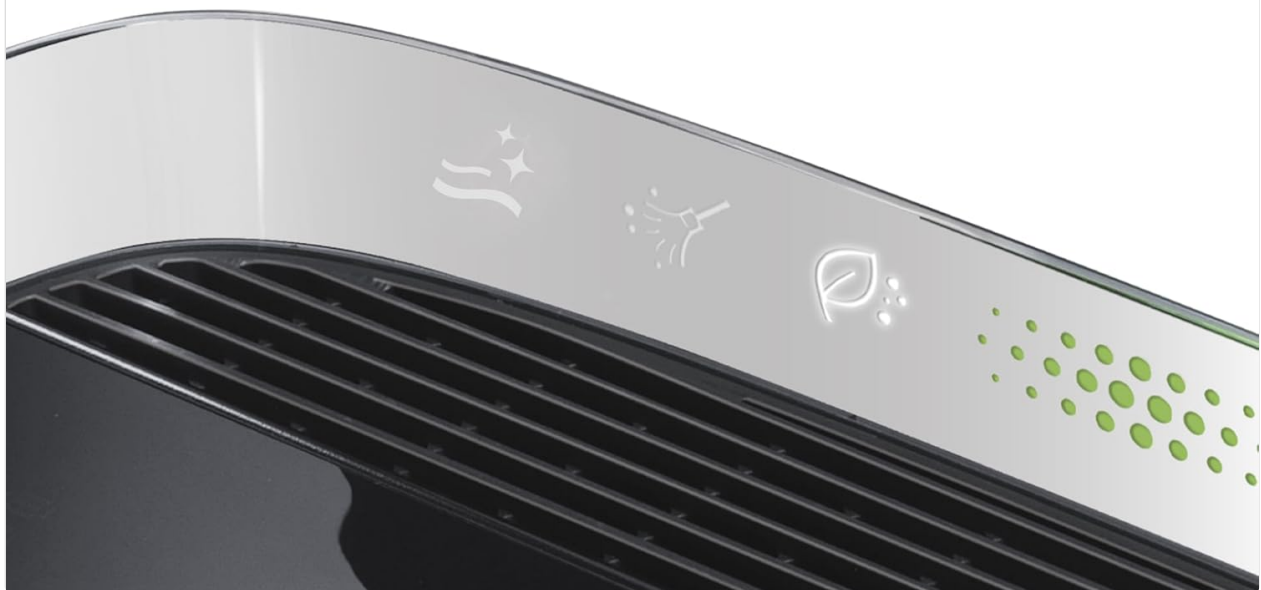
Figure 5: Air Quality Indicator displaying different air quality levels.

When air quality is poor, the unit will automatically increase fan speed to clean the air more effectively. For maximum performance during periods of very poor air quality, activate Turbo Mode .