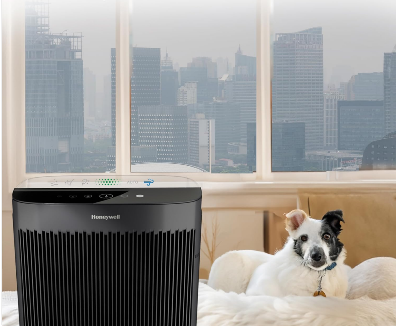
Figure 6: Air purifier in Turbo mode for enhanced cleaning.

Maximum performance when air is at its worst.