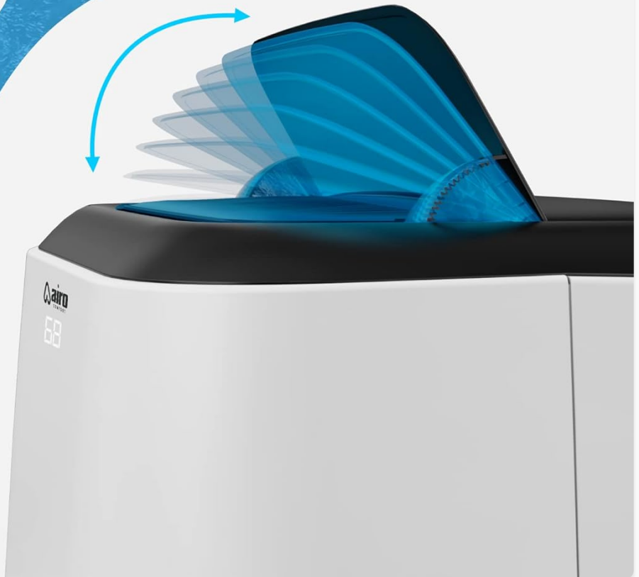
Image: A visual representation of the automatic wind swing feature, illustrating how the unit's vents move to distribute air broadly.