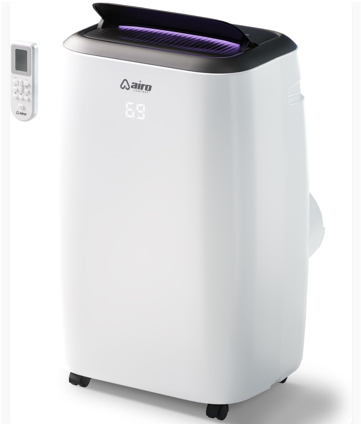
Image: The AIRO COMFORT Portable Air Conditioner, showcasing its sleek white design and accompanying remote control.