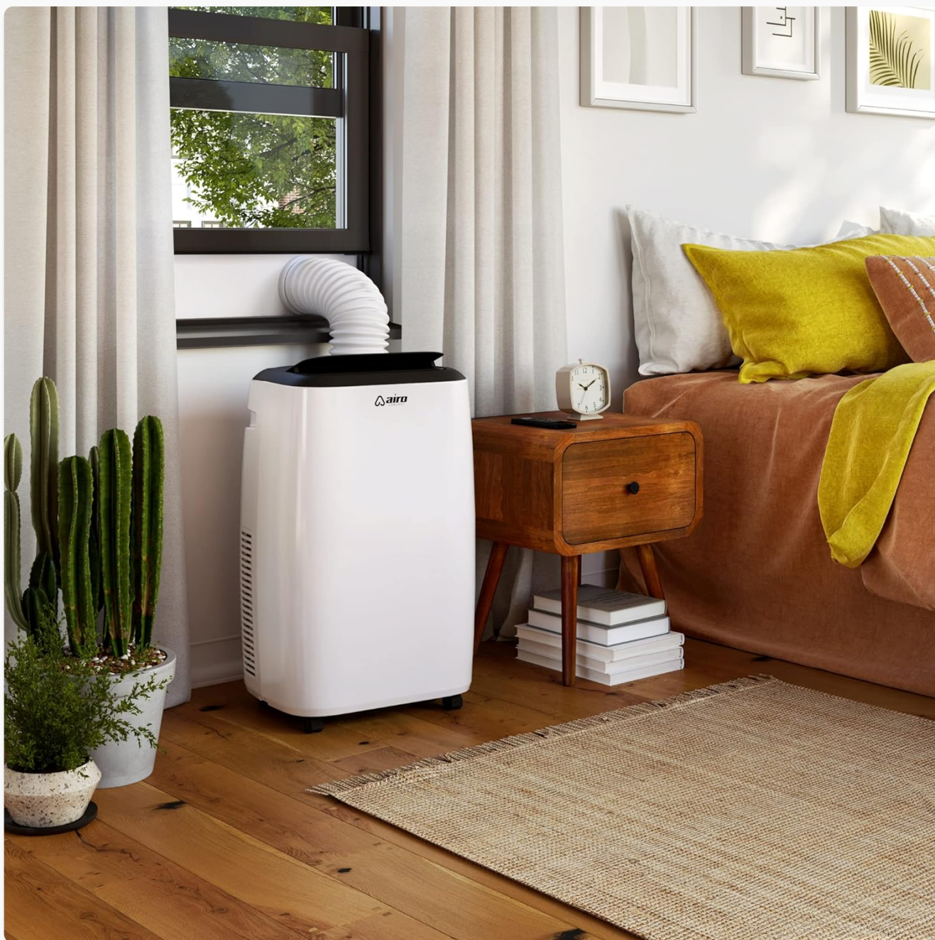
Image: The portable AC unit positioned in a bedroom, demonstrating its compact size and how the exhaust hose connects to a window.

Image: Visual guide demonstrating the easy installation process for the portable AC unit in both double/single-hung and sliding windows.