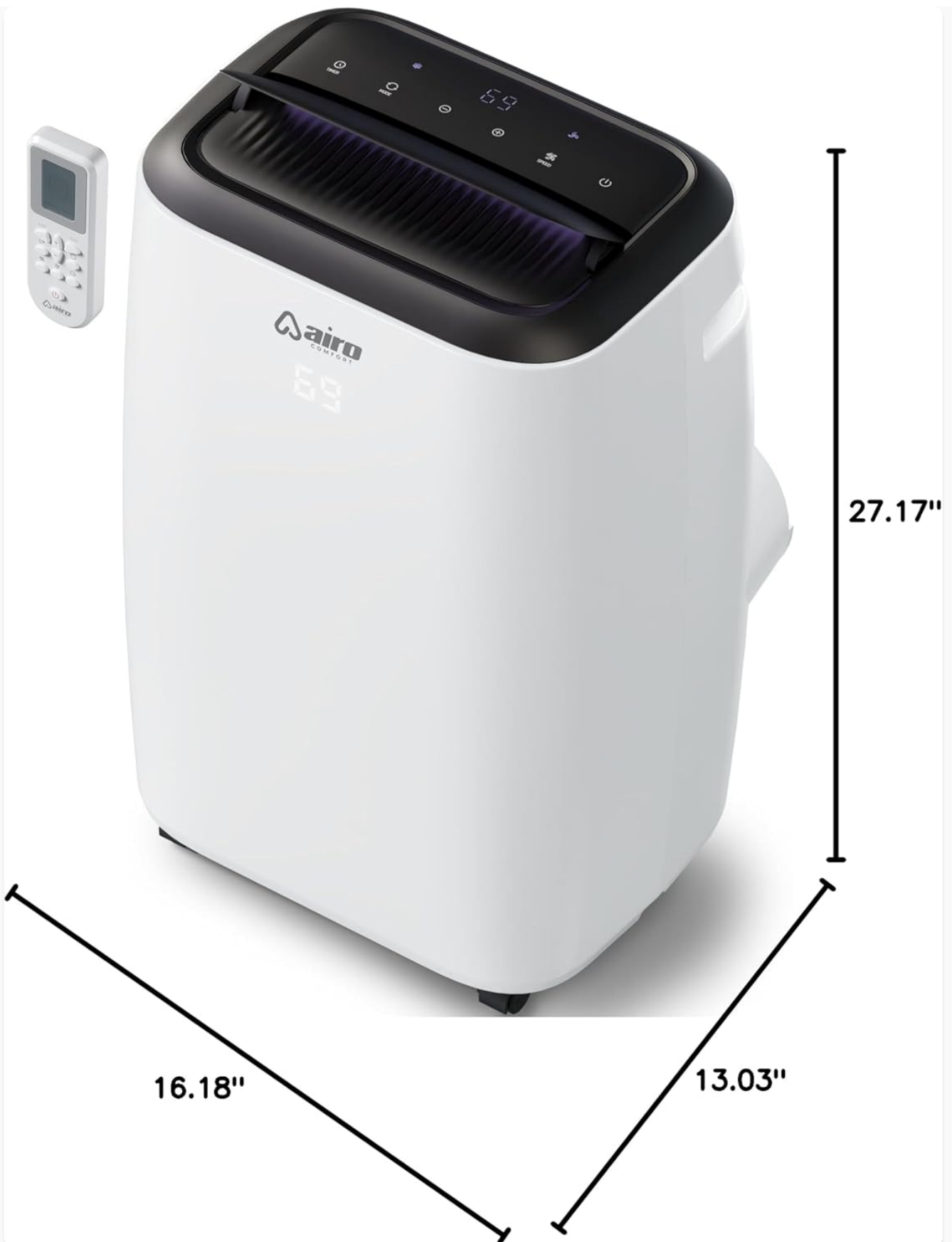
Image: A diagram illustrating the physical dimensions of the portable air conditioner.