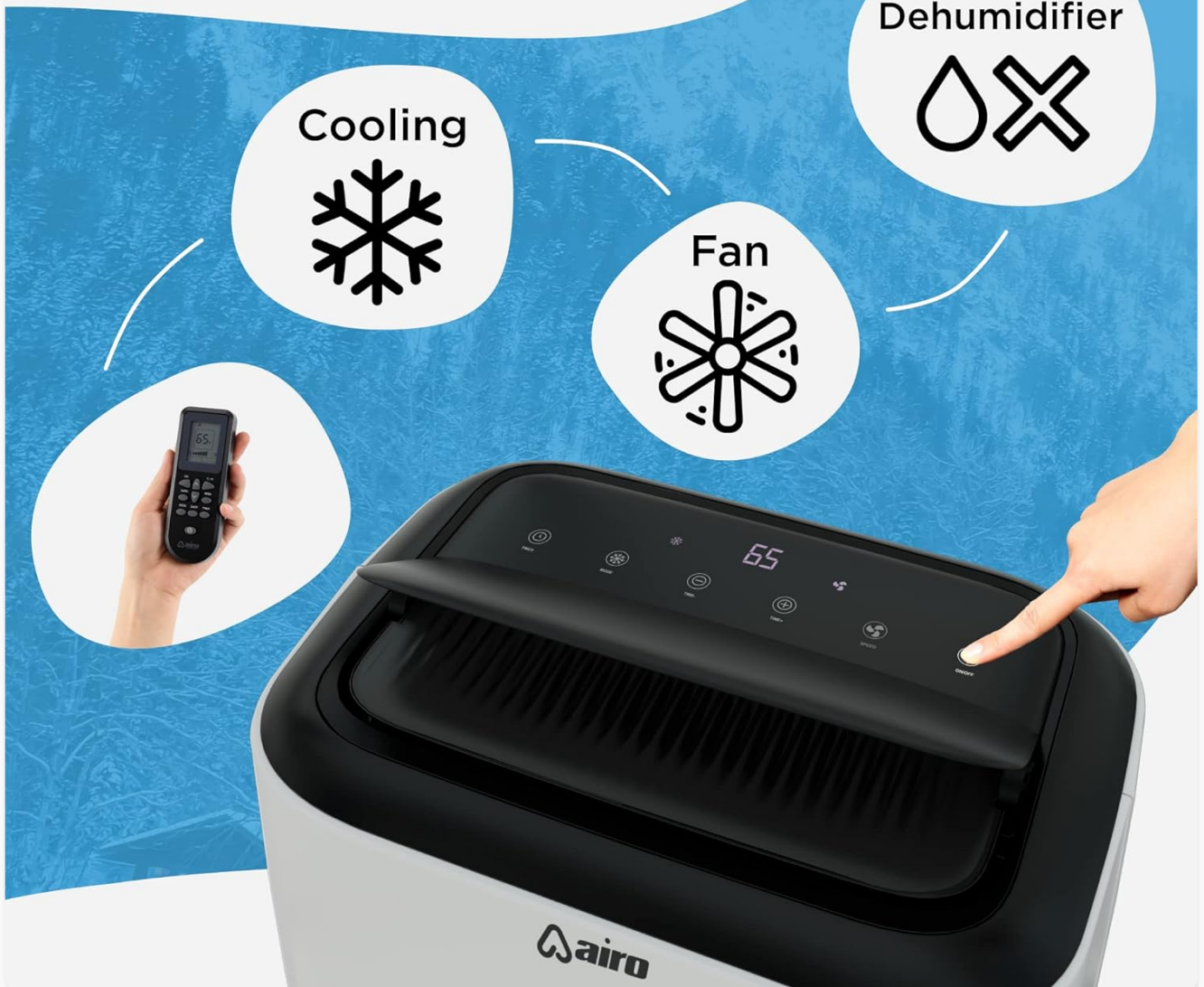
Image: A detailed view of the unit's control panel, highlighting the touch buttons for cooling, fan, and dehumidifier modes, along with the digital display.