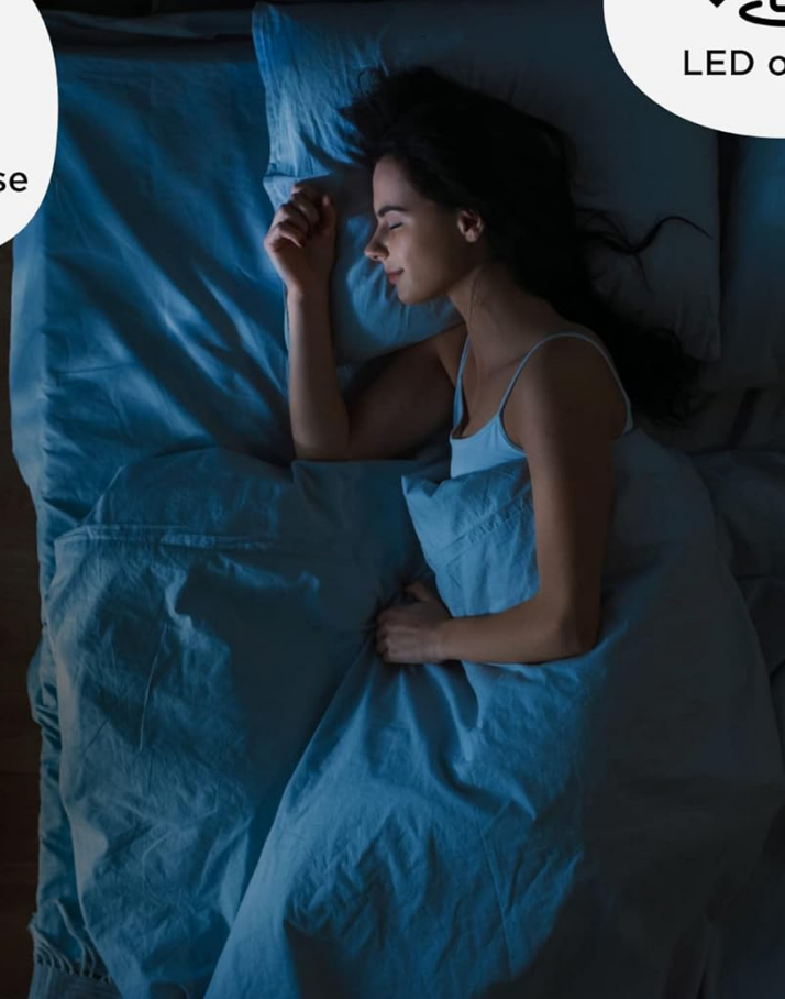
Image: An illustration of the unit's sleep mode, emphasizing its quiet operation and the ability to turn off the LED display for an undisturbed night's rest.