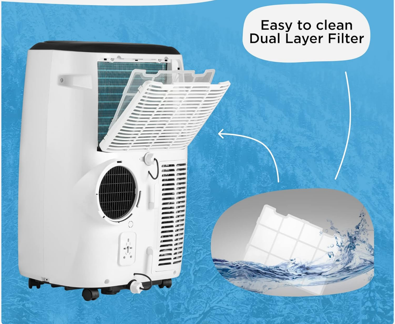
Image: A visual guide to accessing and cleaning the dual-layer air filter, emphasizing its user-friendly design.