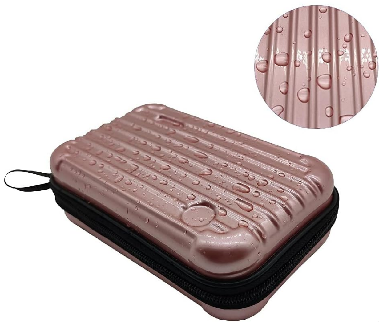
Figure 4: The water-resistant surface of the case, showing how water beads on the hard shell, indicating its protective qualities.

The shell is made of waterproof material to withstand rainy days.