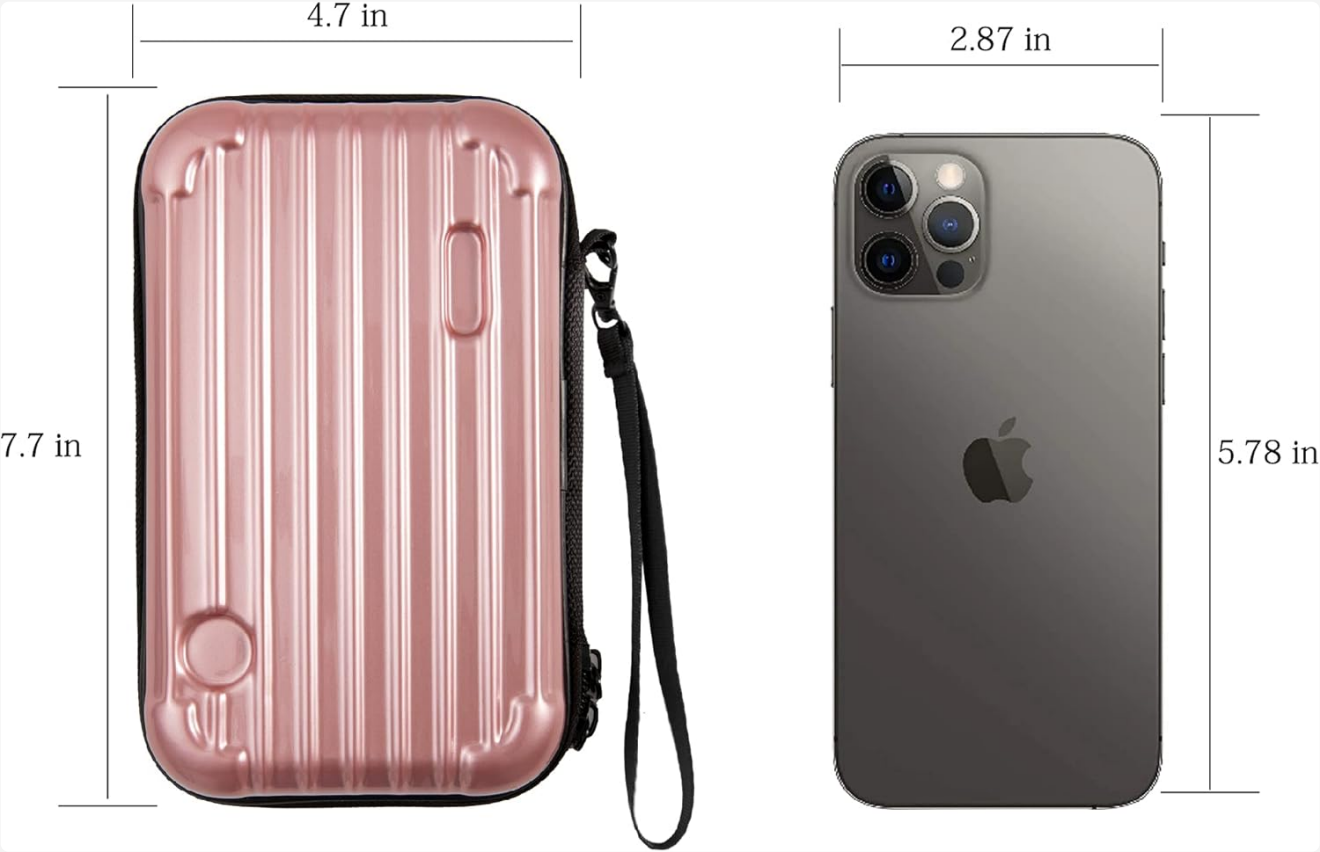
Figure 5: Visual representation of the case dimensions (7.7 inches by 4.7 inches) in comparison to a standard smartphone, illustrating its compact size.