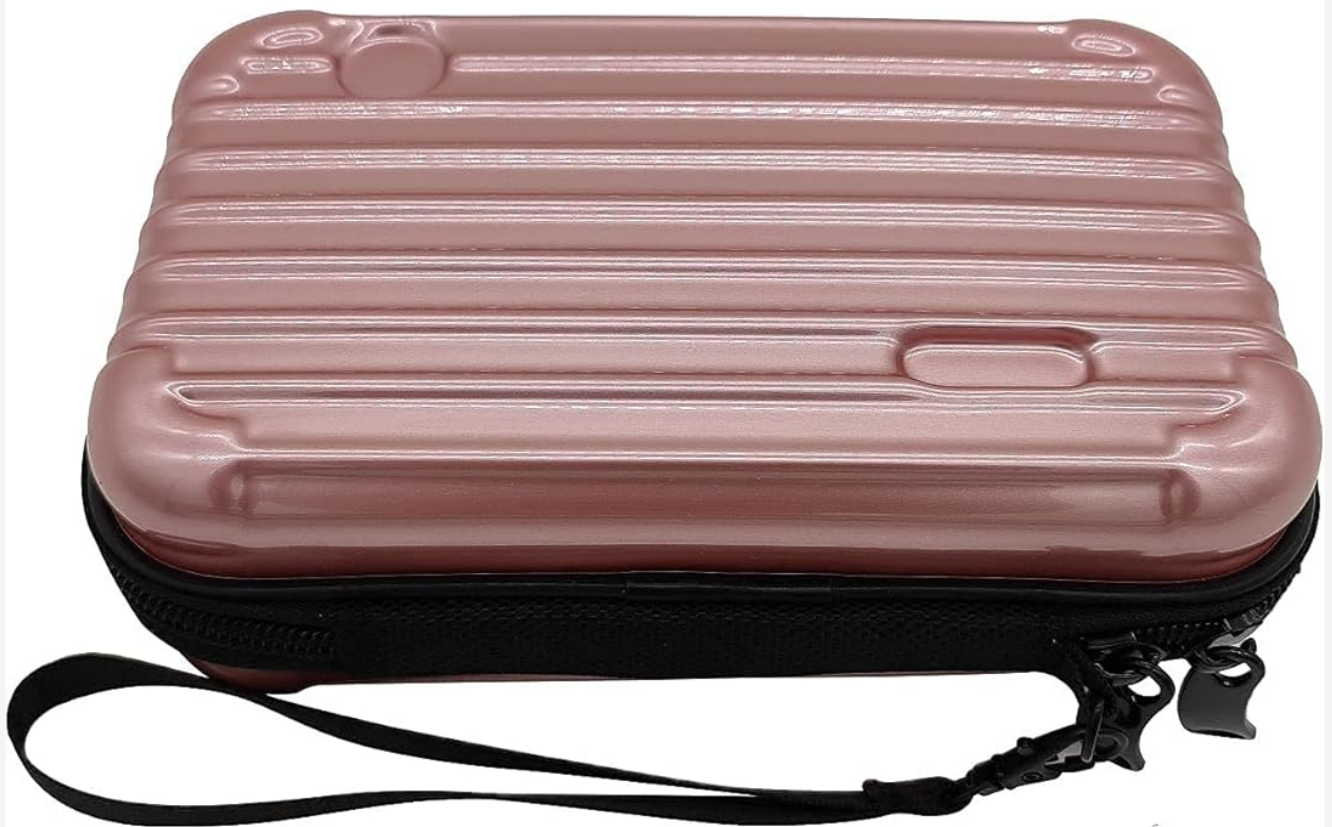
Figure 2: Side view of the cosmetic case, highlighting the zipper and wrist strap attachment point.