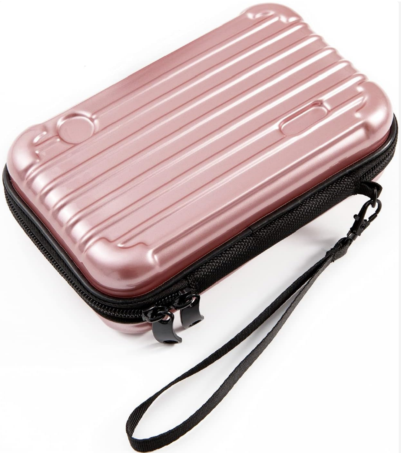
Figure 1: The SenYang Hard Shell Cosmetic Case in Gold, showcasing its compact and durable design.