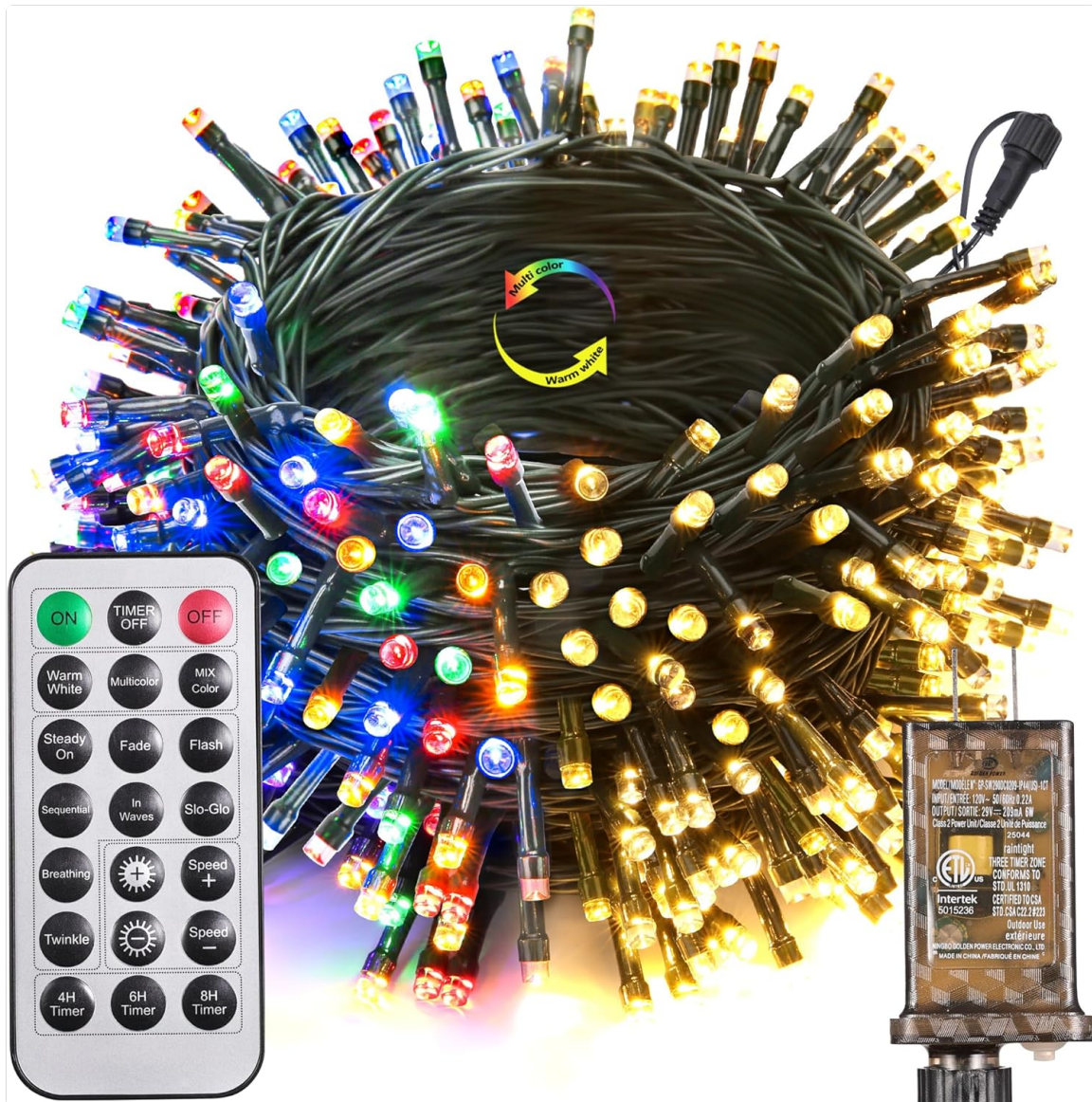
Image: Contents of the Joomer 200 LED Color Changing String Lights package, including the coiled lights, remote control, and power adapter.