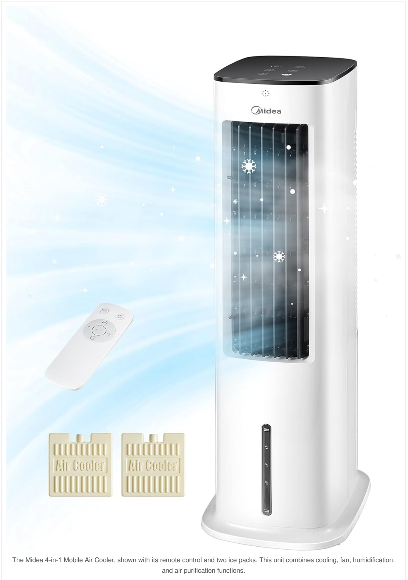
The Midea 4-in-1 Mobile Air Cooler, shown with its remote control and two ice packs. This unit combines cooling, fan, humidification, and air purification functions.