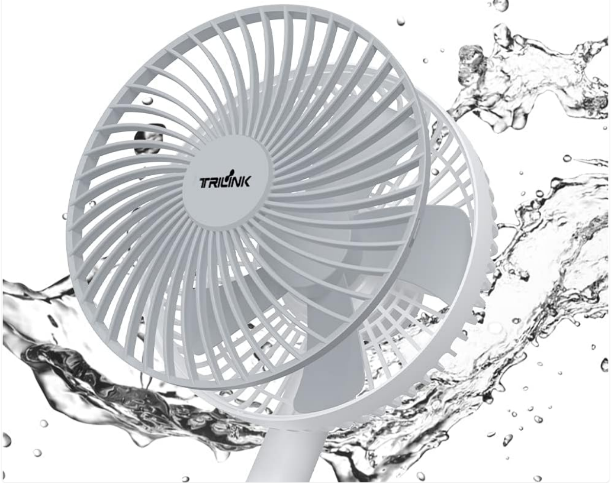
Image: The removable front cover of the fan, demonstrating ease of cleaning.