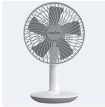
Image: Front view of the TRILINK Desk Fan, ready for use.