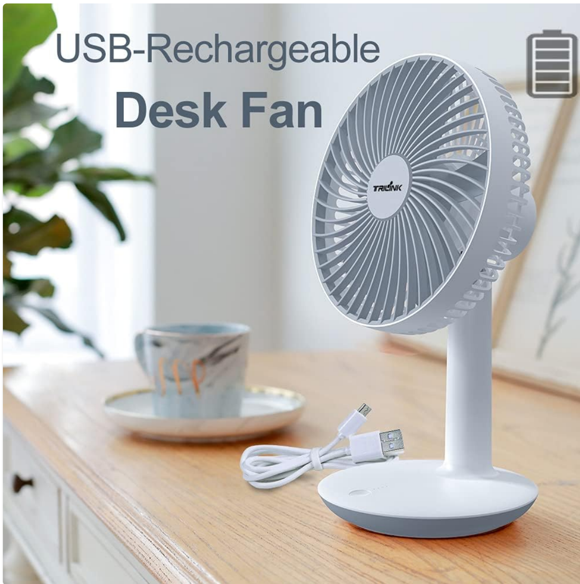
Image: The TRILINK 6-Inch Rechargeable Desk Fan, showcasing its compact design and USB charging cable on a desk.