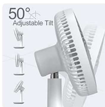
Image: The fan head can be tilted to adjust the airflow direction.

Your browser does not support the video tag.