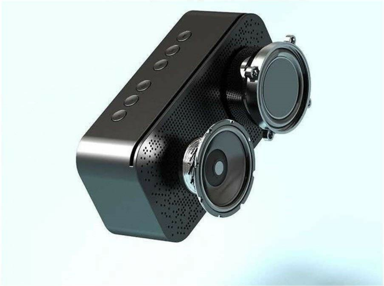
An internal view of the G-10 speaker, highlighting its dual speaker configuration for enhanced sound.