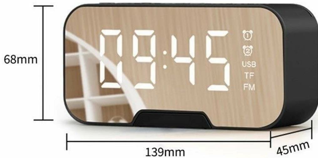
Dimensions of the G-10 speaker: 139mm (length) x 68mm (height) x 45mm (depth).