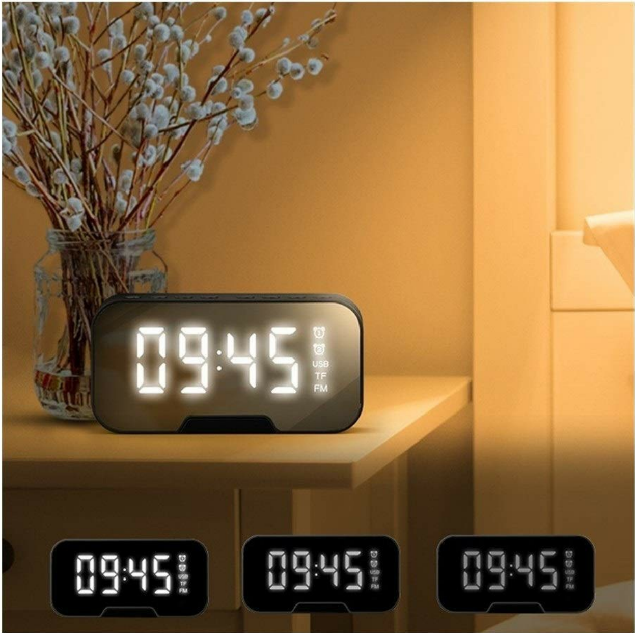
The G-10 speaker serving as an alarm clock on a bedside table, illustrating its compact design and clear digital display.