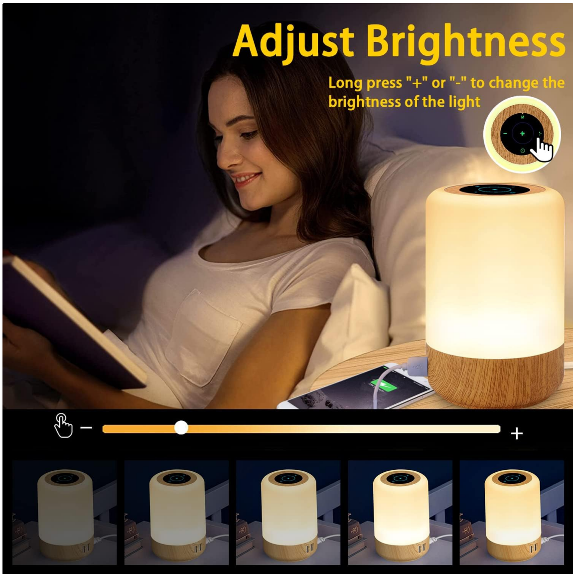
Figure 5: Adjusting brightness using the touch control.