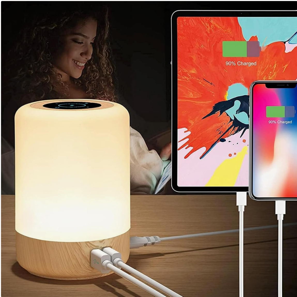
Figure 1: Taipow Touch Table Lamp in use, charging multiple devices.