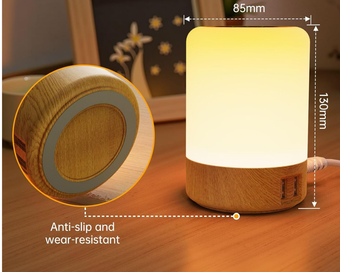
Figure 3: Anti-slip base and lamp dimensions.