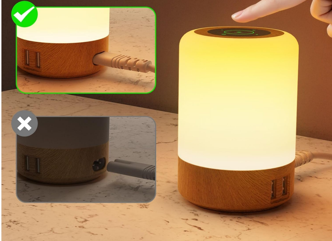
Figure 2: Ensure the lamp is properly connected to a power source.