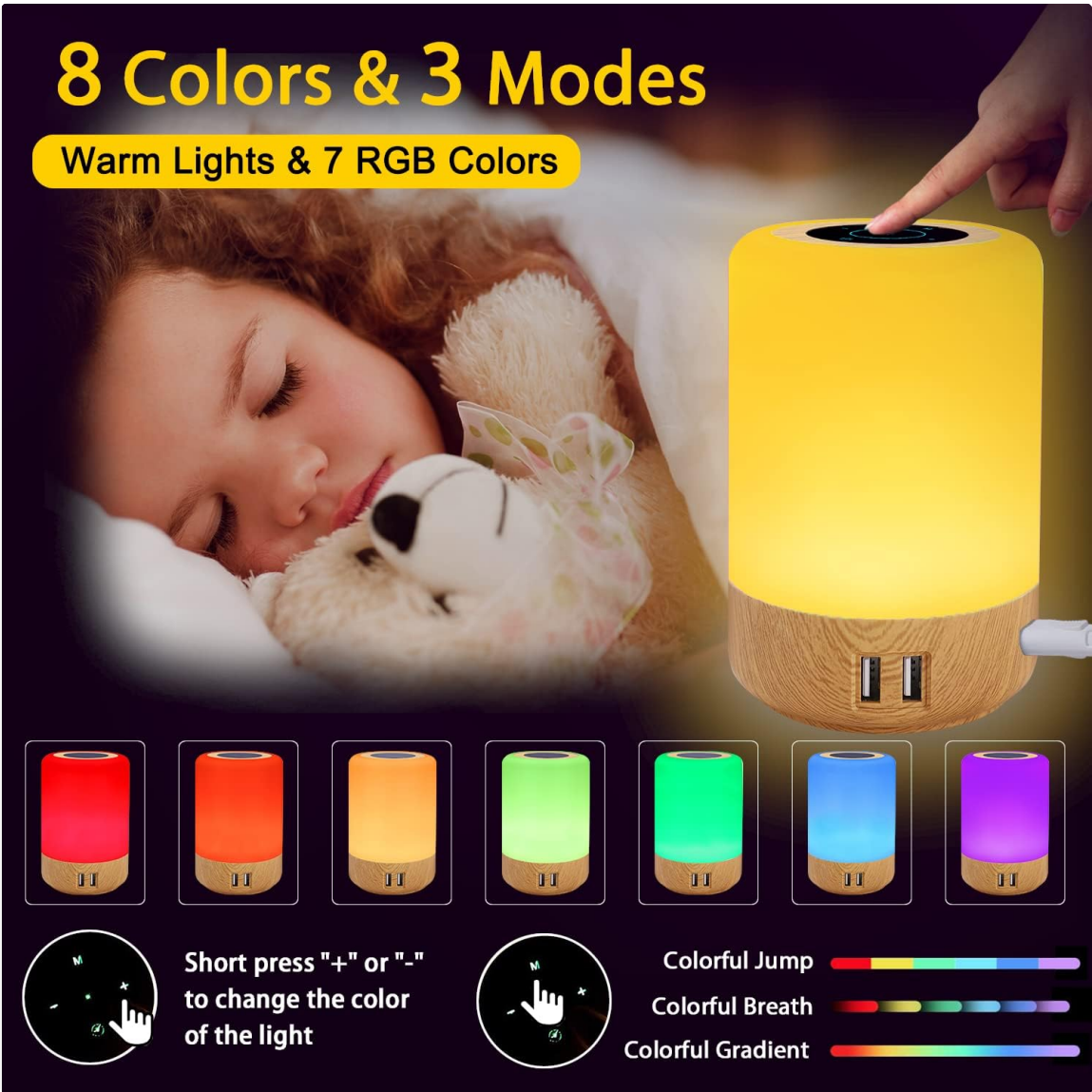
Figure 6: Exploring the 8 colors and 3 lighting modes.