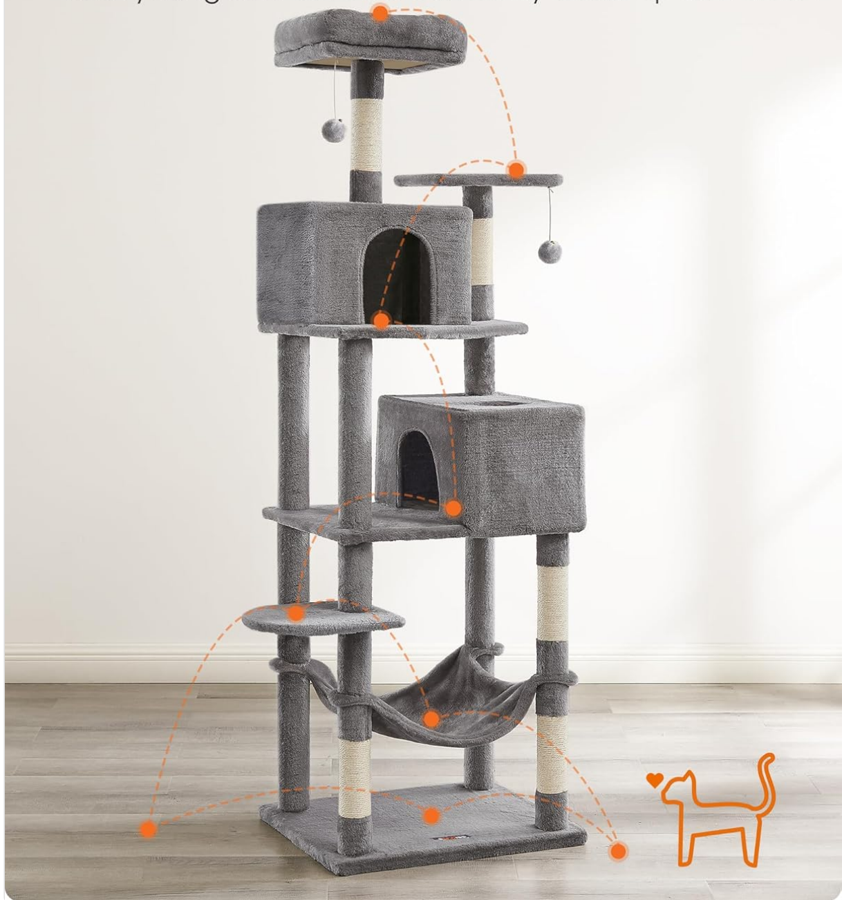
Figure 2: Multi-level design for easy climbing and exploration by cats of all ages.

Both young and old cats can easily climb up and down