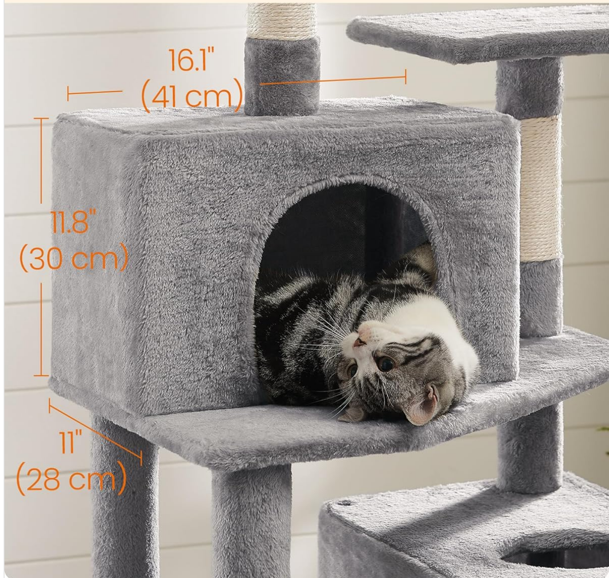
Figure 4: Large cat caves offer private and secure spaces for relaxation.

There's enough room for larger cats or a few cat friends