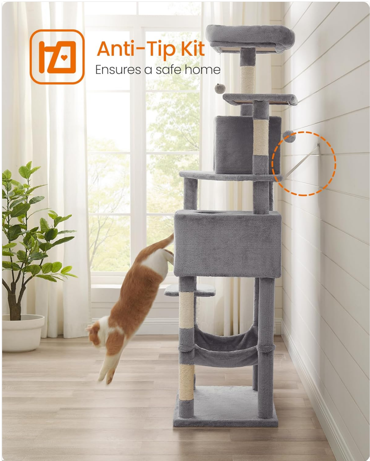
Figure 1: Illustration of the anti-tip kit securing the cat tree to a wall. This kit enhances stability and prevents accidental tipping.