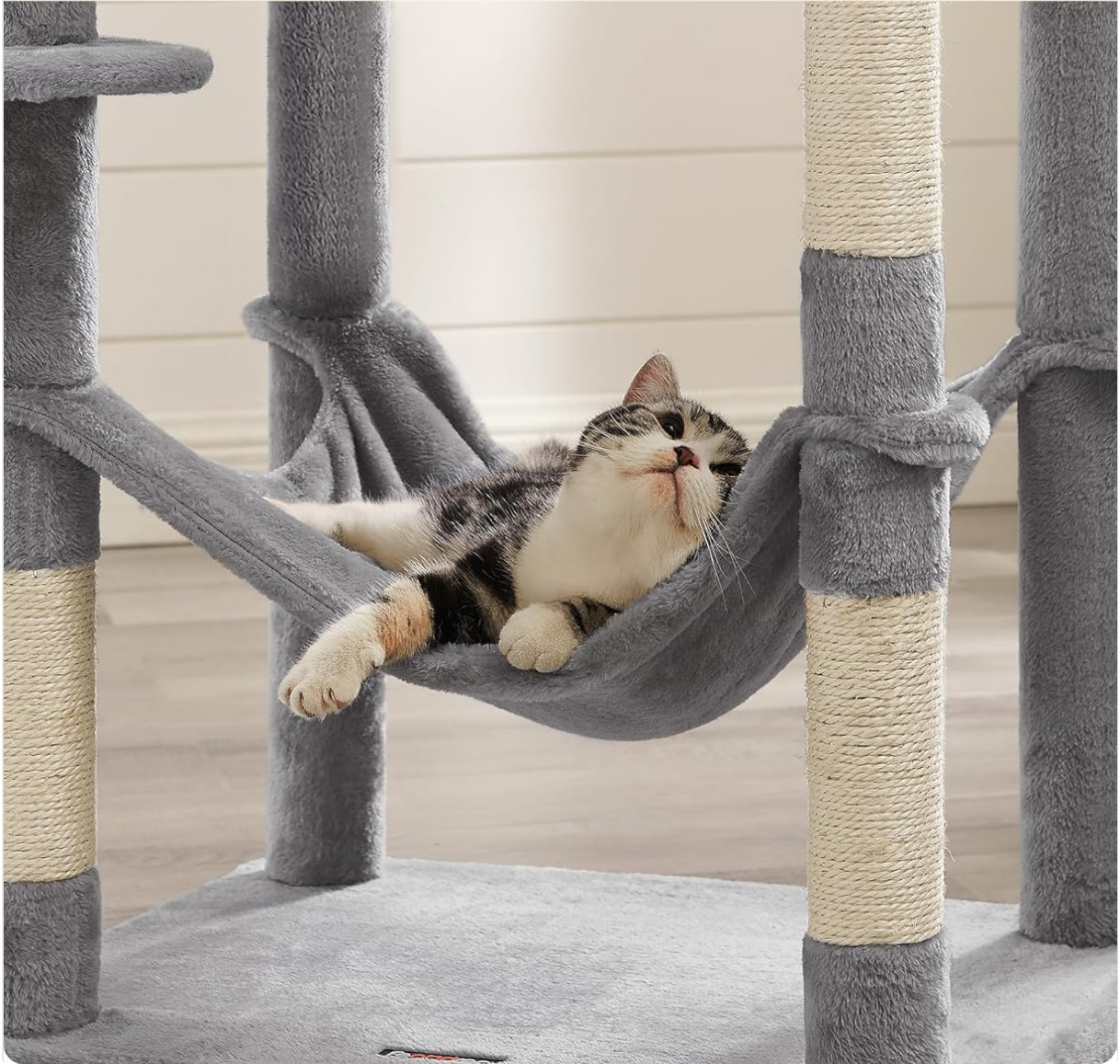
Figure 5: The large hammock provides an additional comfortable lounging area.