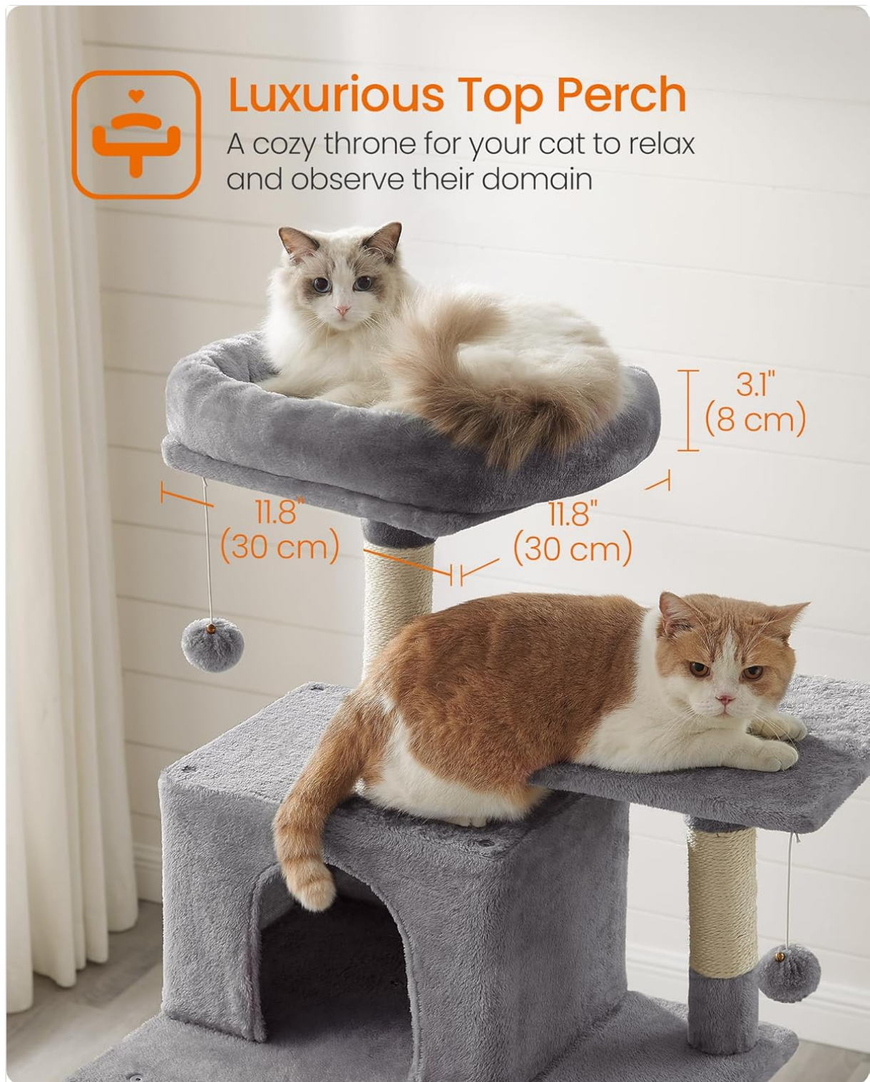
Figure 3: The luxurious top perch provides a comfortable elevated resting spot.