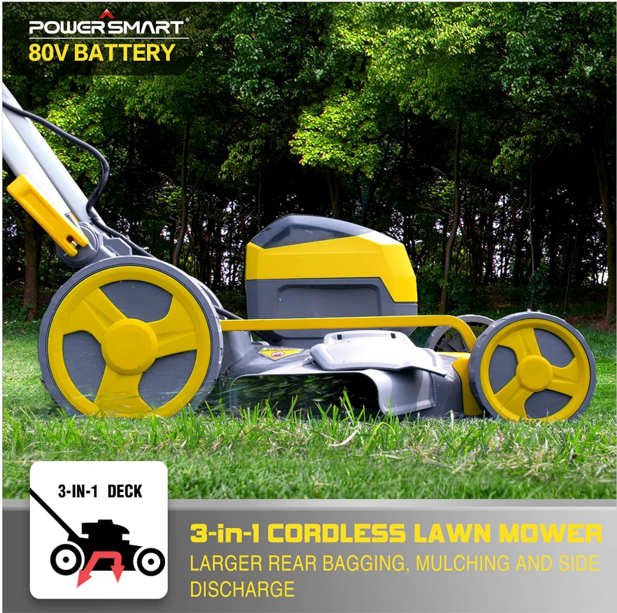
Figure 8: The mower features 5 adjustable cutting height settings, from 1.18 inches to 3.0 inches, suitable for various grass types and conditions.