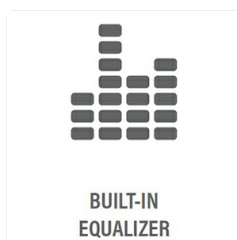
Image: A graphic icon representing a built-in equalizer, indicating audio customization options.

The unit features multicolor illumination, allowing you to customize the button lighting to match your vehicle's interior or personal preference.