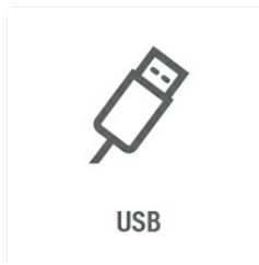
Image: A graphic icon representing a USB port.

Connect USB devices for media playback and charging. The auxiliary input allows connection of external audio sources.