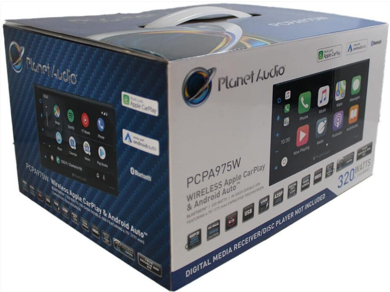
Image: Retail packaging for the Planet Audio PCPA975W Car Stereo, showing the unit and its key features.