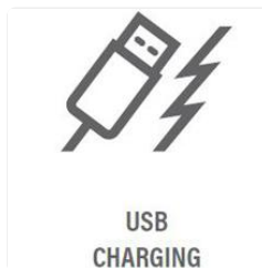
Image: A graphic icon representing USB charging functionality.