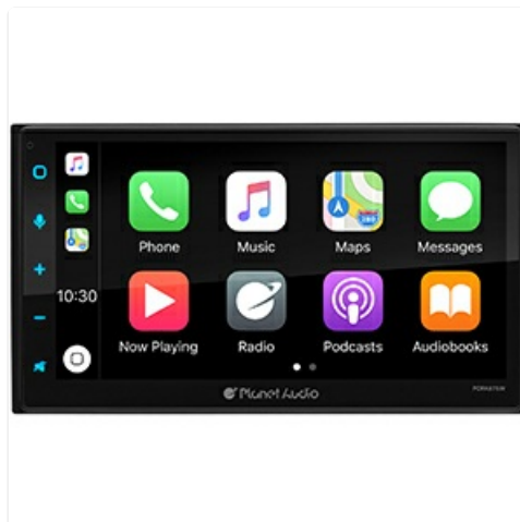
Image: The PCPA975W display showcasing the Apple CarPlay interface with icons for Phone, Music, Maps, Messages, Now

Connect your iPhone to access CarPlay features directly on the stereo's touchscreen. Use Siri voice controls for hands-free operation of Phone, Music, Maps, Text messages, Radio, Podcasts, and Audiobooks. Siri can read, reply to, and send messages, and assist with navigation by searching for points of interest along your route.