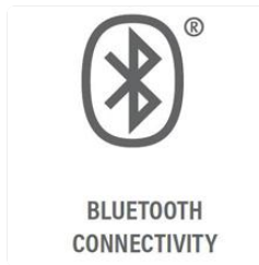
Image: A graphic icon representing Bluetooth connectivity.