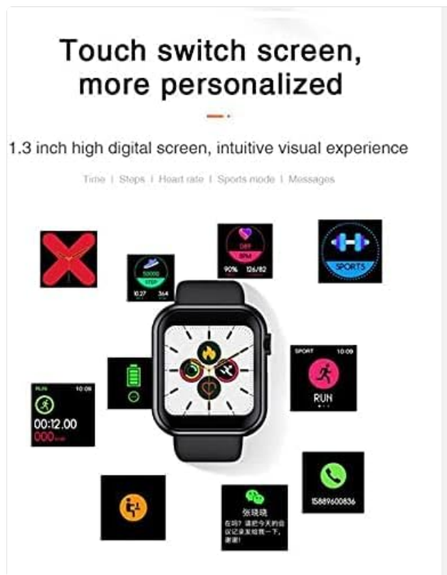
Figure 3.1: The D28 Smart Watch display showing different personalized screens and data points, including time, steps, heart rate, and sports mode.

The D28 Smart Watch features a responsive touch screen for easy navigation. Swipe left, right, up, or down to access different menus and functions. Tap to select an option.