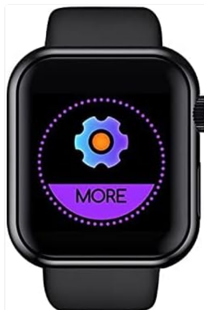
Figure 3.4: The D28 Smart Watch display showing a 'MORE' option, typically leading to additional settings or features.

The watch includes a feature to help you locate your paired smartphone, and vice versa, the app can help you find your watch.