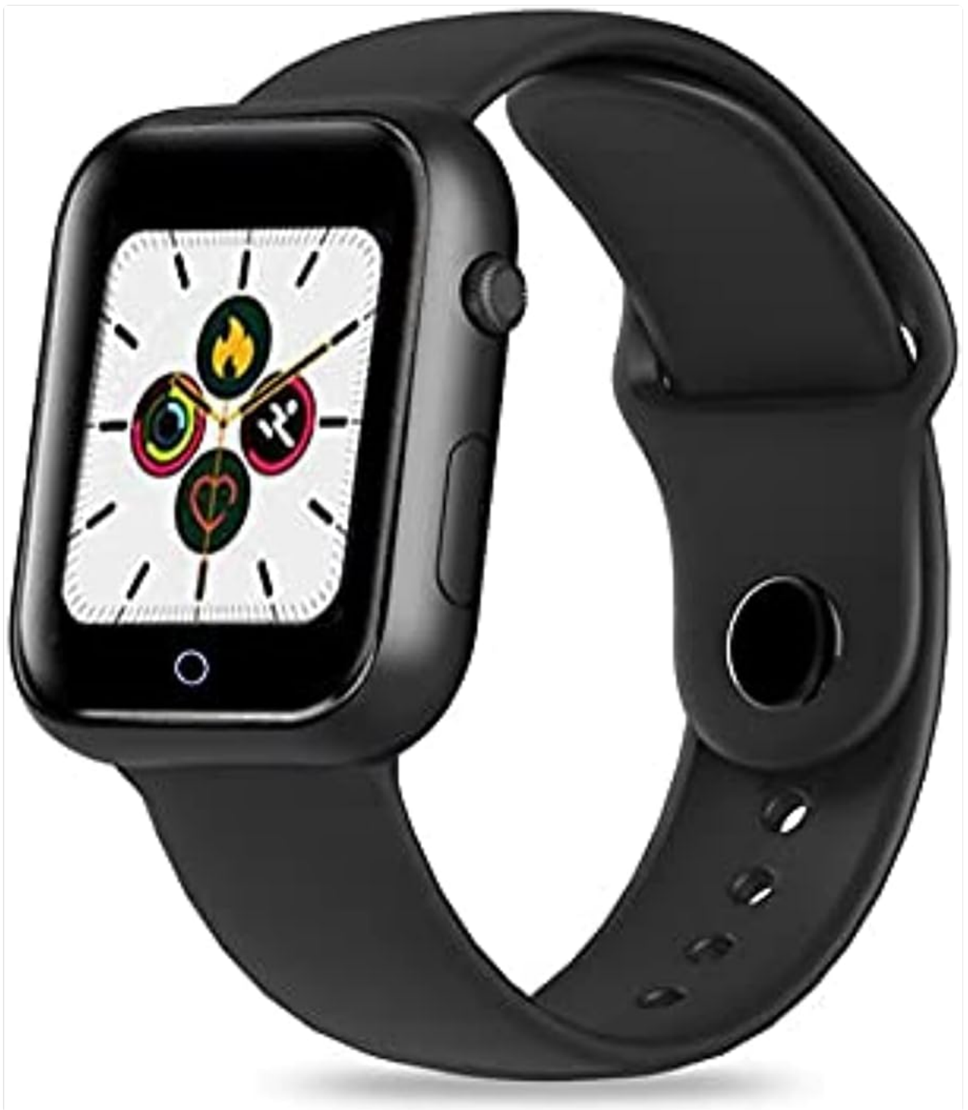
Figure 1.1: Front view of the D28 Smart Watch, showcasing its square display and black silicone strap.