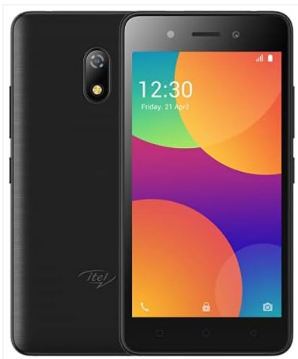
Image: Front and back view of the Itel A16 Plus Dual SIM 4G smartphone. The front displays the screen with a digital clock showing 12:30 and colorful wallpaper. The back shows the camera module and the Itel logo.

This manual provides essential instructions for the safe and efficient operation of your Itel A16 Plus Dual SIM 4G smartphone. Please read this manual thoroughly before using your device to ensure proper functionality and to prevent damage.