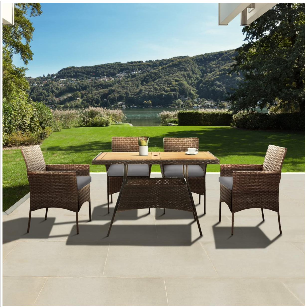
Image 5: The dining set positioned on an outdoor patio, demonstrating its intended use in an open-air environment.