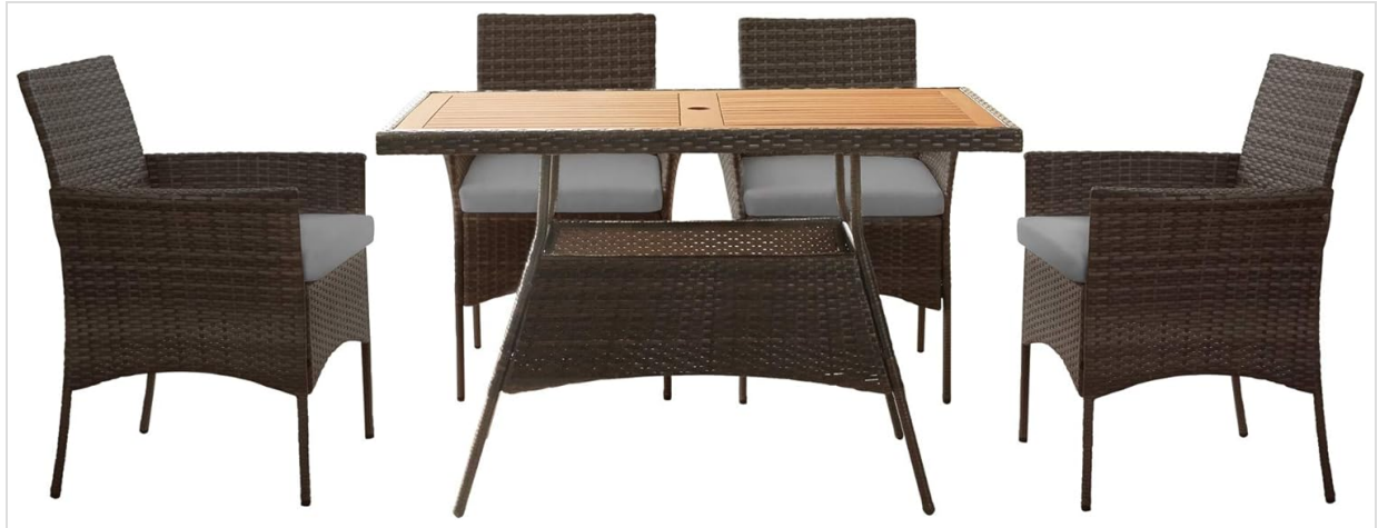
Image 1: The Teamson Home Outdoor PE Rattan Dining Set assembled, featuring the table and four chairs.