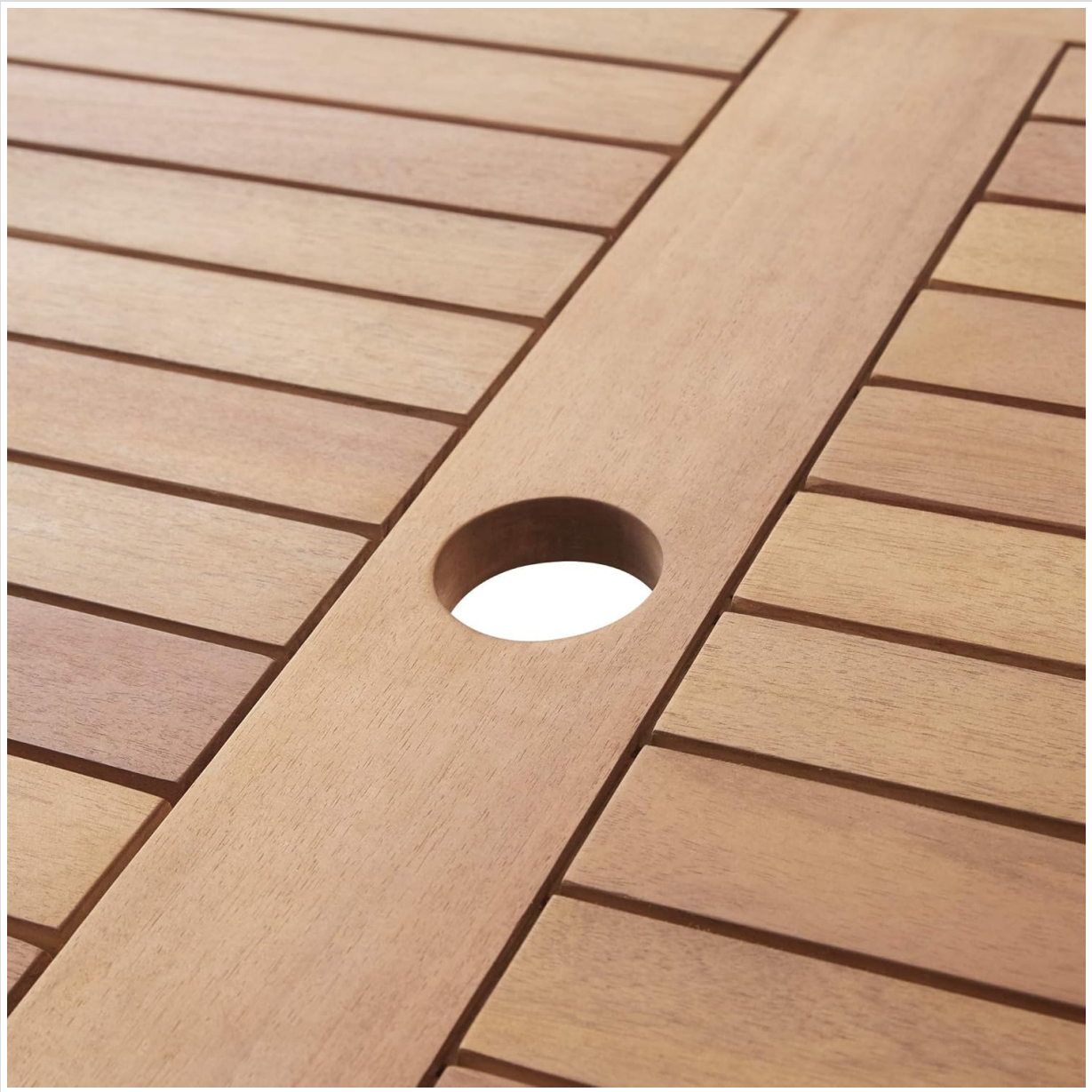
Image 4: Detail of the central umbrella hole integrated into the Acadia wood tabletop, designed to accommodate a standard patio umbrella (not included).