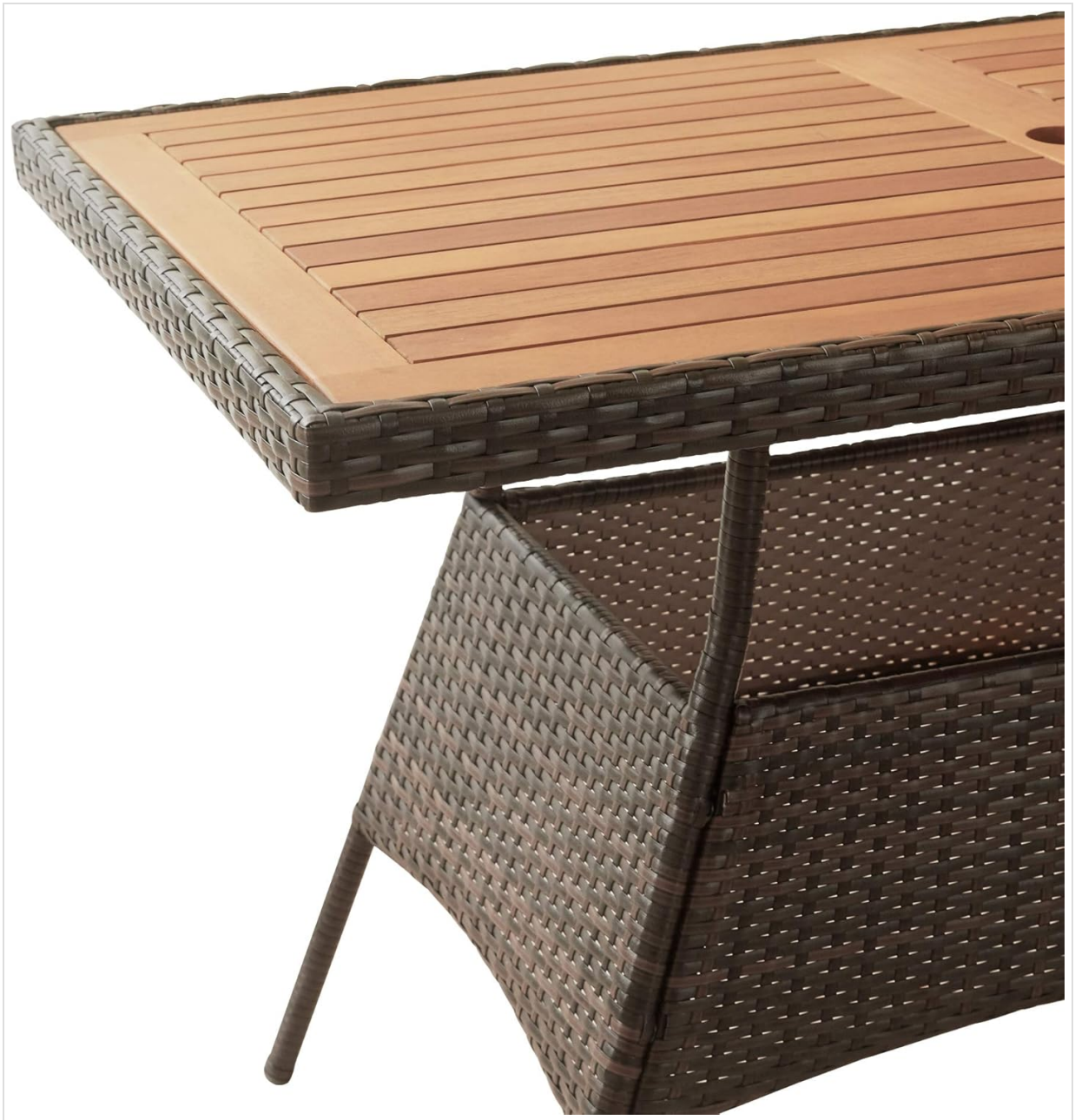
Image 3: A close-up view of the Acadia wood-slatted tabletop, showcasing its natural grain and construction.