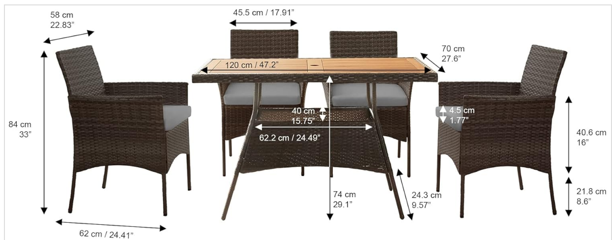
Image 2: Diagram illustrating the dimensions of the dining table and chairs in centimeters and inches.