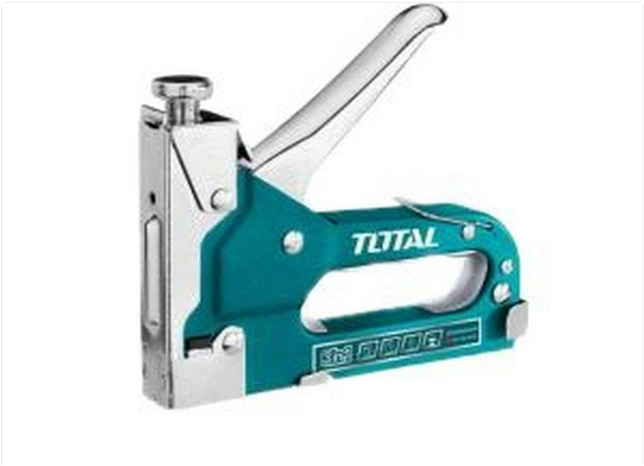
Figure 1: Total THT31143 3-in-1 Staple Gun. This image shows the staple gun in its packaging, highlighting its sleek design and compact construction.

construction ensures durability and reliable performance.