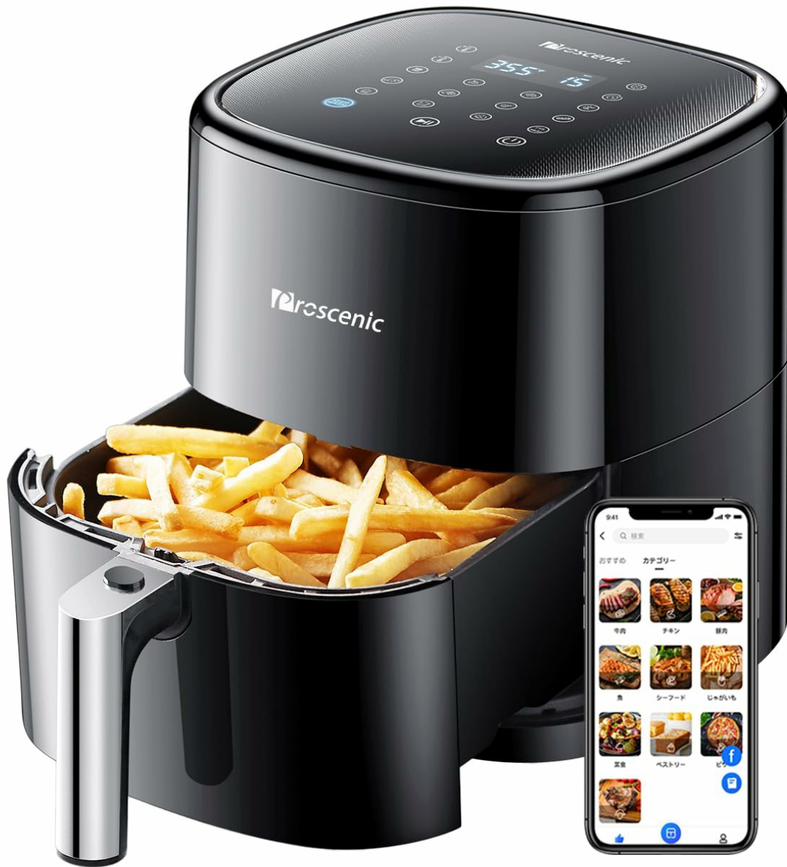
Figure 3.1: The Proscenic T22 5L Air Fryer features a compact design with a large capacity basket.

Familiarize yourself with the components of your Proscenic T22 Air Fryer.