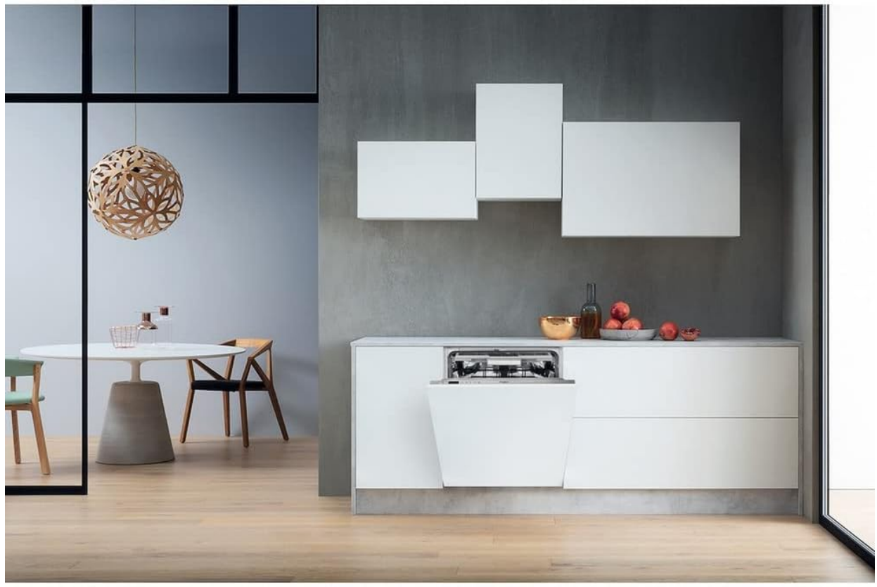
Figure 4.1: The Whirlpool WIO 30540 PELG dishwasher seamlessly integrated into a kitchen cabinet.