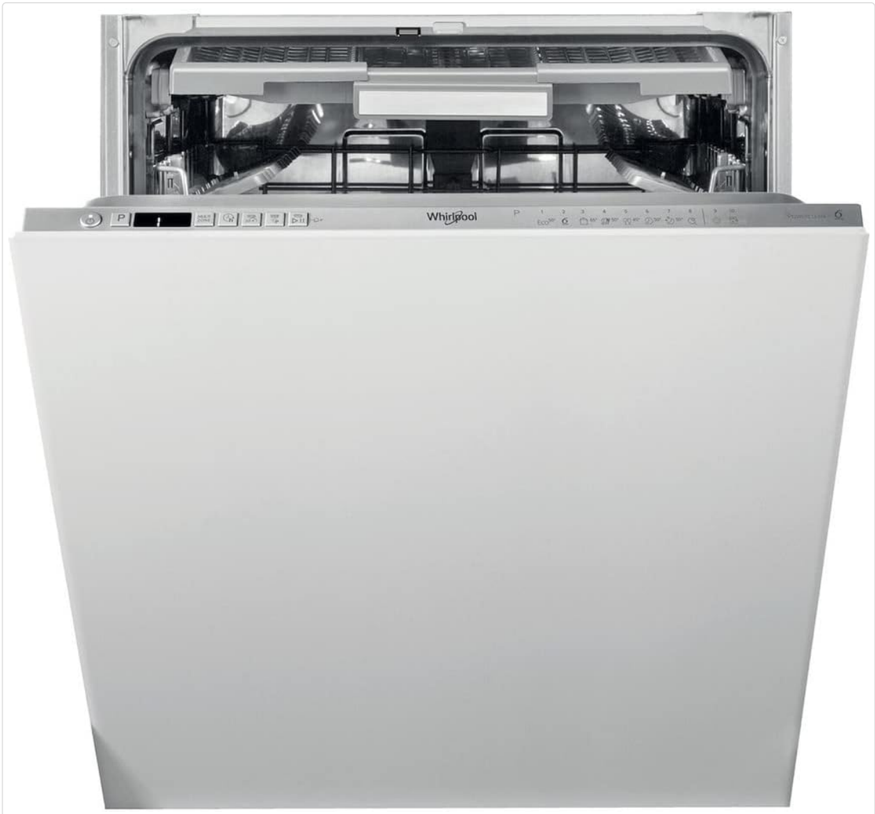
Figure 3.1: Front view of the Whirlpool WIO 3O540 PELG dishwasher with the door open, revealing the interior racks.

The Whirlpool WIO 3O540 PELG is a built-in dishwasher designed for seamless integration into your kitchen cabinetry. It features a 14 place setting capacity and a user-friendly control panel.