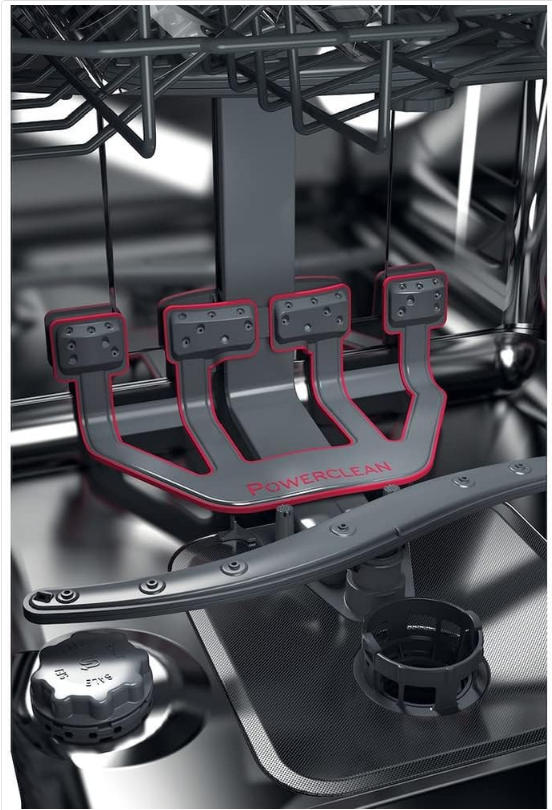
Figure 3.3: Interior view highlighting the PowerClean zone, equipped with specialized jets for stubborn dirt.