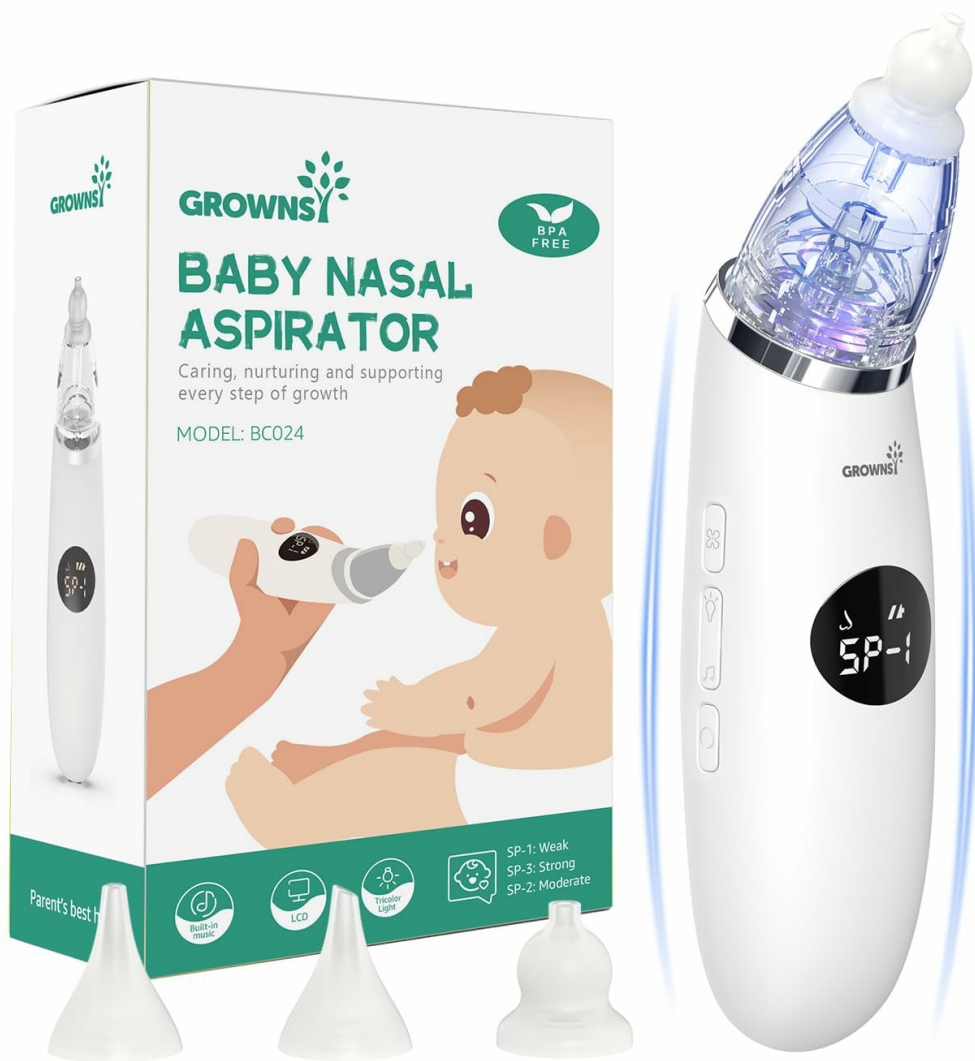
Figure 1: GROWNSY Electric Nasal Aspirator (Model BC024)

The GROWNSY Nasal Aspirator is a compact, handheld device designed for ease of use and portability. It features a main body with control buttons, a transparent mucus collection chamber, and interchangeable silicone tips. An LED display indicates suction level and battery status.