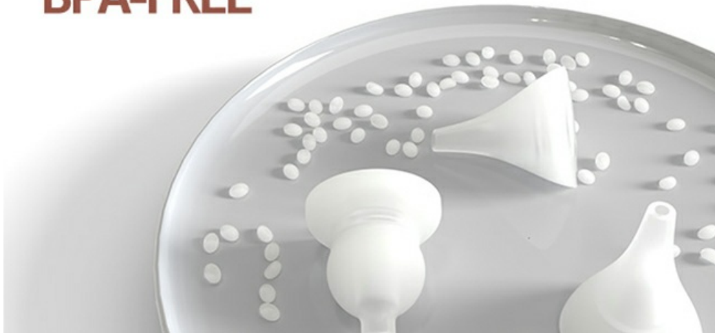
Figure 9: BPA-Free Silicone Tips

The nasal tips are made from soft, food-grade silicone and are BPA-free, ensuring ultimate safety and comfort for your baby's delicate nose.