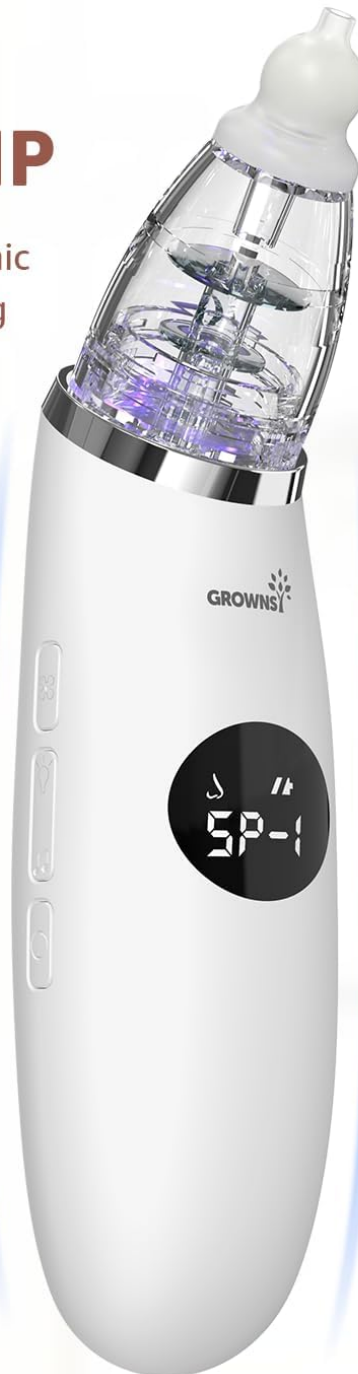
Figure 4: Ergonomic Buttons & Grip

Engineered with an exclusive ergonomic design, the device ensures effortless handling and optimal comfort during use. The scientific grip helps prevent accidental drops.