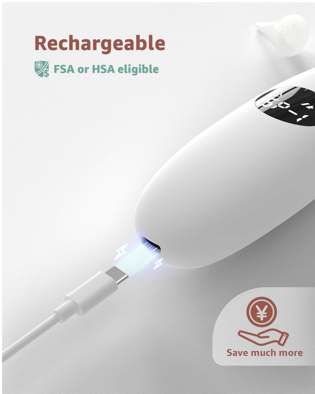
Figure 6: USB Charging Port

The device is USB rechargeable, offering approximately 120 minutes of use on a full charge. This ensures portability and convenience. Note: The aspirator will not operate while charging.