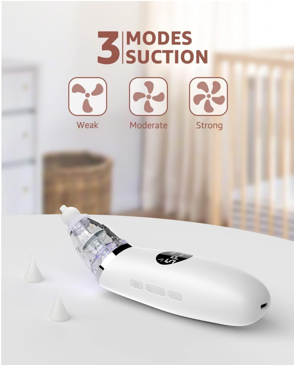
Figure 3: Three Adjustable Suction Modes

The aspirator offers three adjustable suction levels (Weak, Moderate, Strong) to effectively clear different consistencies of mucus. Adjust the mode based on your baby's age and congestion level.