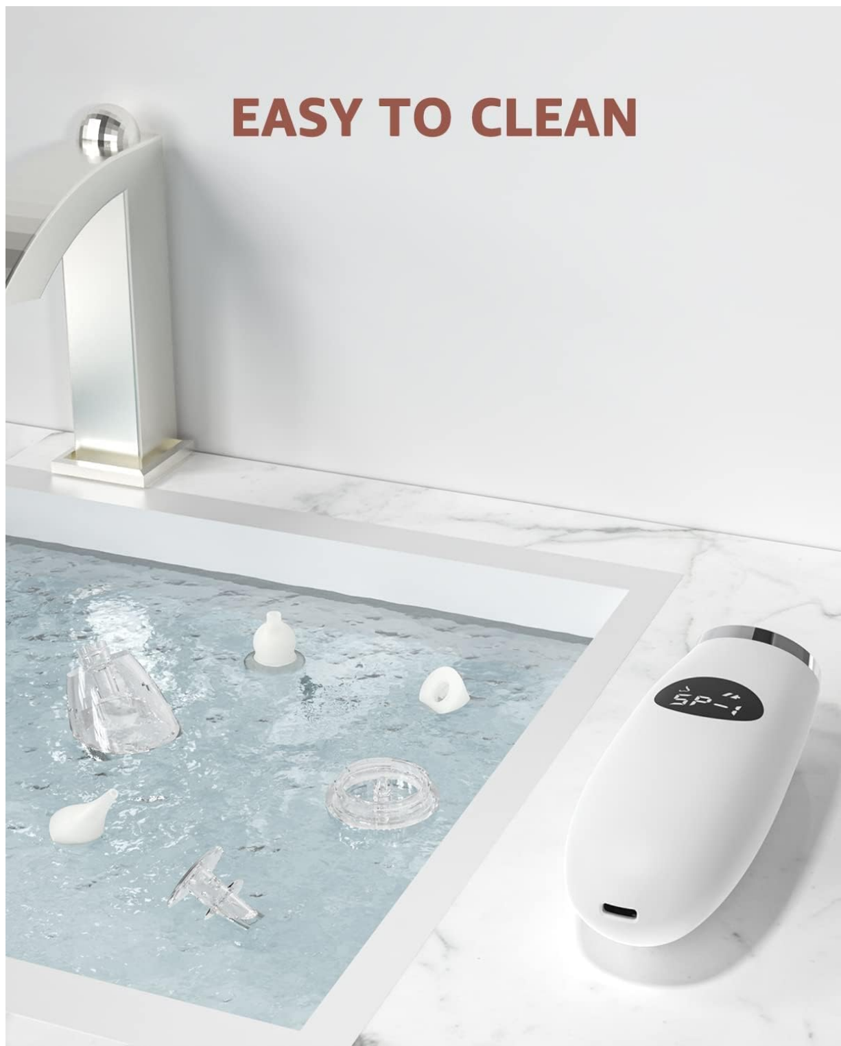
Figure 10: Easy-to-Clean Components