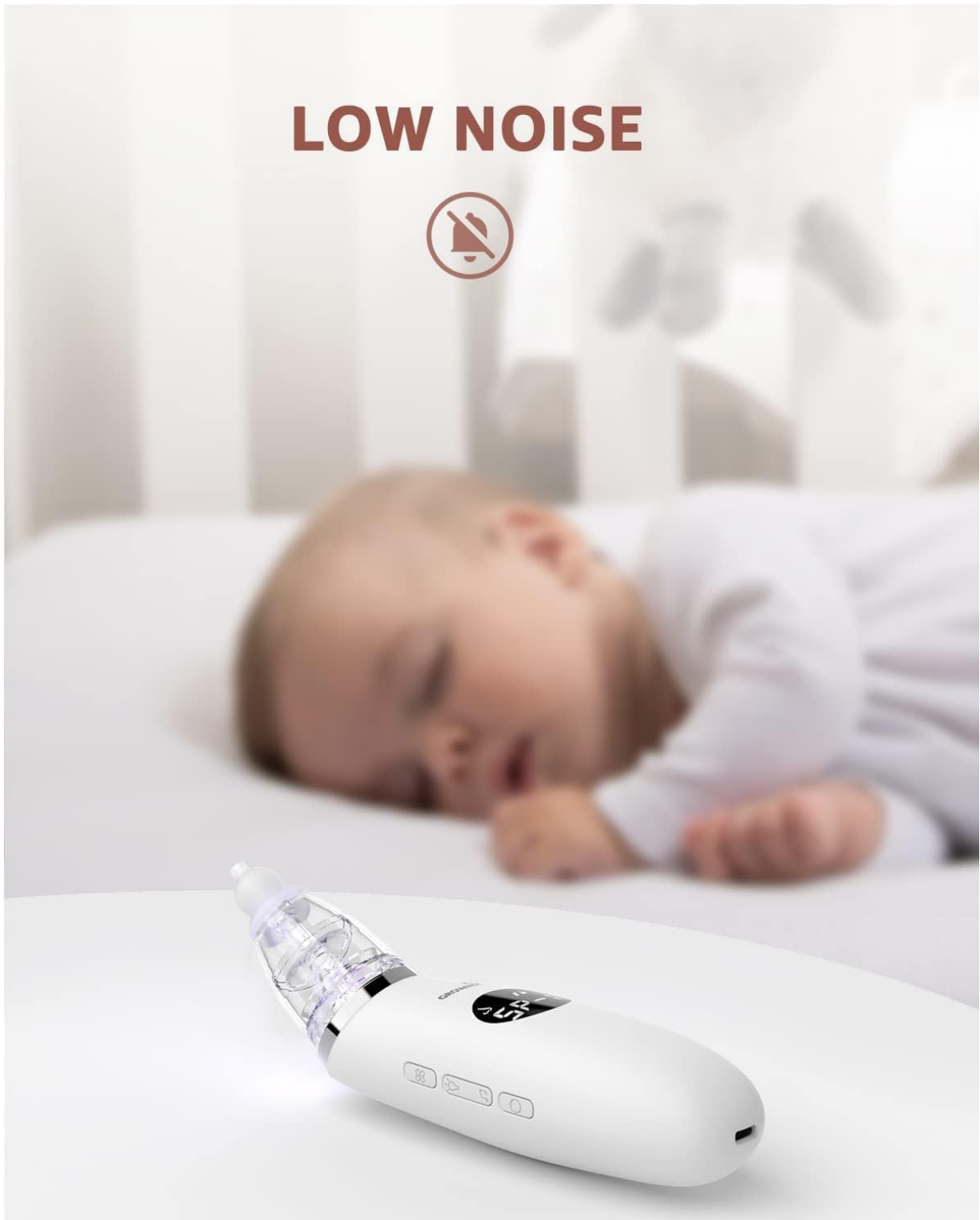
Figure 7: Low Noise Operation

Designed for quiet operation, the low noise level helps prevent startling your baby, making the suction process calmer.