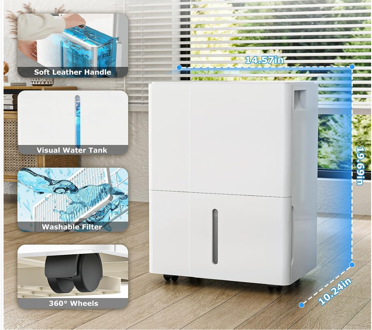
Figure 2.3: Features for easy mobility and maintenance, including a soft leather handle, visual water tank, washable filter, and 360° wheels.