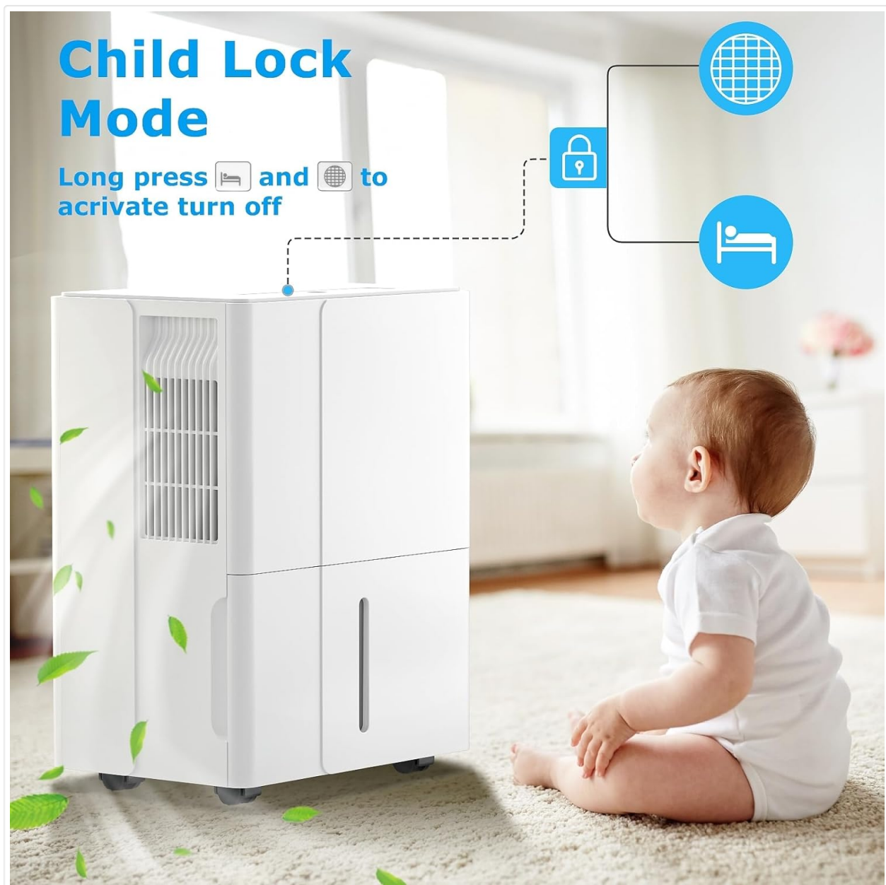
Figure 4.3: The Child Lock Mode prevents unintended operation, ideal for households with children.