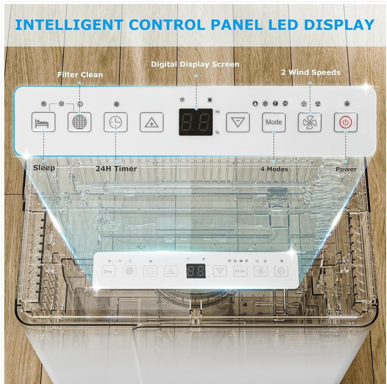
Figure 4.1: Detailed view of the intelligent control panel and LED display, showing various function buttons.

The ZAFRO D6550 features an intuitive LED digital control panel on the top of the unit. The current humidity level is also displayed on the front of the unit for easy monitoring.