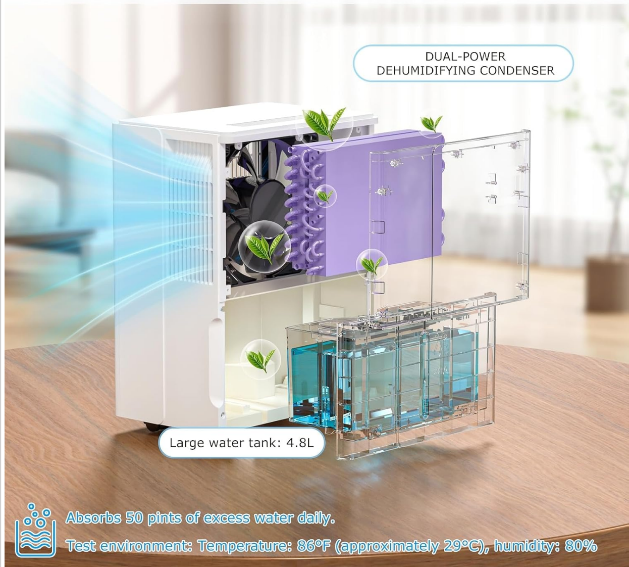
Figure 2.1: Front view of the ZAFRO D6550 Dehumidifier, showcasing its compact and modern design.