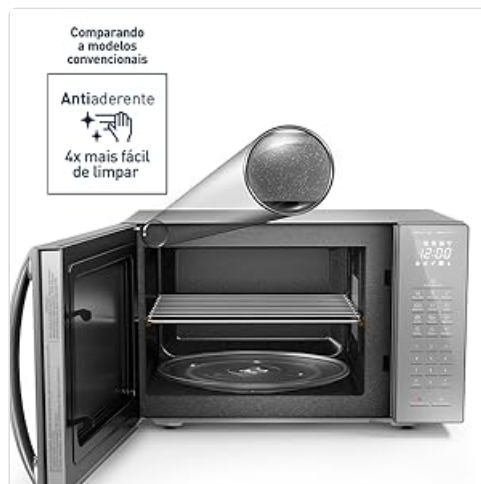
Figure 9: The non-stick interior coating simplifies cleaning.