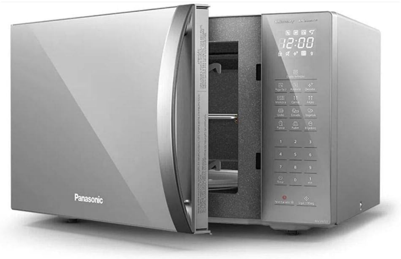
Figure 2: Interior view of the microwave with the door open.