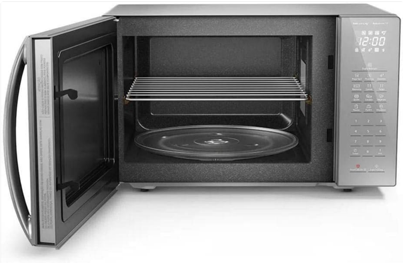
Figure 3: Interior of the microwave showing the glass turntable and the removable rack.