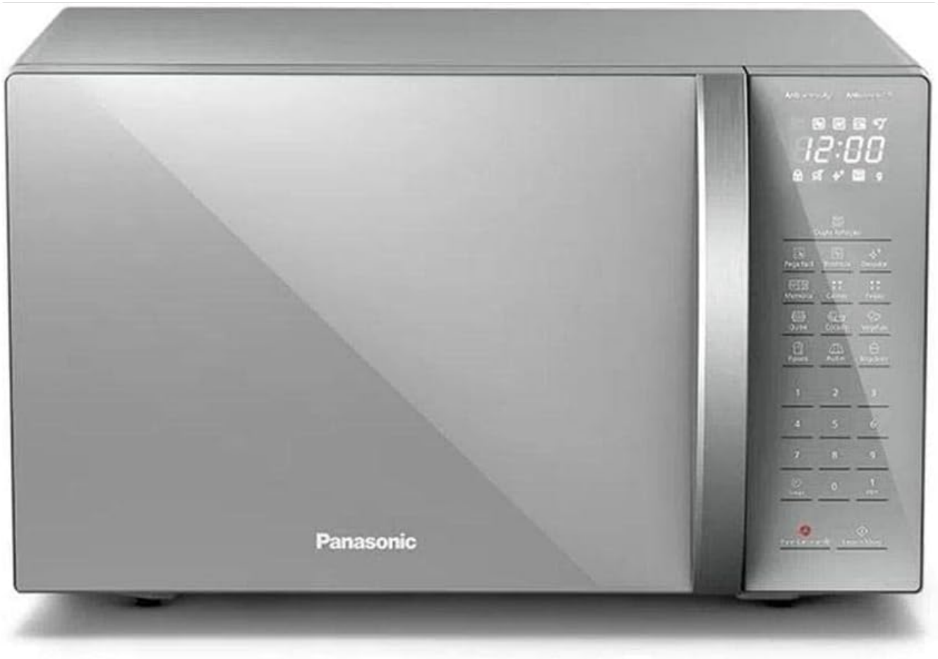
Figure 1: Front view of the Panasonic 34L Stainless Steel Microwave.