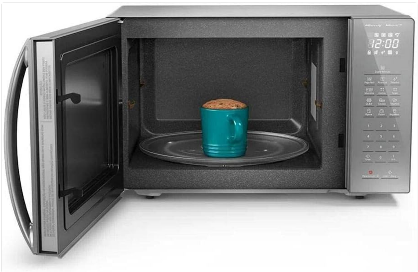
Figure 6: Easy Grab feature, showing a mug on the turntable.