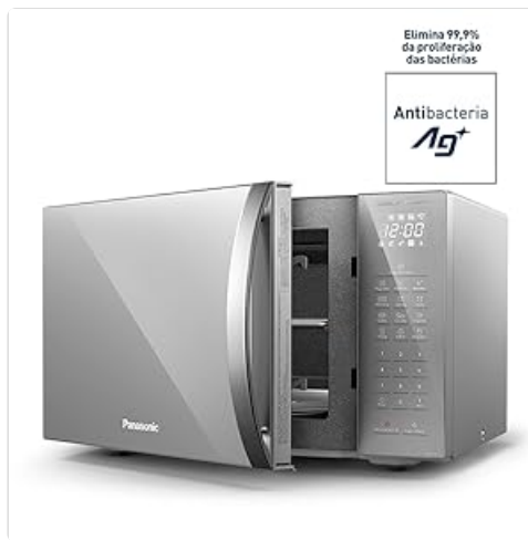
Figure 8: Antibacterial Ag+ interior for enhanced hygiene.