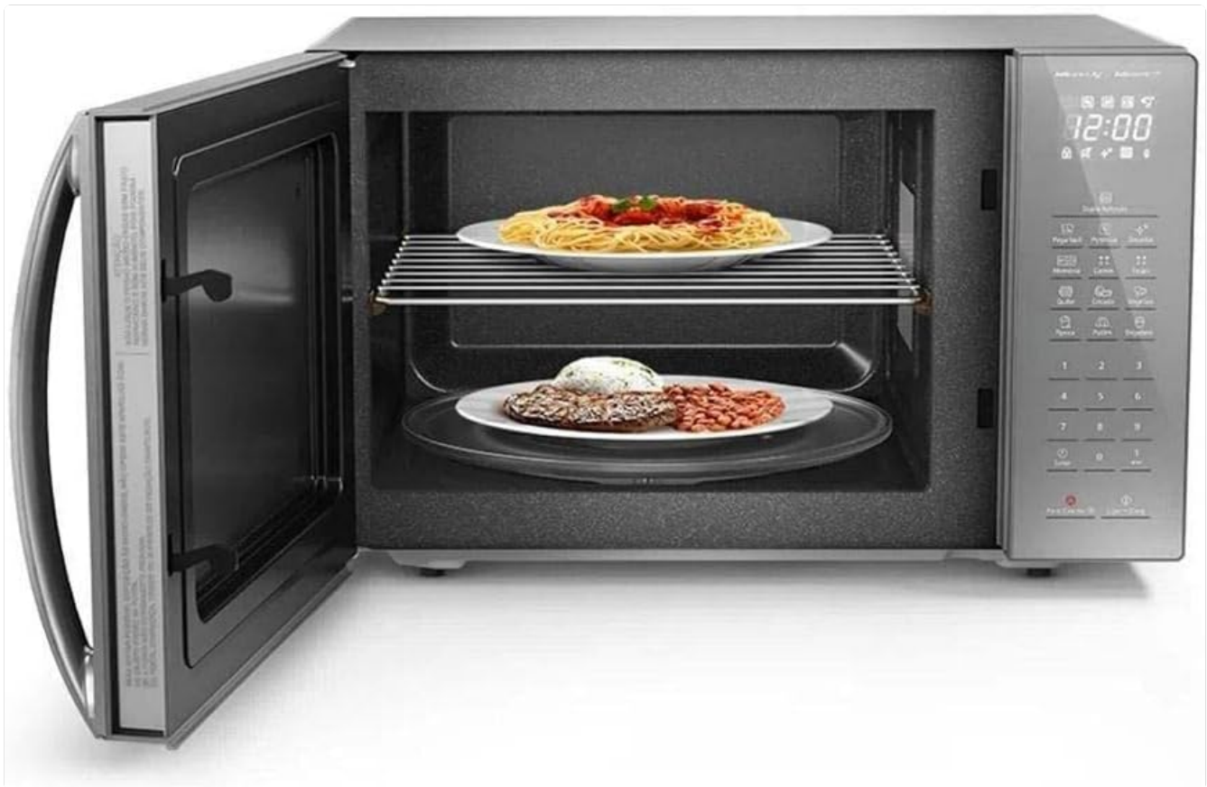
Figure 4: Dual Meal function in use, heating two dishes.