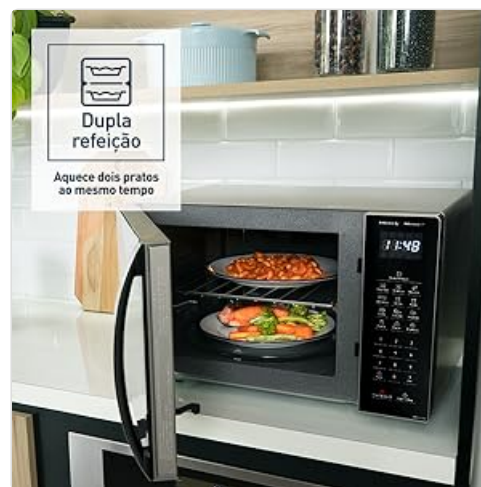
Figure 5: Detailed view of the Dual Meal function.