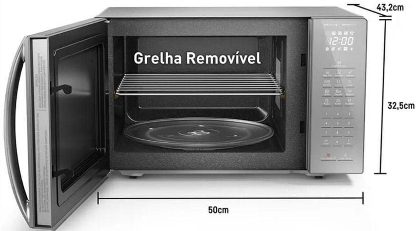
Figure 11: Product Dimensions.

Dupla refeição Aquece dois pratos ao mesmo tempo.