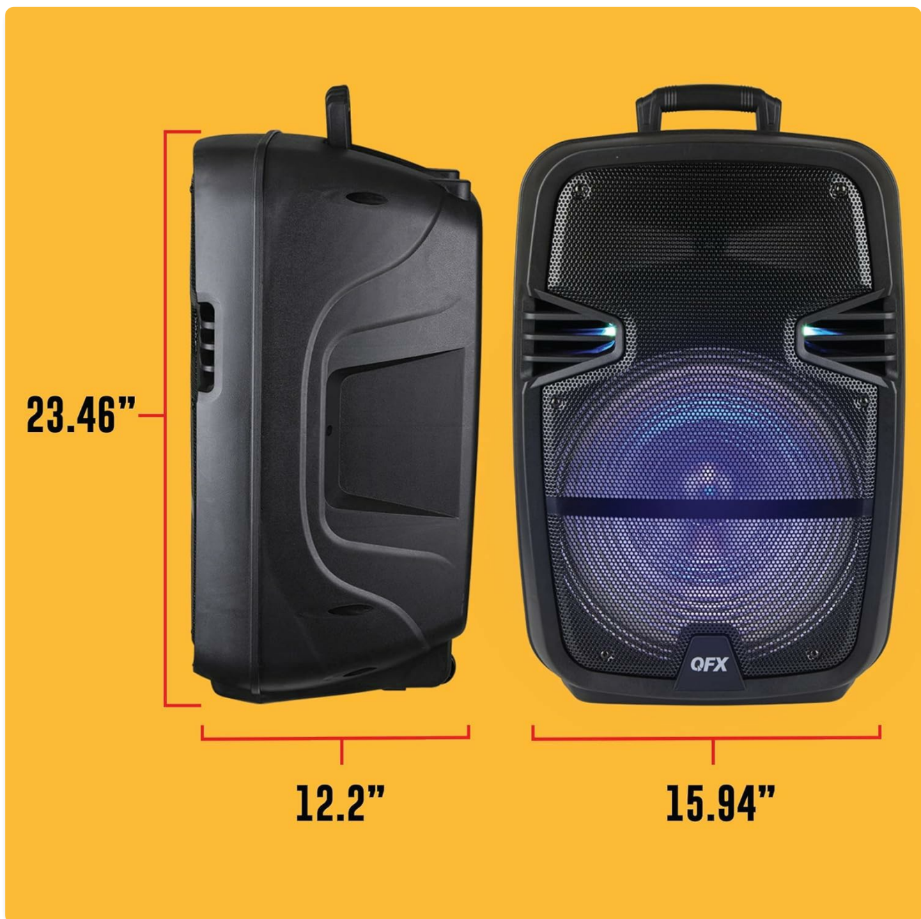
Figure 2: A clear front view of the QFX PBX-616SM speaker, highlighting its robust grille and integrated LED lights. This perspective is useful for understanding the speaker's primary sound output area.