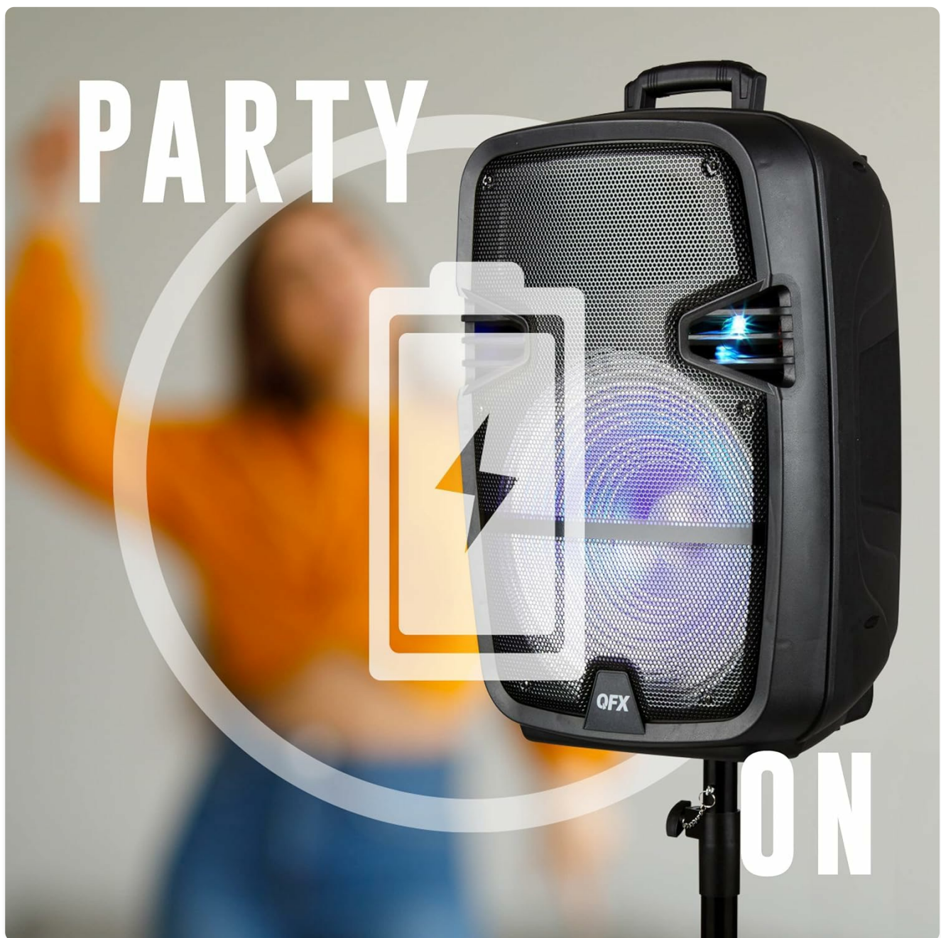
Figure 4: An image highlighting the rechargeable battery feature of the QFX speaker, emphasizing its capability for extended use without constant power connection.