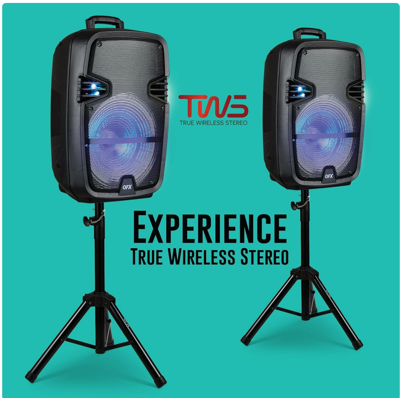
Figure 11: The QFX speaker with its LED party lights activated, demonstrating the colorful and dynamic visual effects that accompany the audio playback.