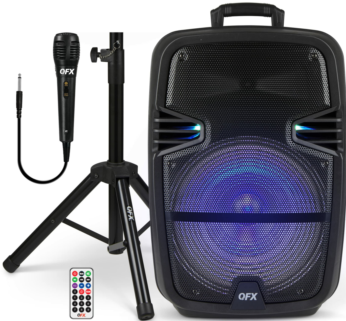
Figure 1: The QFX PBX-616SM speaker system, showcasing the main speaker unit, wired microphone, adjustable speaker stand, and remote control. All essential accessories are provided for immediate use.