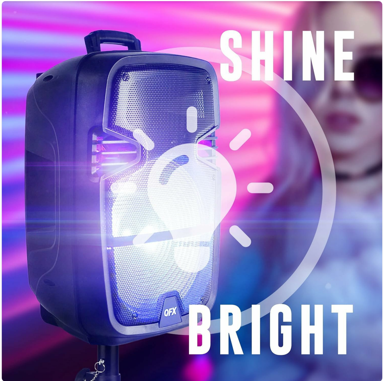
Figure 8: This image visually represents the FM tuner capability of the QFX speaker, indicating its ability to receive and play radio broadcasts.

To use the FM radio function, press the MODE button to switch to FM mode. The speaker will automatically scan and save available radio stations. Use the Next/Previous buttons to switch between saved stations.