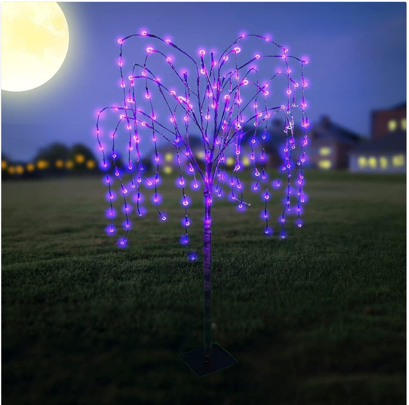
Image: The assembled tree with branches adjusted, glowing purple in an outdoor night scene.