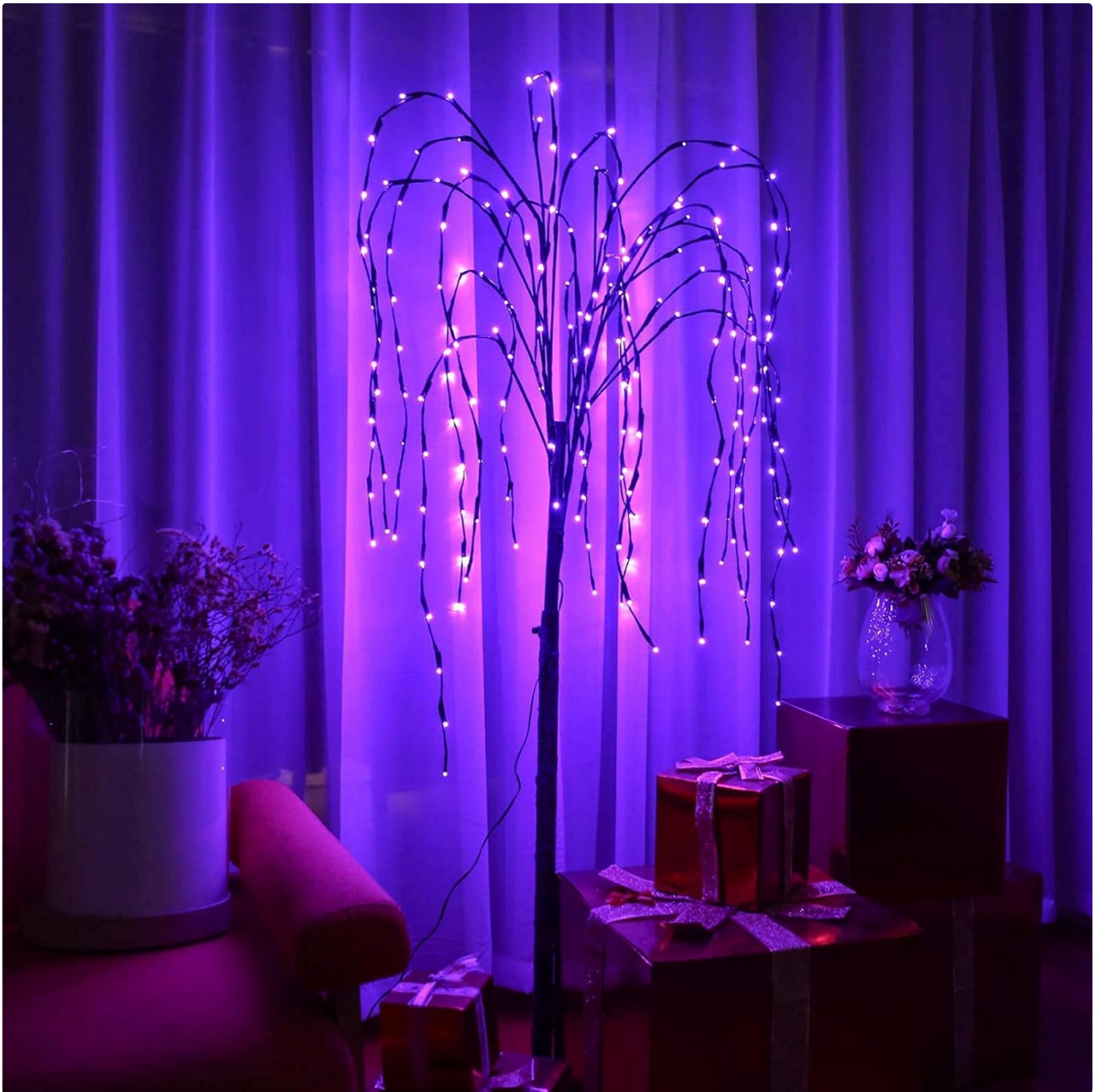
Image: The willow tree lights glowing purple, suitable for indoor decorative use.