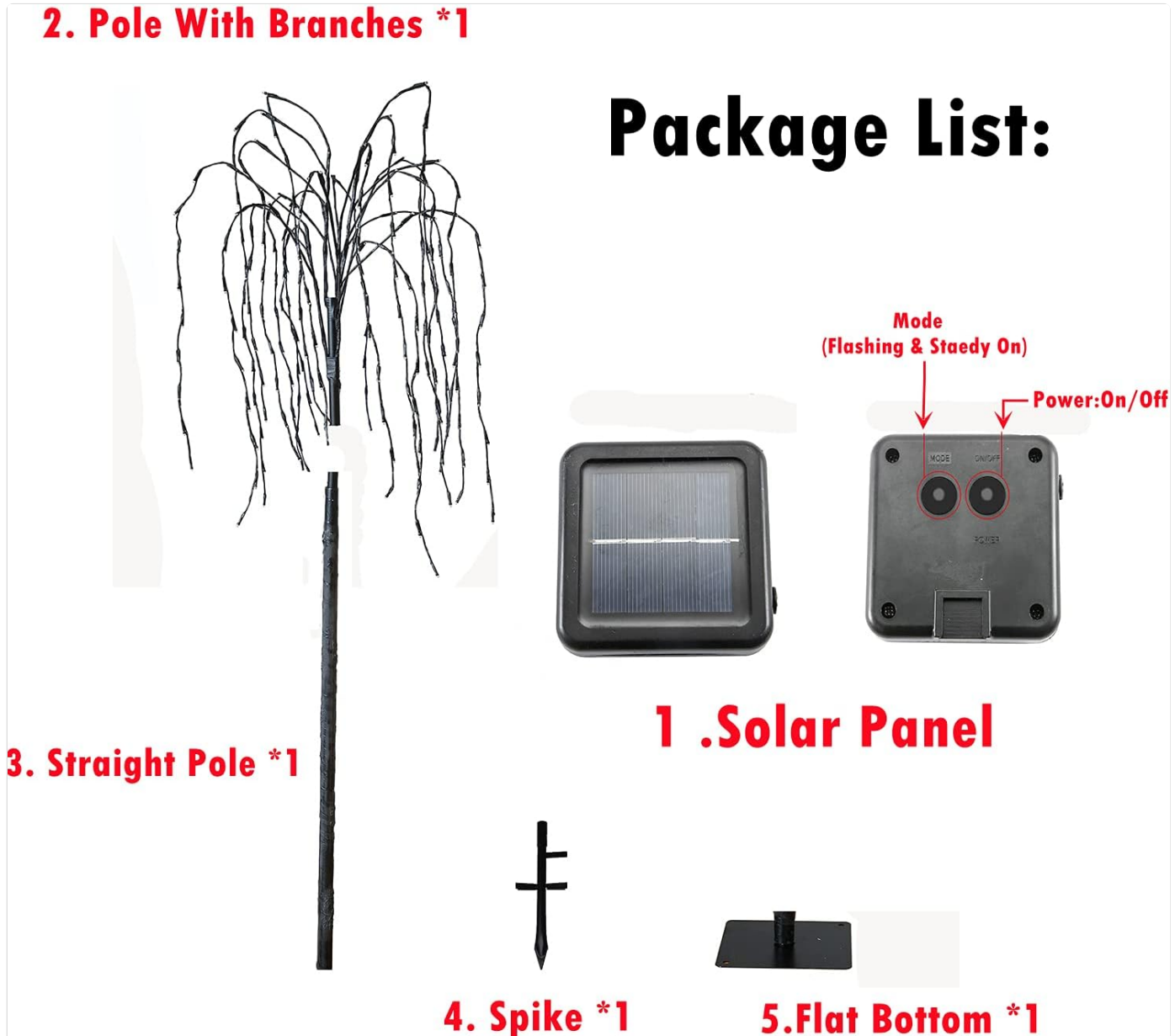
Image: Visual representation of the package contents, including the main tree components and mounting options.