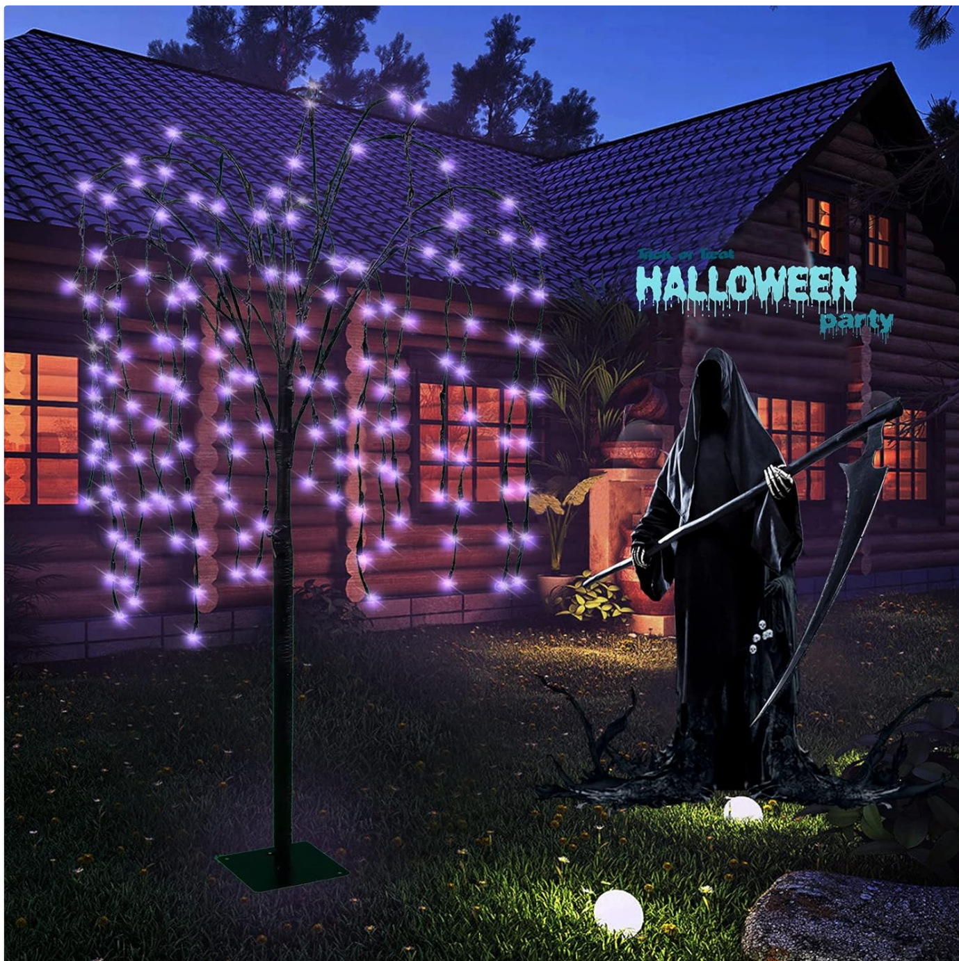
Image: The JOINTWIN LED Solar Willow Tree Lights creating a vibrant purple glow in an outdoor setting, complementing Halloween decor.