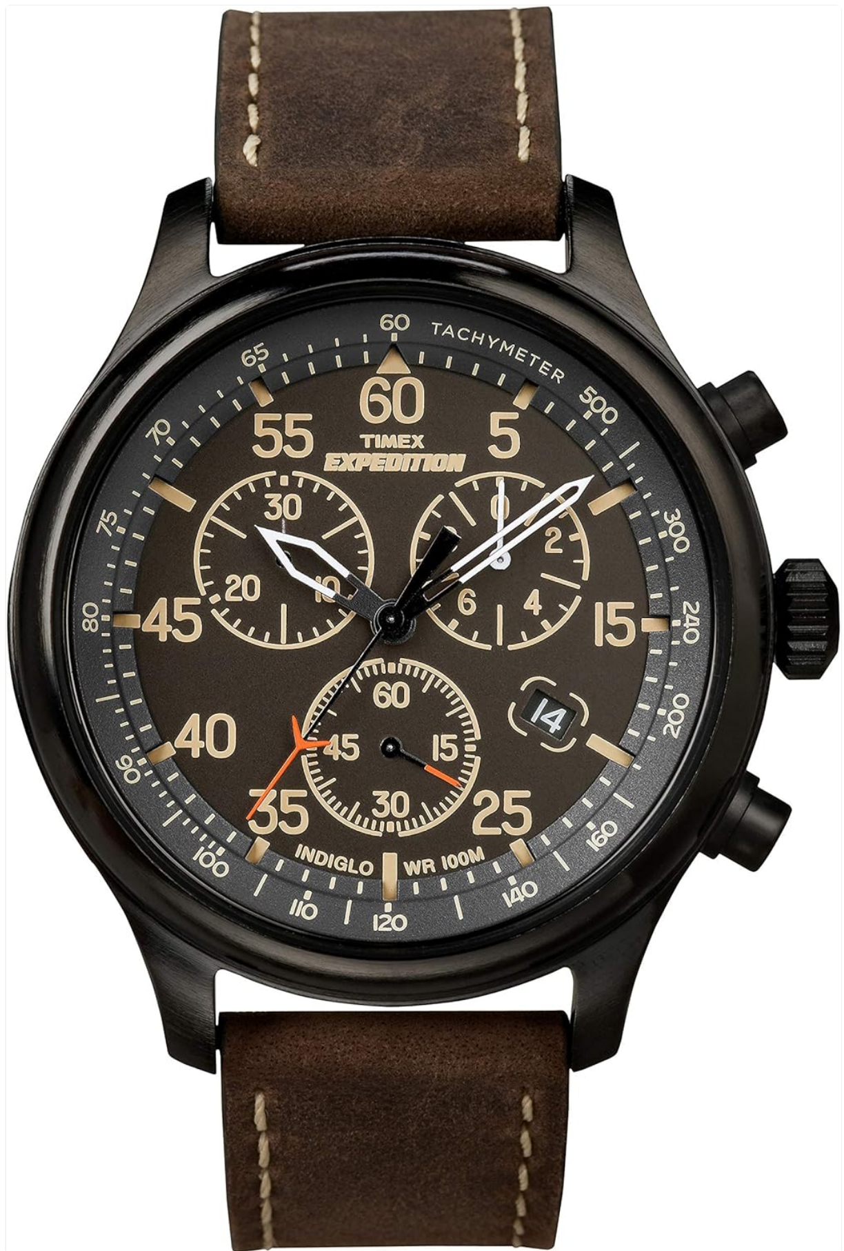
Figure 1: Front view of the Timex Expedition Field Chrono 43mm watch. This image displays the watch face with its chronograph subdials, Arabic numerals, and brown leather strap.