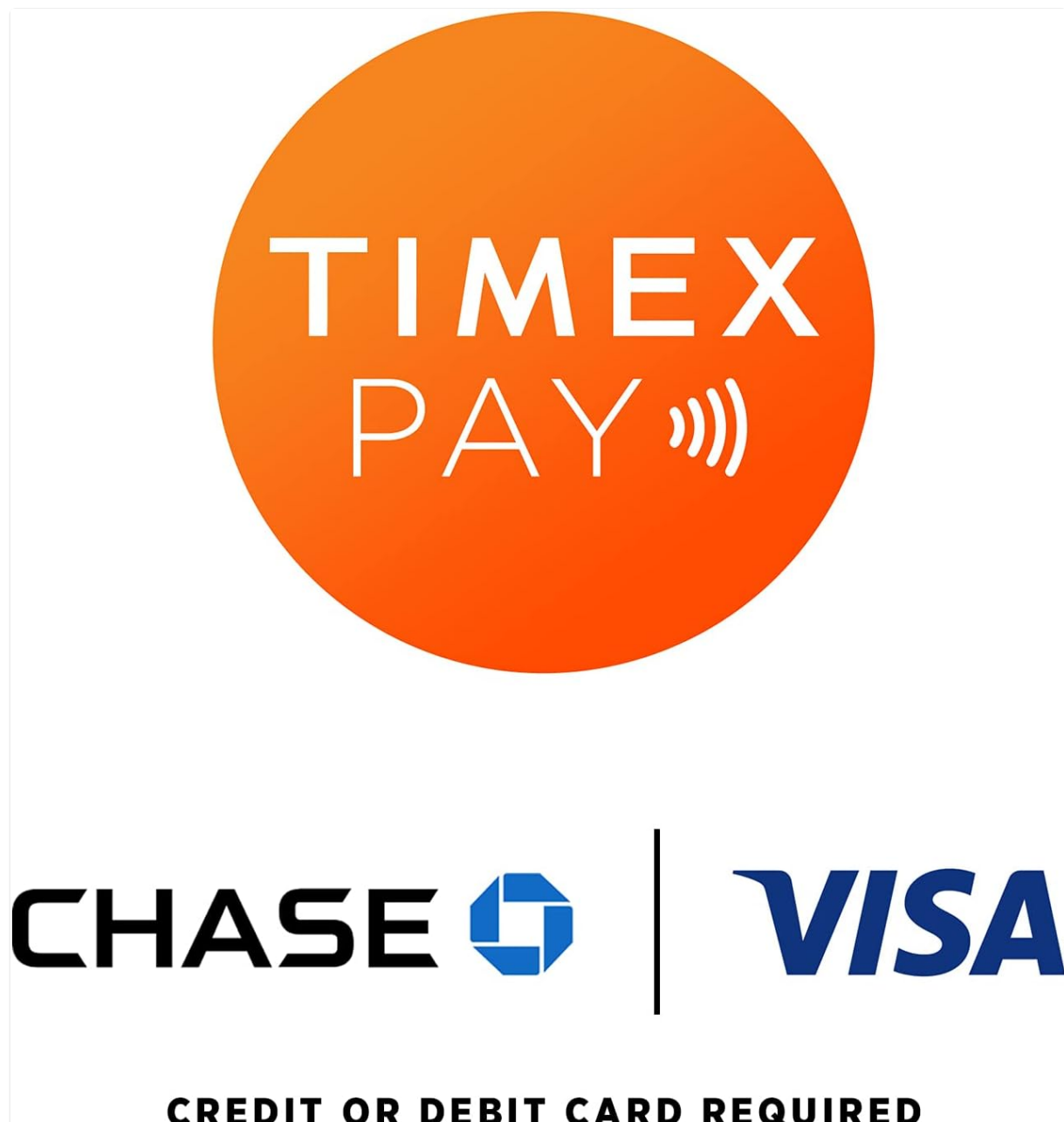
Figure 6: Illustration showing the supported payment networks for Timex Pay, specifically Chase and Visa.