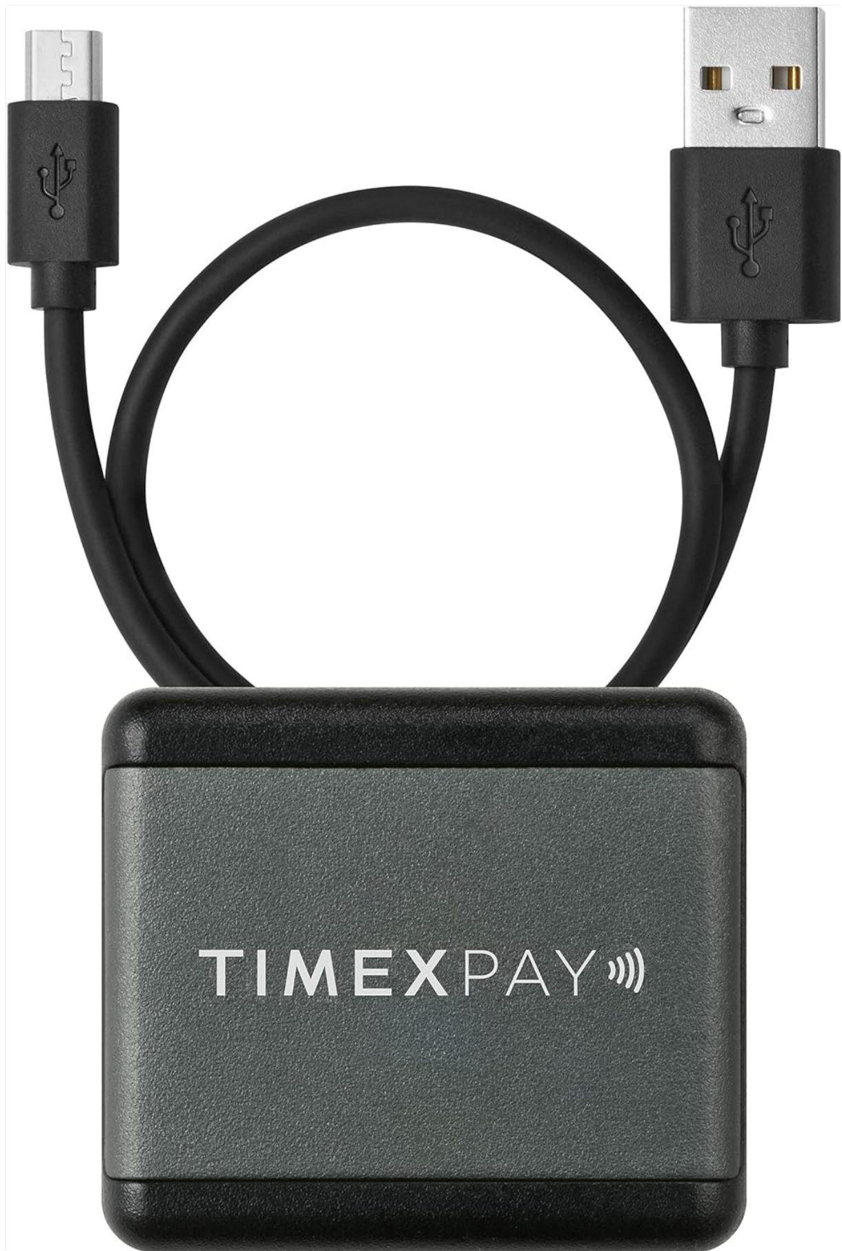
Figure 4: The Timex Pay UPPU clip, used for connecting the watch to the mobile application for payment setup.