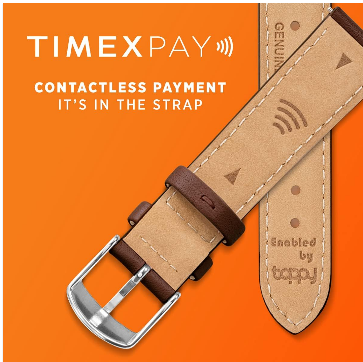
Figure 5: Close-up view of the Timex Pay watch strap, showing the integrated contactless payment chip and "Enabled by Tappy" branding.