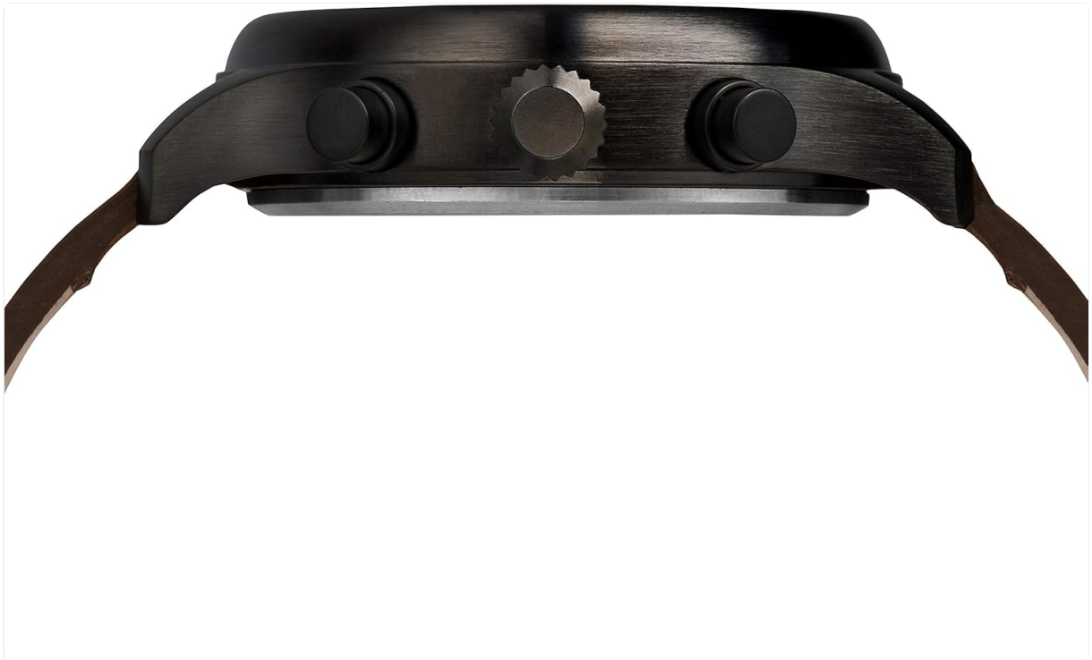
Figure 2: Side view of the Timex Expedition Field Chrono 43mm watch, showing the crown and pushers for chronograph functions.