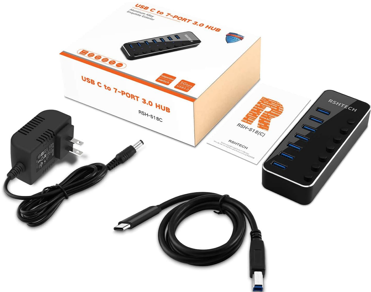
Figure 1: Package contents of the RSHTECH 7-Port USB C Hub.