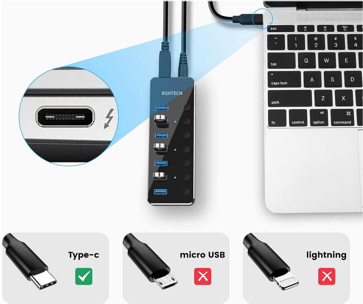
Figure 4: High-speed data transfer with USB 3.0 ports.