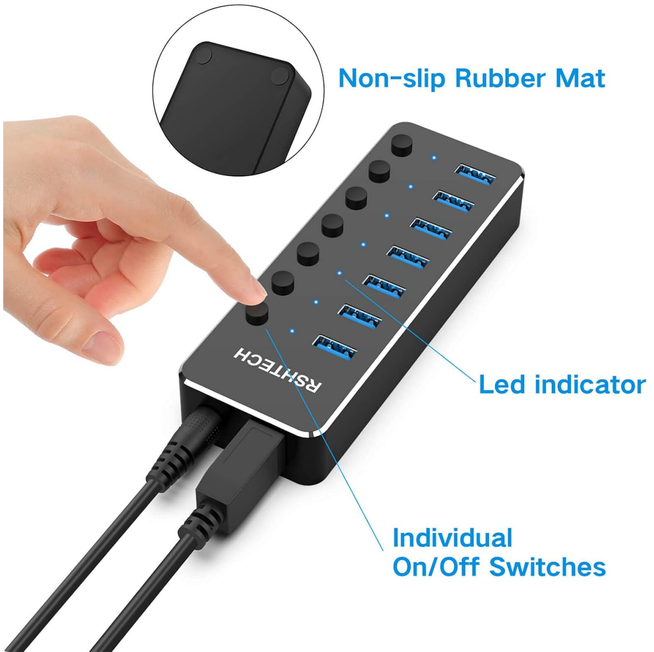
Figure 3: Individual on/off switches with LED indicators.