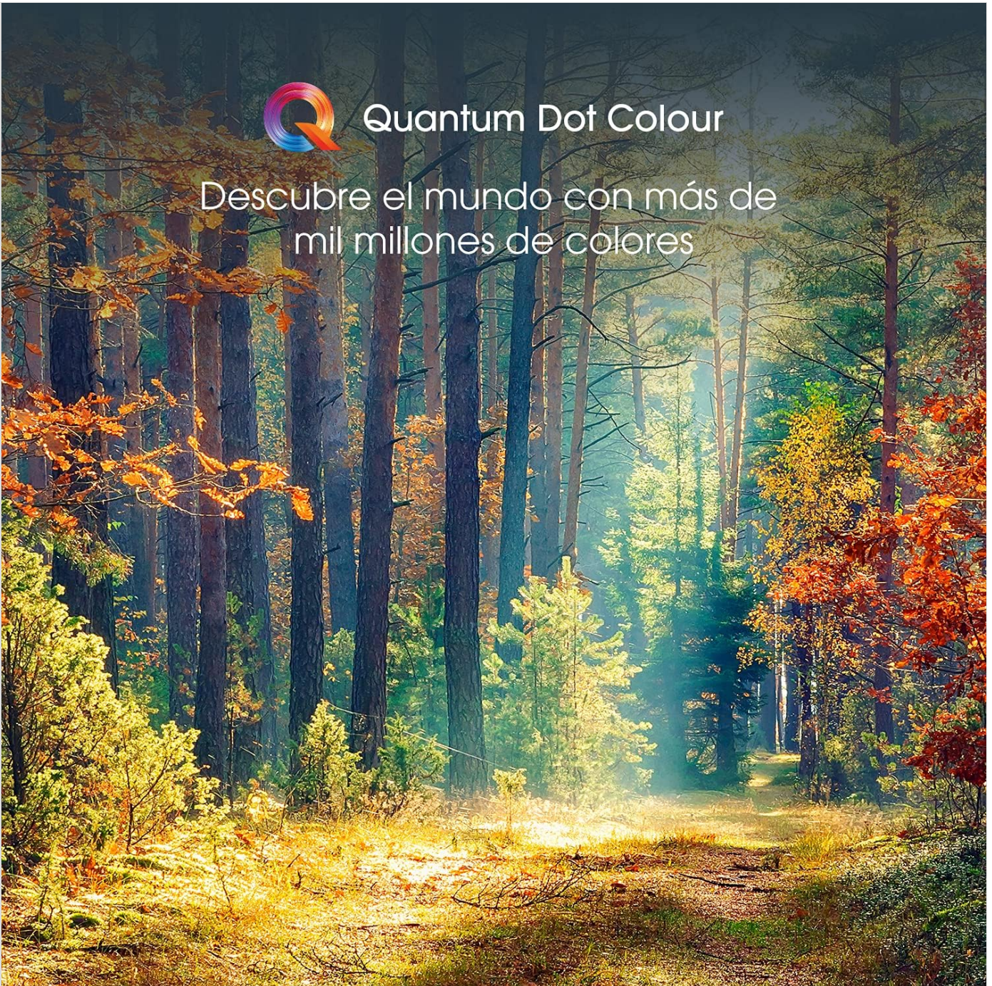
Figure 5: Quantum Dot Colour for vibrant and accurate colors.

Descubre el mundo con más de mil millones de colores