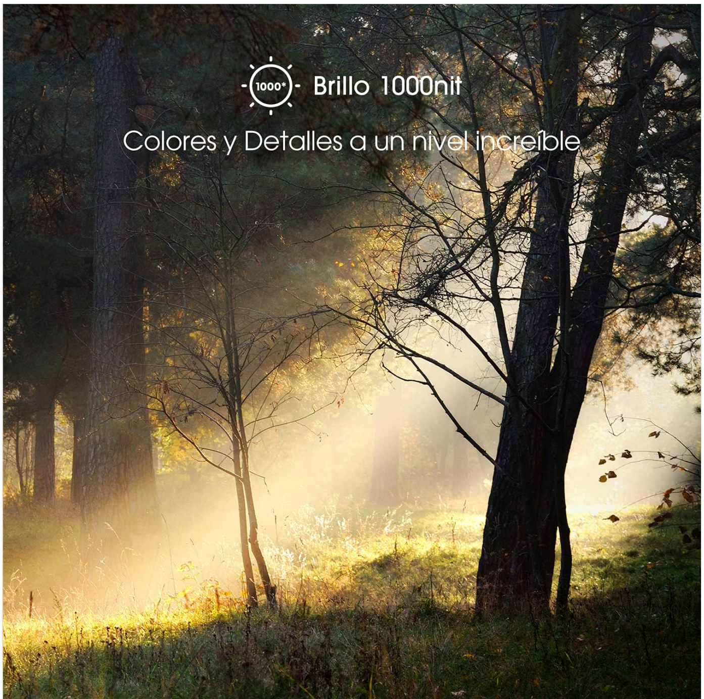
Figure 7: High peak brightness for vivid details.