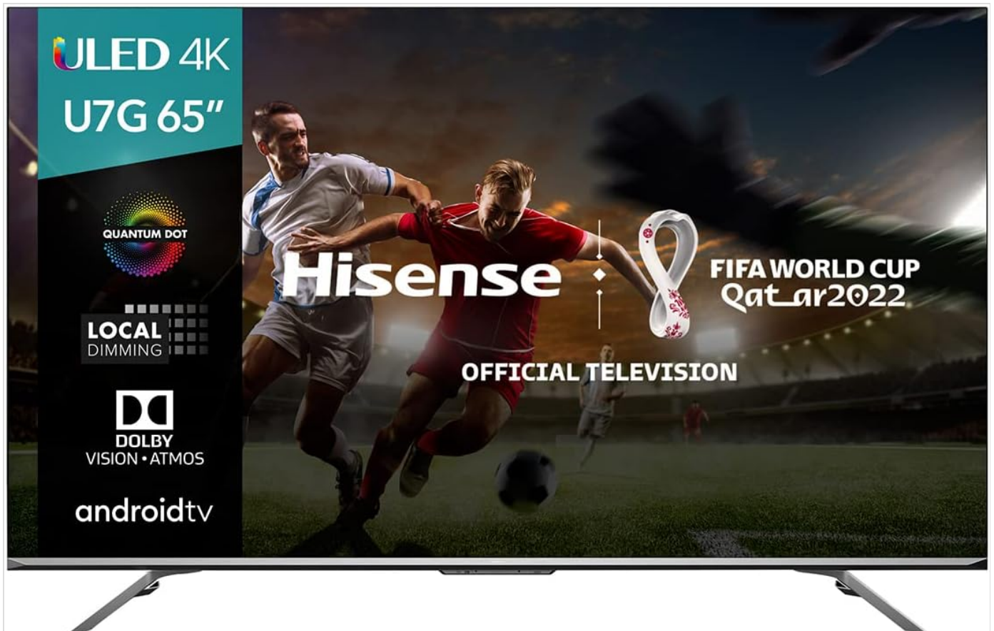
Figure 1: Hisense 65U7G QLED Series 65-inch Android 4K Smart TV.

This user manual provides essential information for the setup, operation, and maintenance of your Hisense ULED Premium 65U7G QLED Series 65-inch Android 4K Smart TV. Please read this manual thoroughly before using the product to ensure proper and safe operation. Keep this manual for future reference.