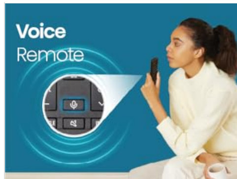
Figure 3: Voice Remote functionality for easy control.

The included remote control allows you to navigate the TV's features. It includes dedicated buttons for popular streaming services and a voice control button for Google Assistant.