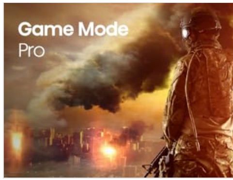
Figure 8: Game Mode Pro for optimized gaming performance.