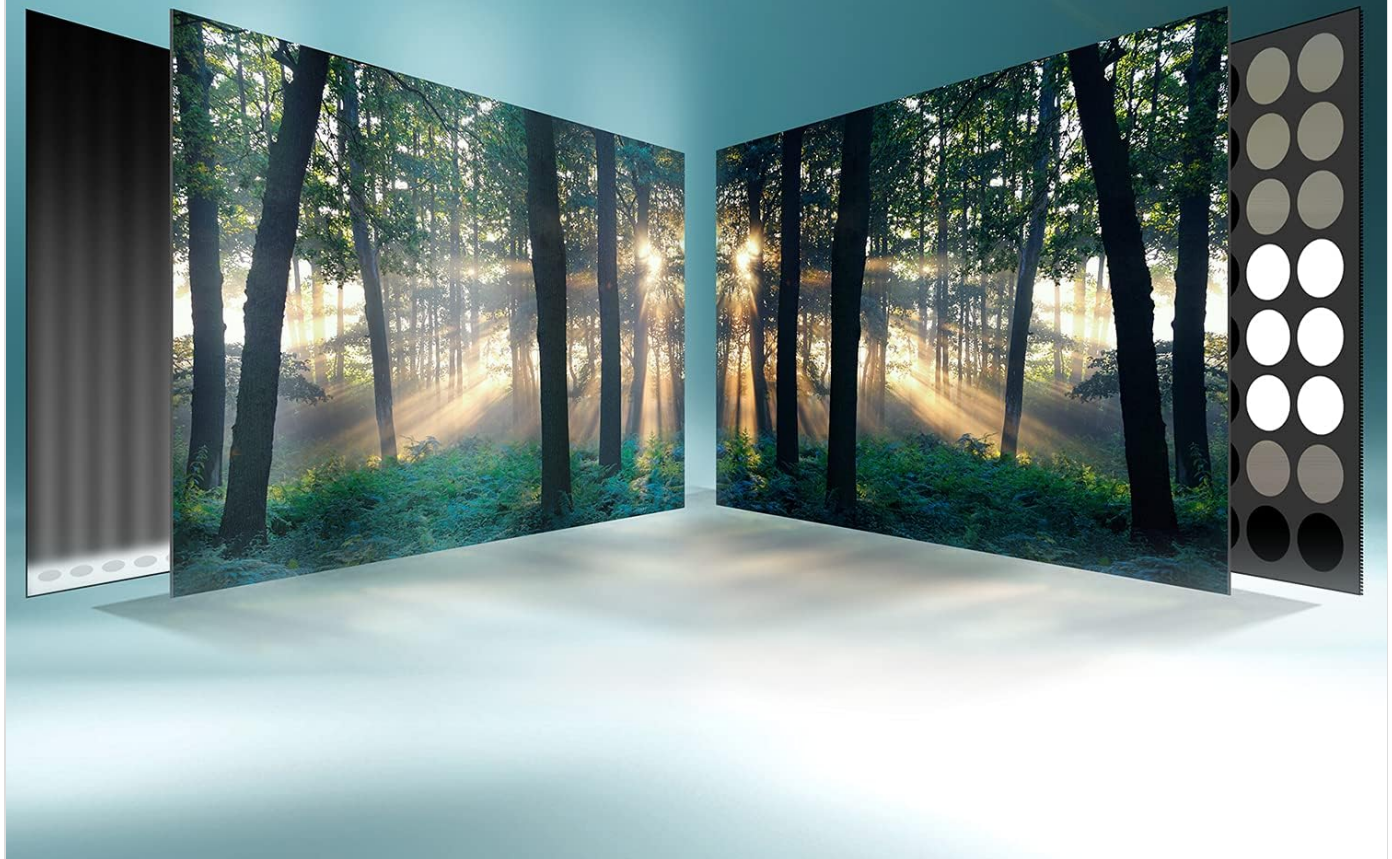
Figure 6: Full Array Local Dimming for enhanced contrast.

Control de Iluminación, Mejor Experiencia