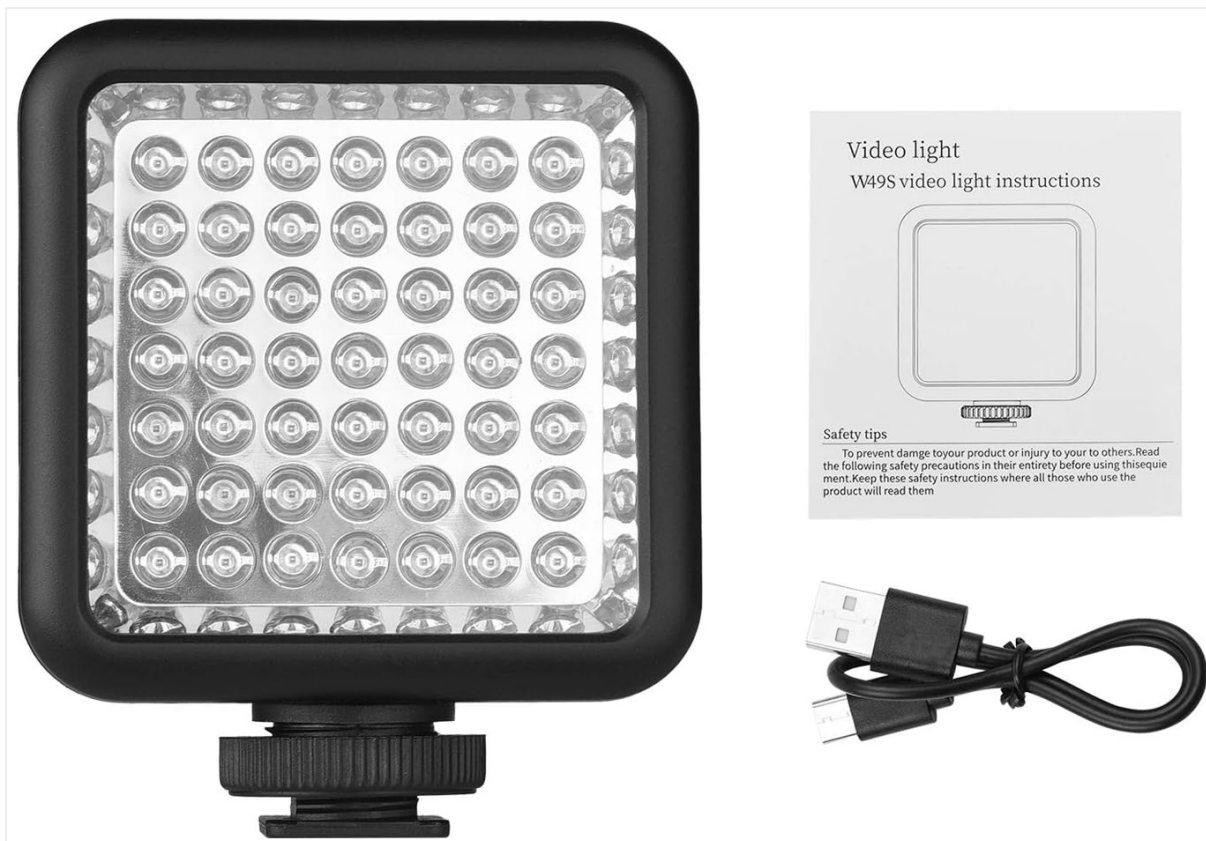
Figure 3.1: Contents of the Andoer Mini IR Night Vision Light package.