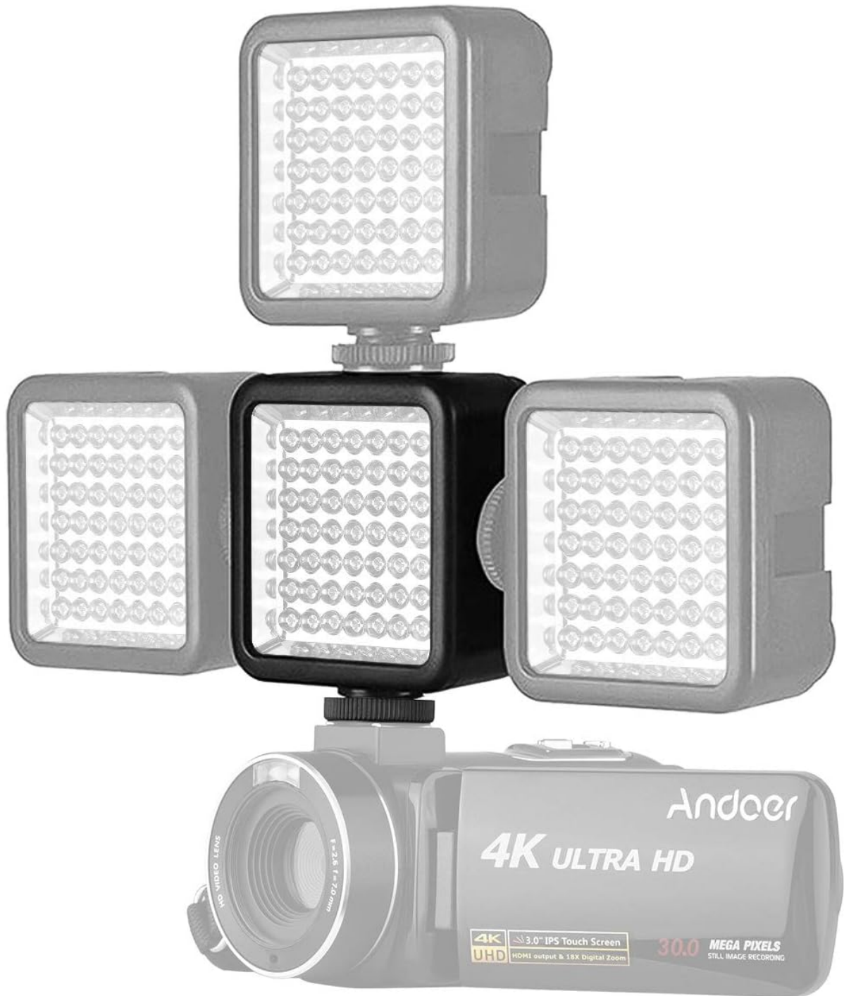
Figure 4.1: Illustration of the 3 cold shoe mounts design for multi-lamp splicing.