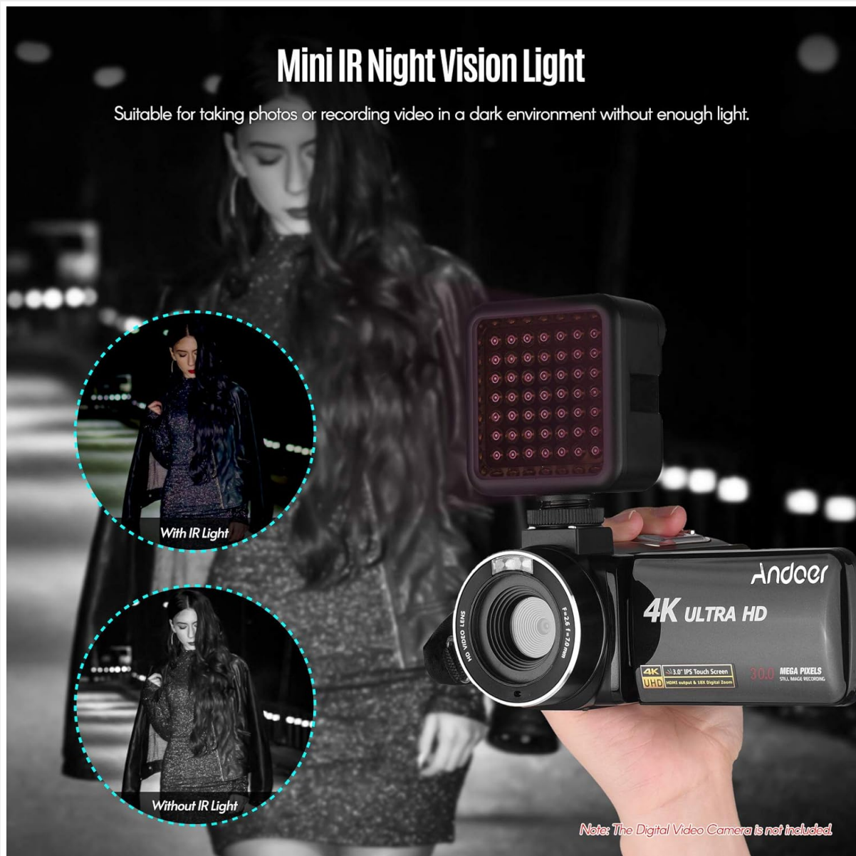
Figure 2.1: Andoer Mini IR Night Vision Light mounted on a camcorder, illustrating its effect in low light.

Suitable for taking photos or recording video in a dark environment without enough light.