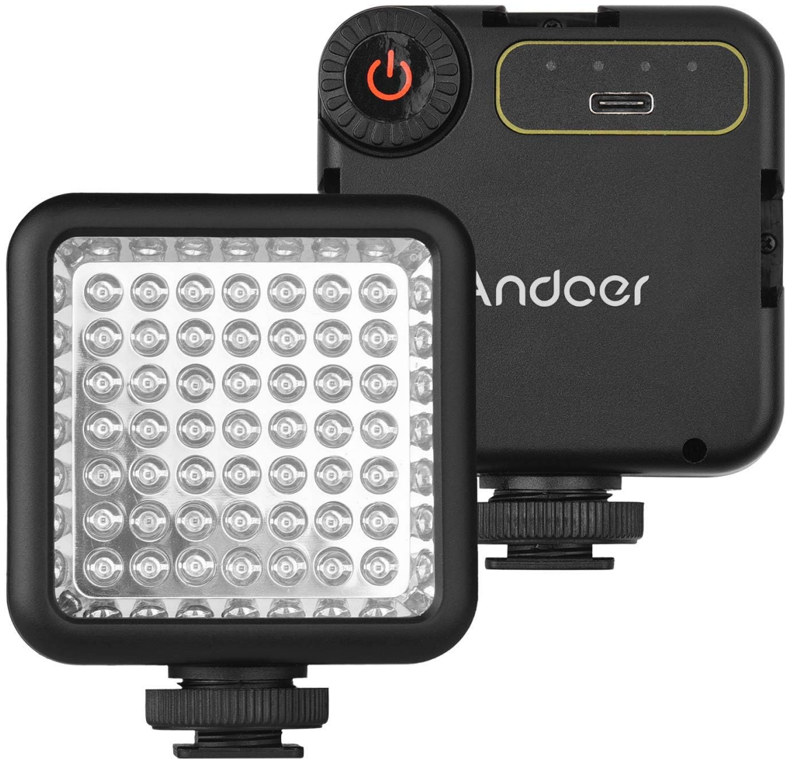
Figure 2.2: Front and back view of the IR light, highlighting key components.