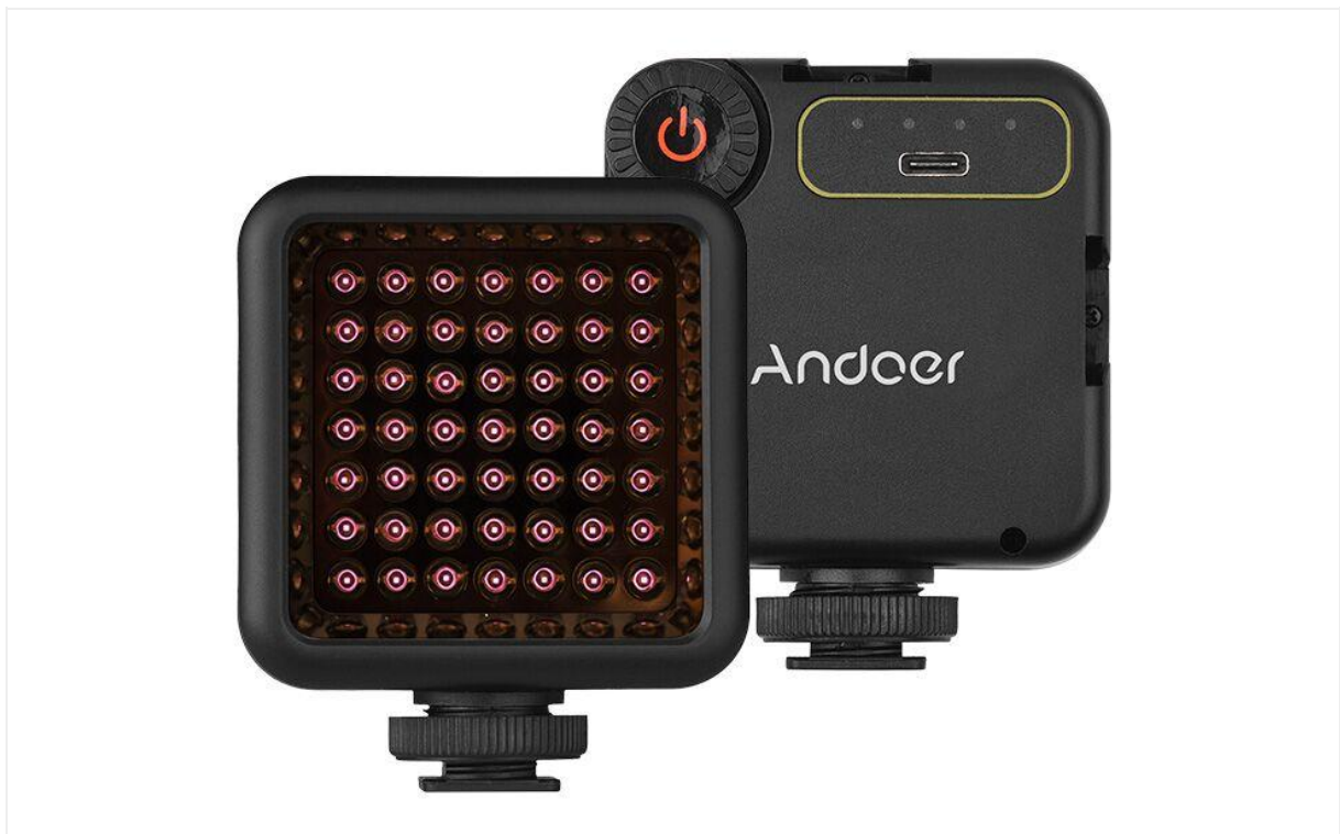
Figure 5.1: Example of night vision camera footage with and without the IR light.