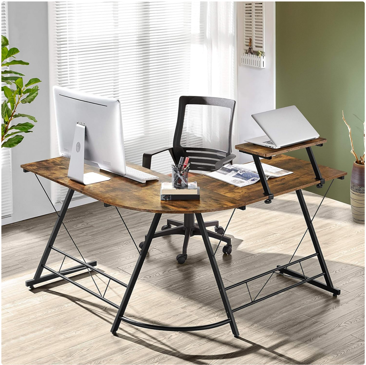
Image: The L-shaped desk integrated into a home office environment, demonstrating its spaciousness and functionality with a computer setup and office chair.