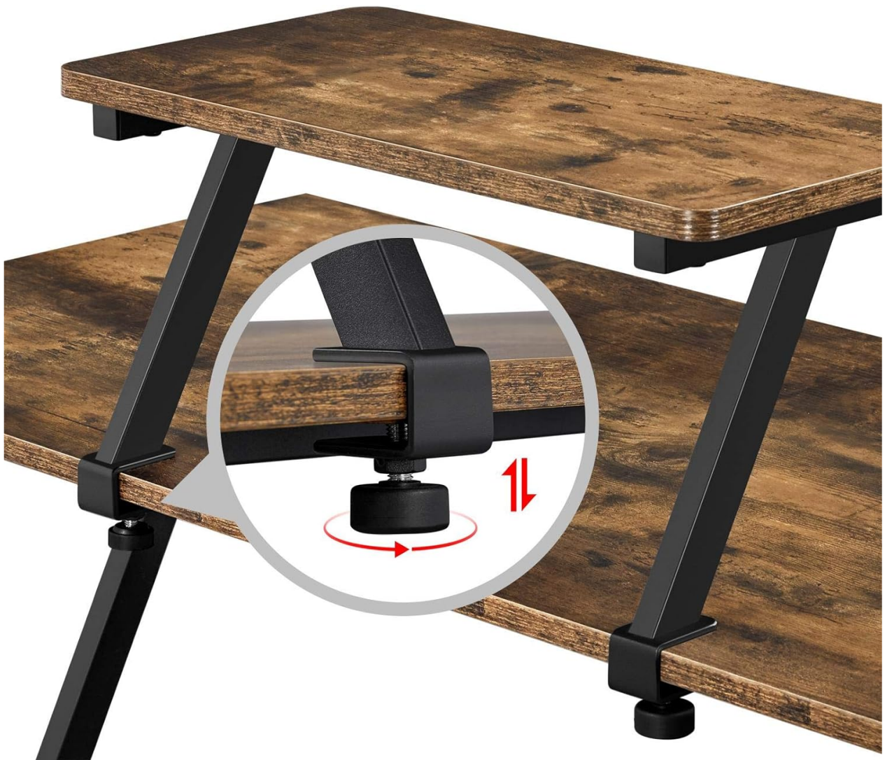
Image: A close-up view of the monitor stand's adjustable clamp, demonstrating how it attaches to the desk surface.