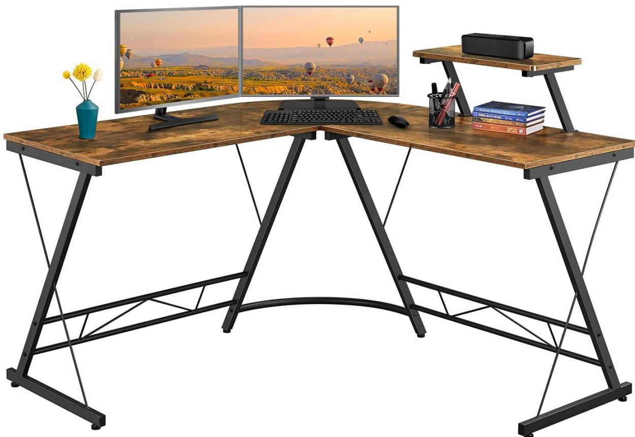
Image: The Yaheetech L-Shaped Corner Computer Desk, showcasing its design with two monitors and various office accessories.

This manual provides detailed instructions for the assembly, operation, and maintenance of your Yaheetech L-Shaped Corner Computer Desk. Please read all instructions carefully before beginning assembly and retain this manual for future reference. Ensure all components are present and undamaged before proceeding.