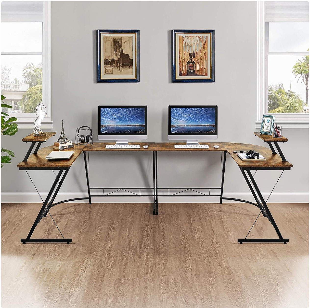
Image: The L-shaped desk in use, showing a monitor placed on the main surface and a laptop positioned on the elevated monitor stand.