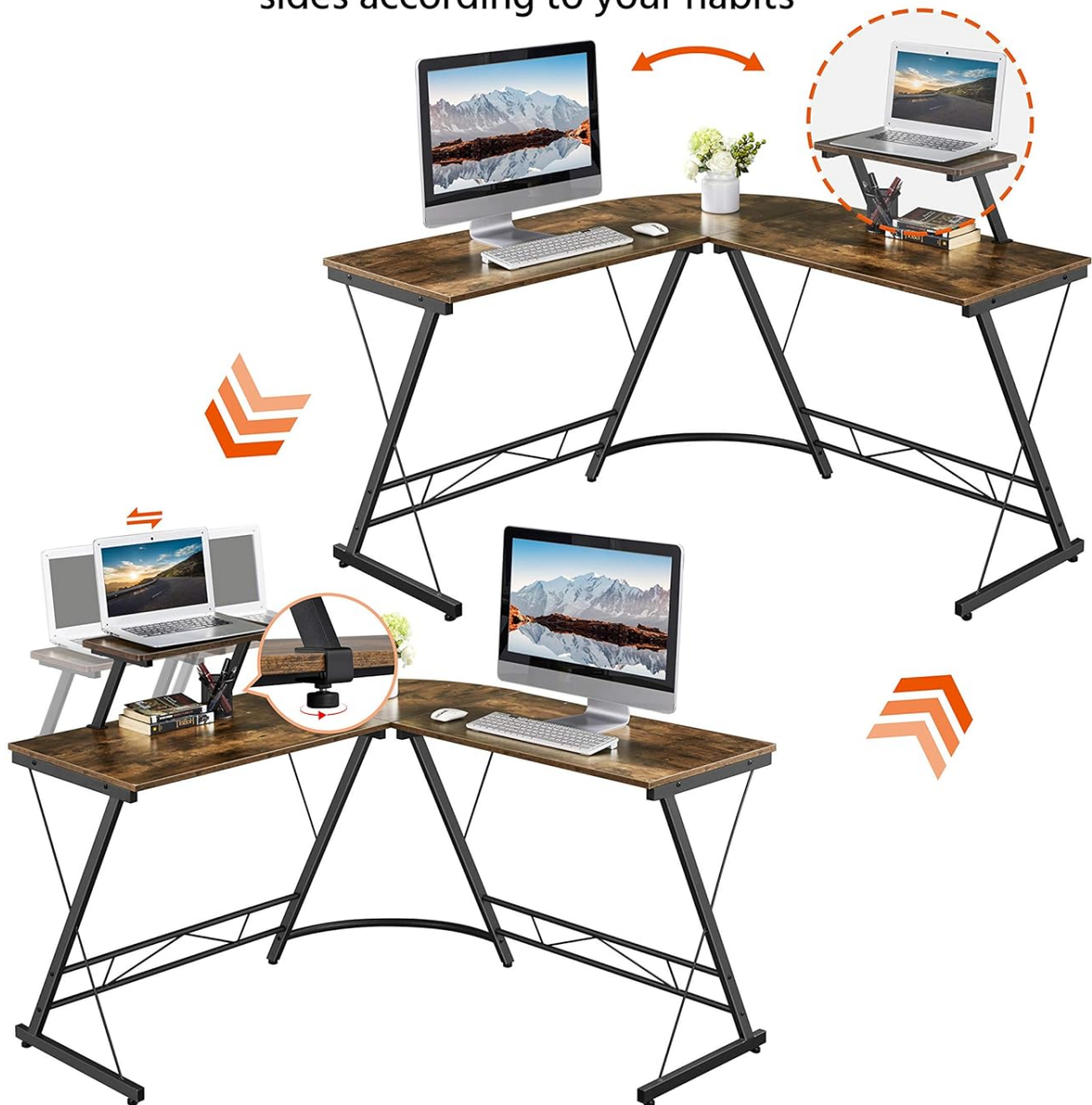
Image: A visual representation of the desk's convertible design, demonstrating how the two main sections can be reconfigured to fit different room layouts.

Change the position and direction of the table on the left/right sides according to your habits