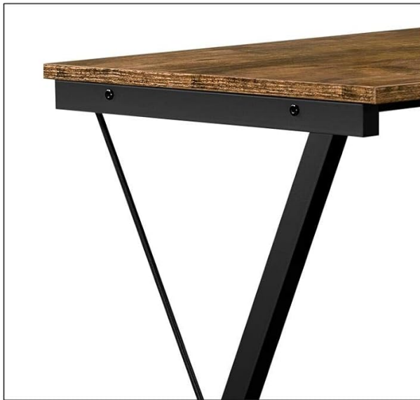
Thickened Metal Frame