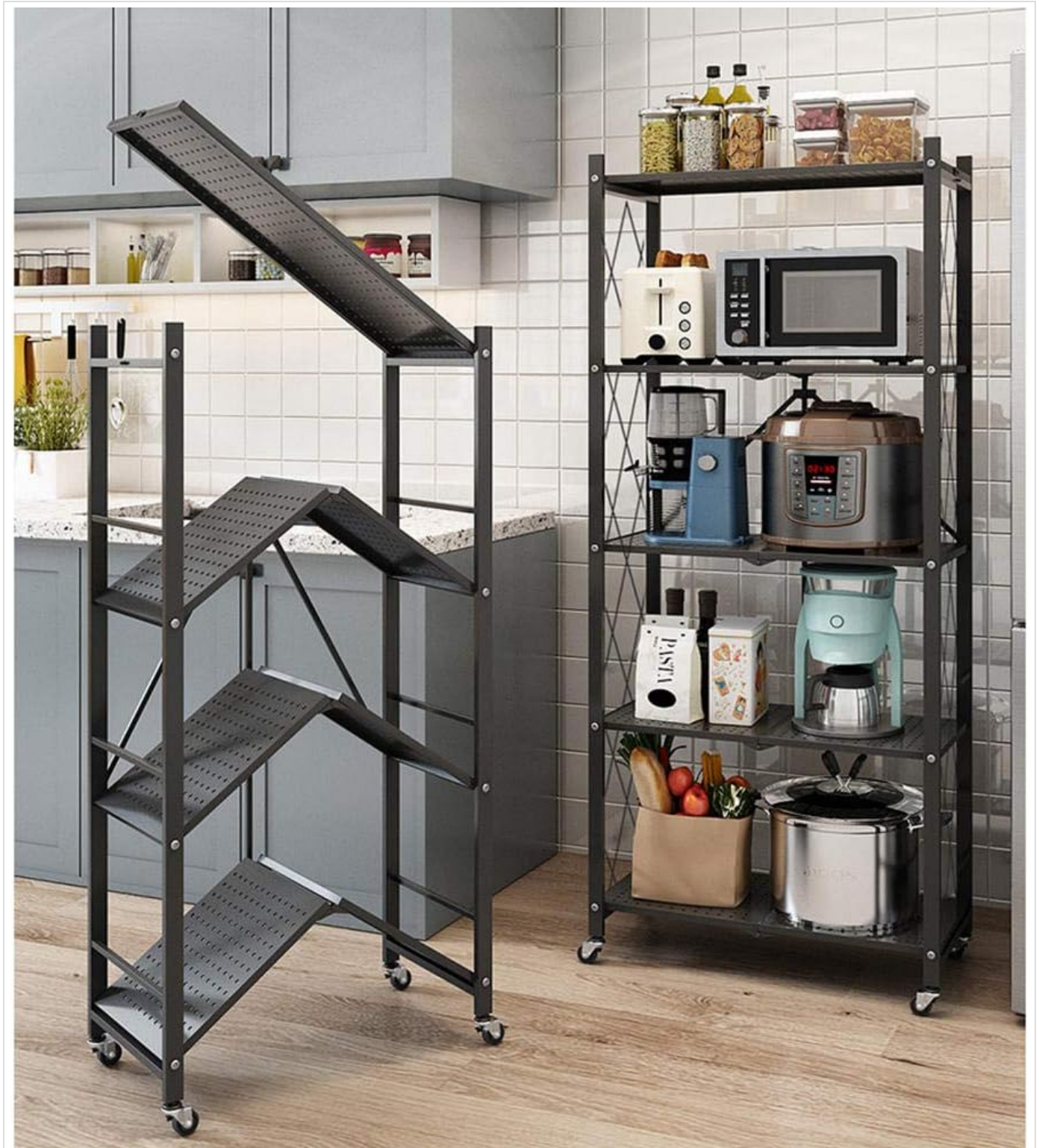
Image: Shelving unit in folded and unfolded states in a kitchen environment.