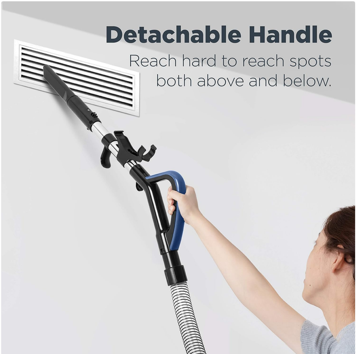
Figure 5: The detachable handle allows for extended reach, useful for cleaning high or low areas.

Reach hard to reach spots both above and below.