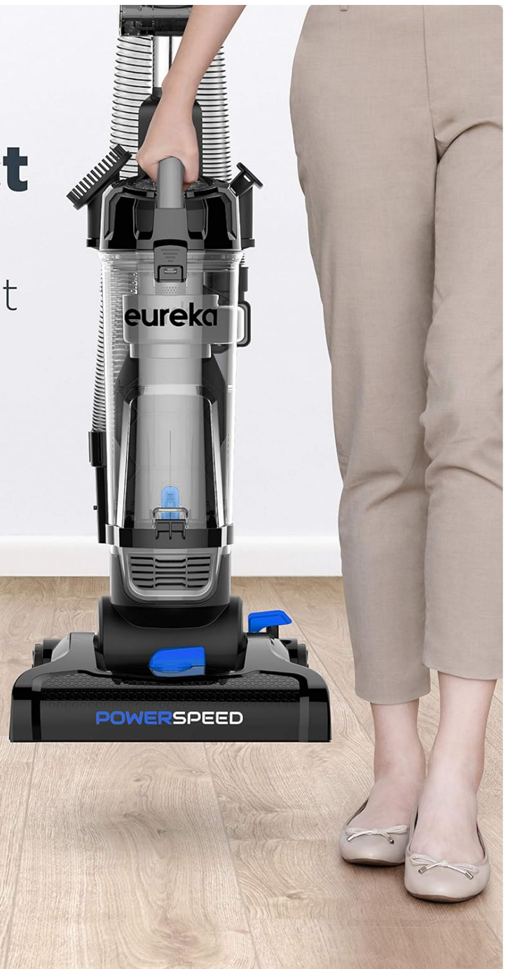
Figure 1: The Eureka PowerSpeed NEU181A, demonstrating its lightweight and portable design (approximately 10 lbs).