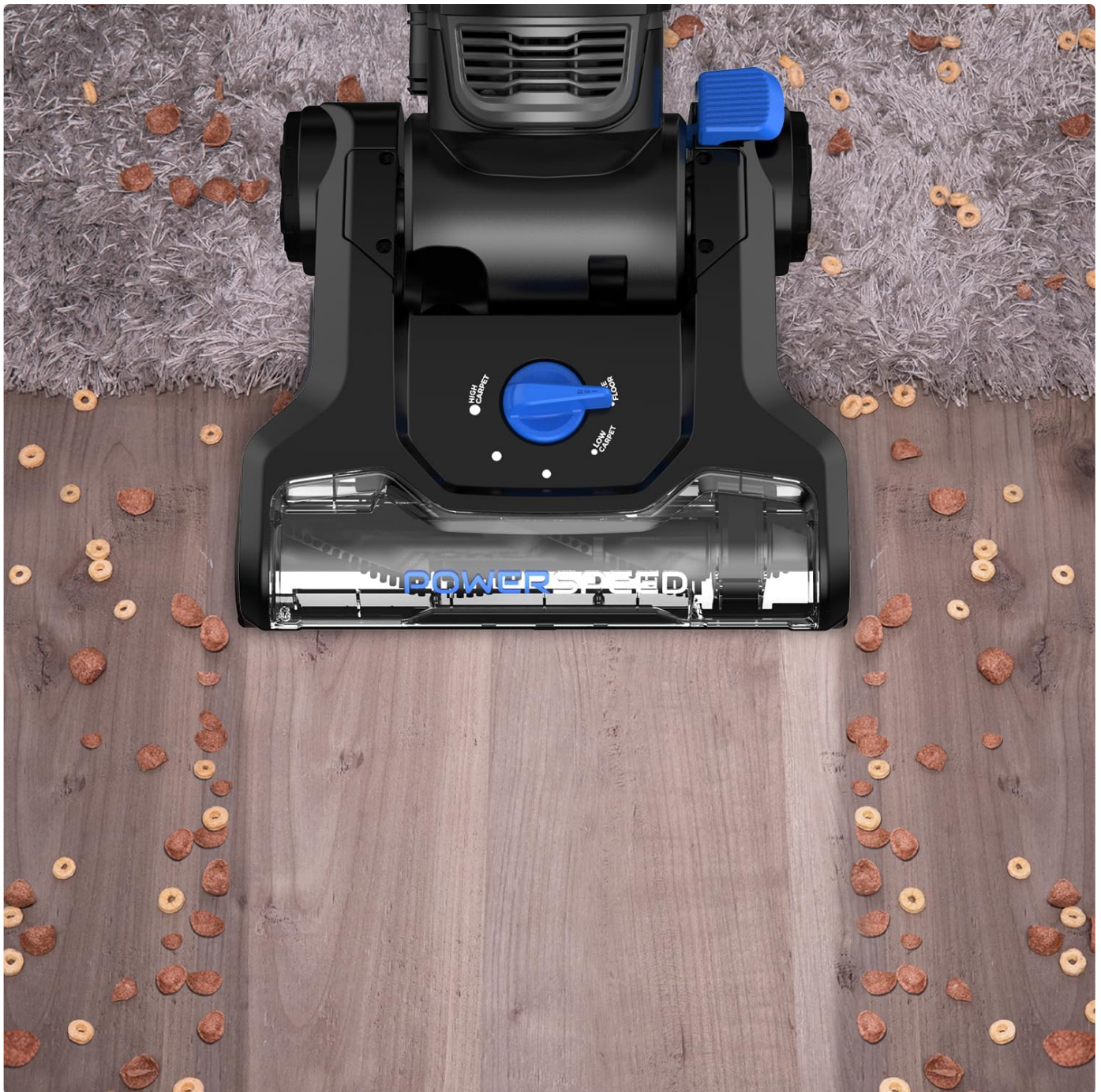
Figure 4: The vacuum effectively cleaning a carpet, suitable for various pile heights with proper adjustment.