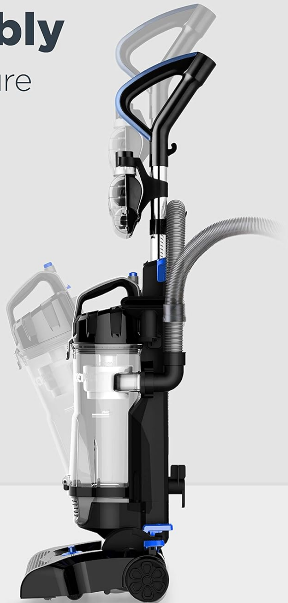
Figure 3: Visual guide for simple assembly of the vacuum cleaner.