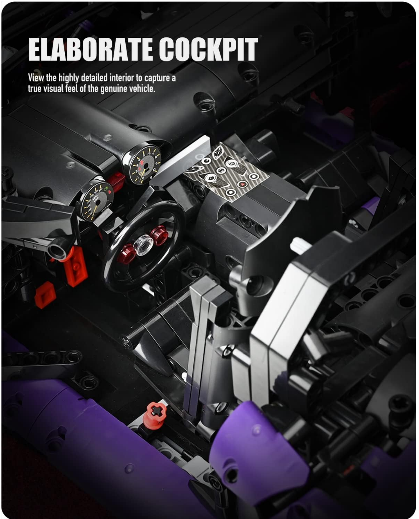
Image: A close-up of the elaborate cockpit of the Nifeliz Super Sports Car GT4 MOC model, highlighting the detailed dashboard, steering wheel, and interior components.

View the highly detailed interior to capture a true visual feel of the genuine vehicle.