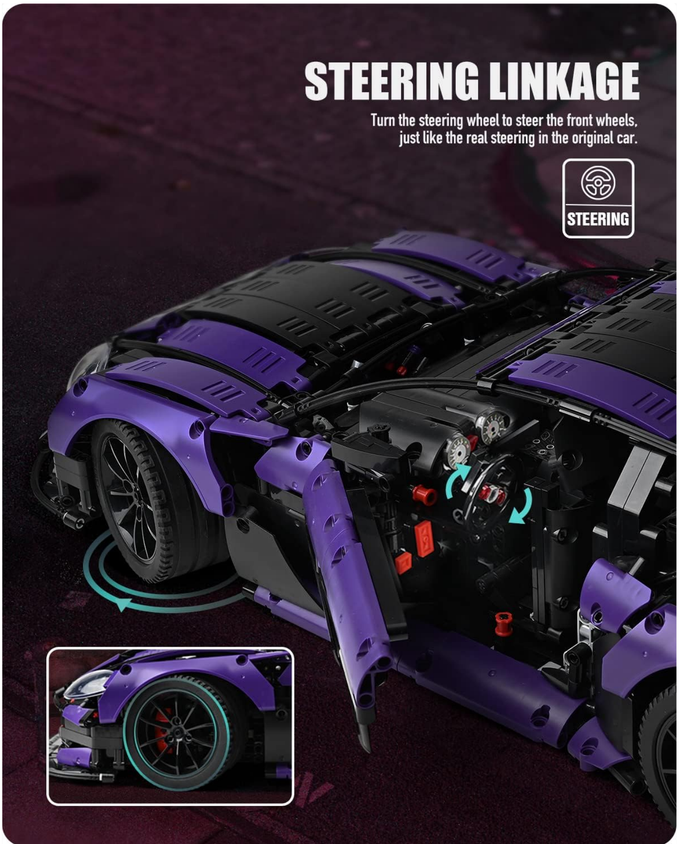
Image: A detailed view of the steering linkage in the Nifeliz Super Sports Car GT4 MOC model, showing the internal gears and connections that allow the front wheels to turn.