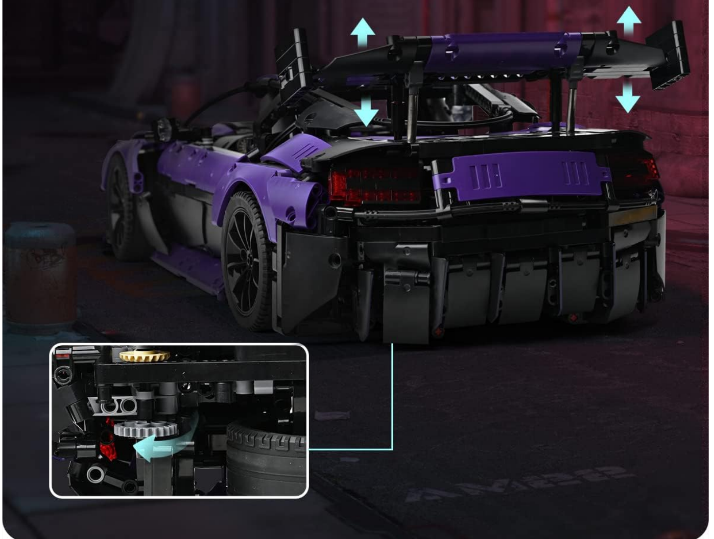
Image: The active rear wing of the Nifeliz Super Sports Car GT4 MOC model, demonstrating its ability to be raised and lowered via a gear located underneath the car.

Turn the gear on the underneath of the car model to raise and lower the rear wing.