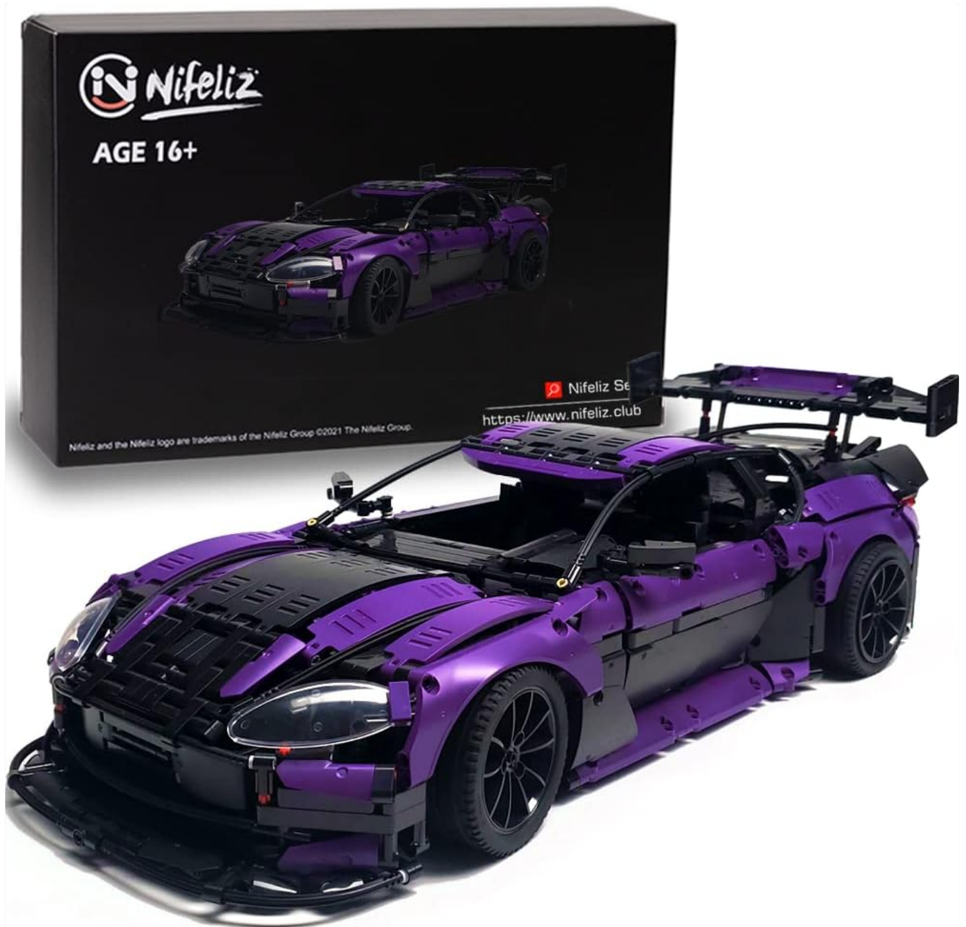
Image: The Nifeliz Super Sports Car GT4 MOC building block set, showcasing the assembled purple and black car alongside its product packaging.