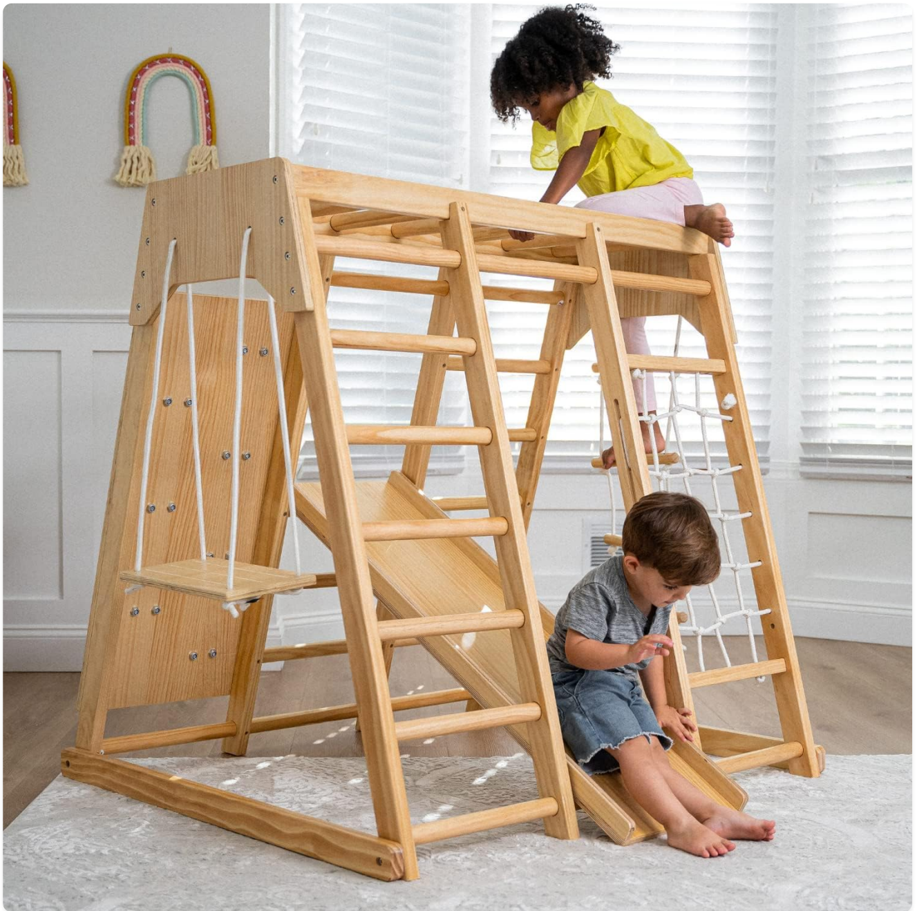
Image: The Avenlur Magnolia Indoor Playground, showcasing its various features including the slide, climbing wall, and monkey bars, with two children actively engaged in play.