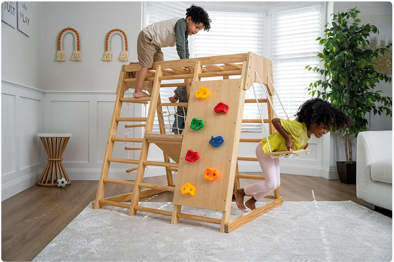
Image: A child demonstrating the use of the monkey bars on the Avenlur Magnolia Playset.