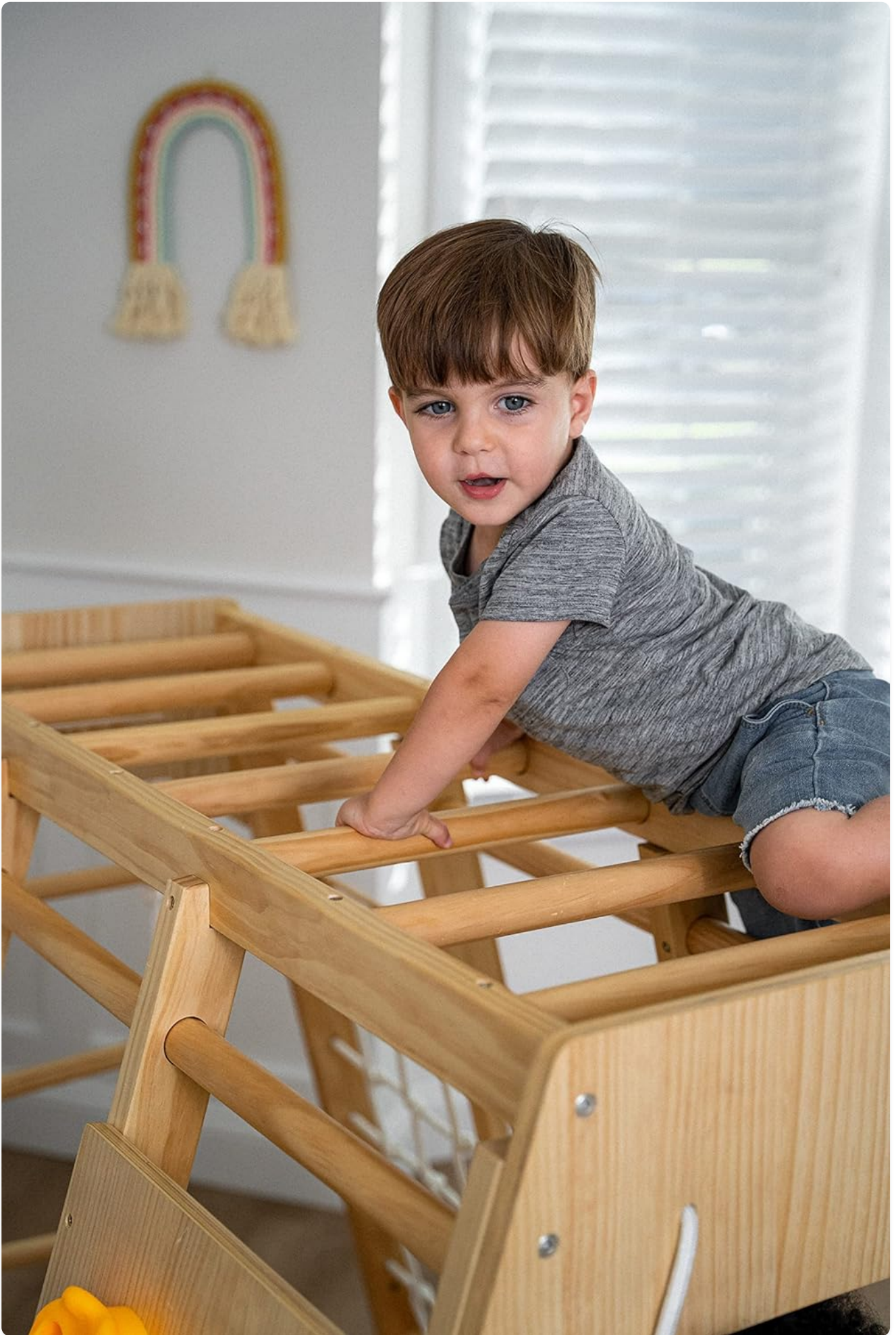
Image: A child enjoying the wooden slide feature of the Avenlur Magnolia Playset.