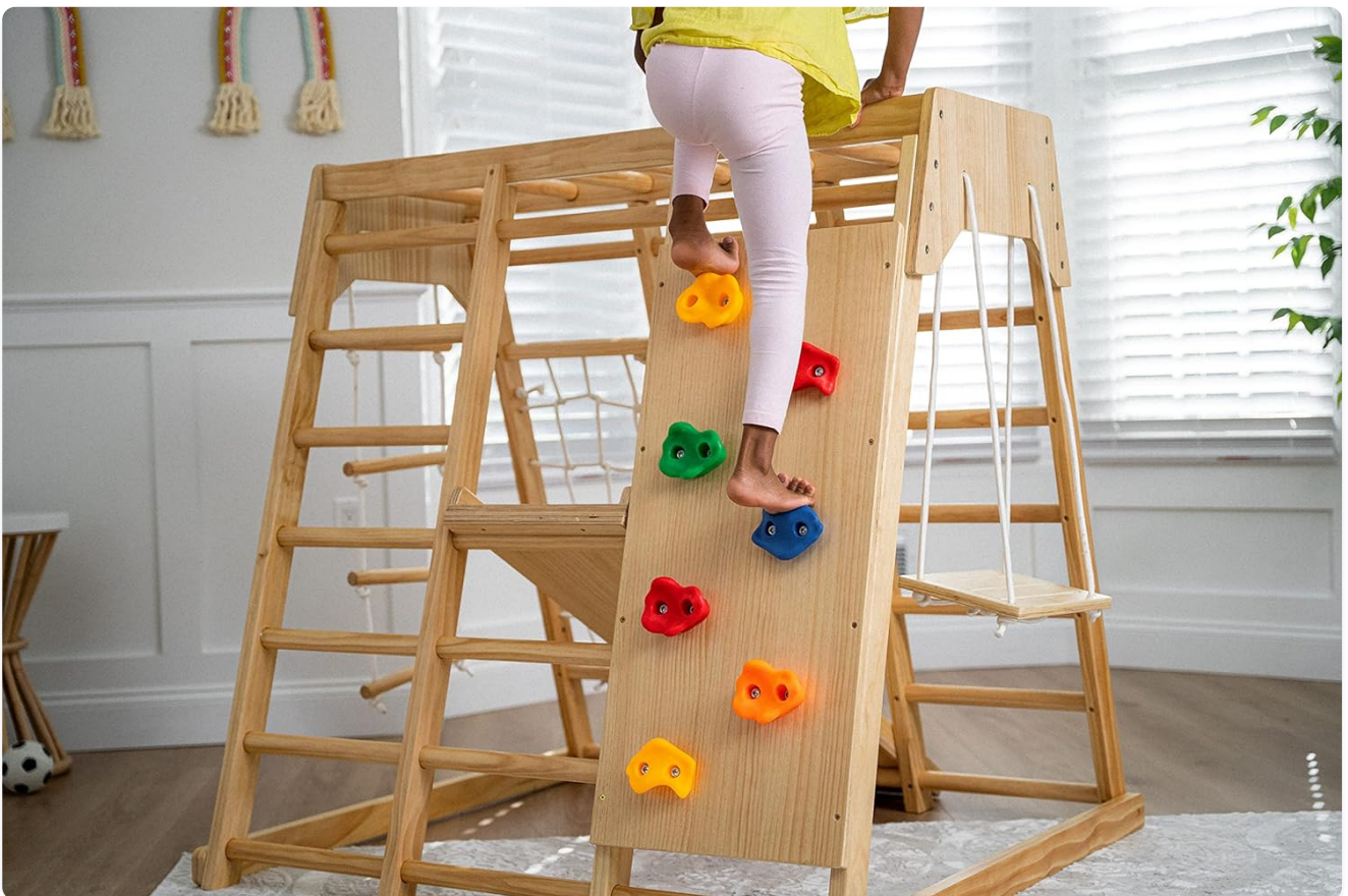
Image: A partially assembled Avenlur Magnolia Playset, demonstrating the structure and a child interacting with the climbing elements.