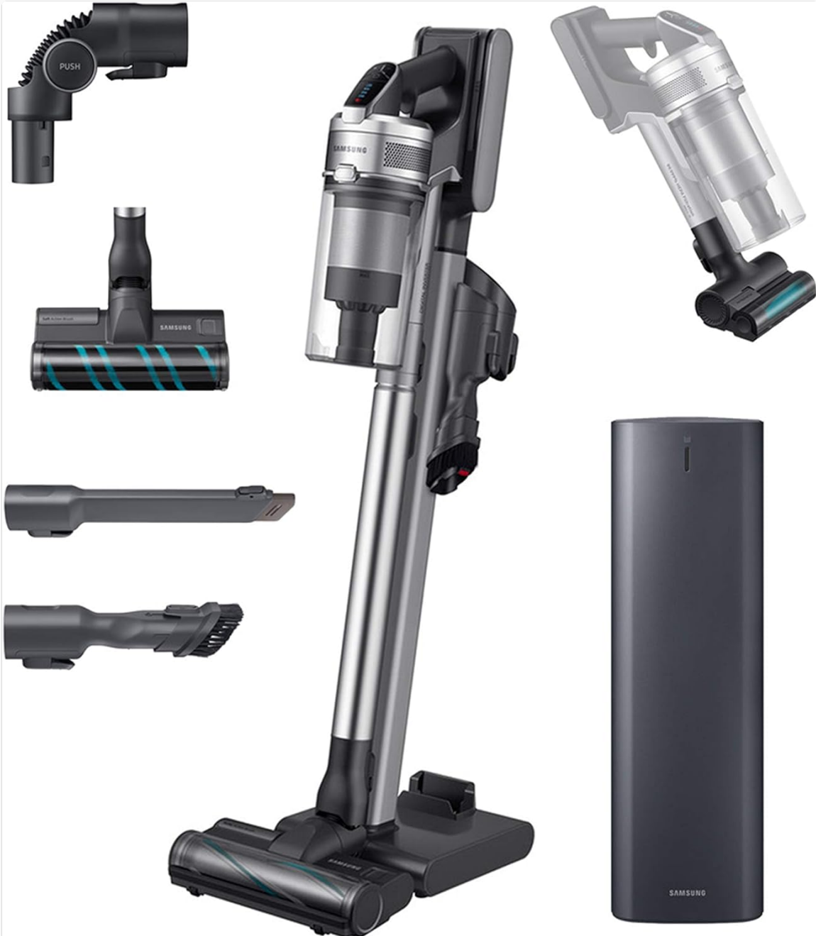
Image: All components included in the SAMSUNG Jet 90 + Clean Station Bundle.