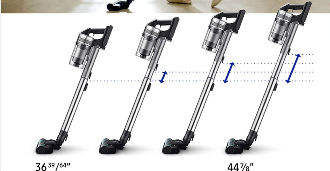
Image: The telescopic pipe can be adjusted to four different lengths for ergonomic cleaning.