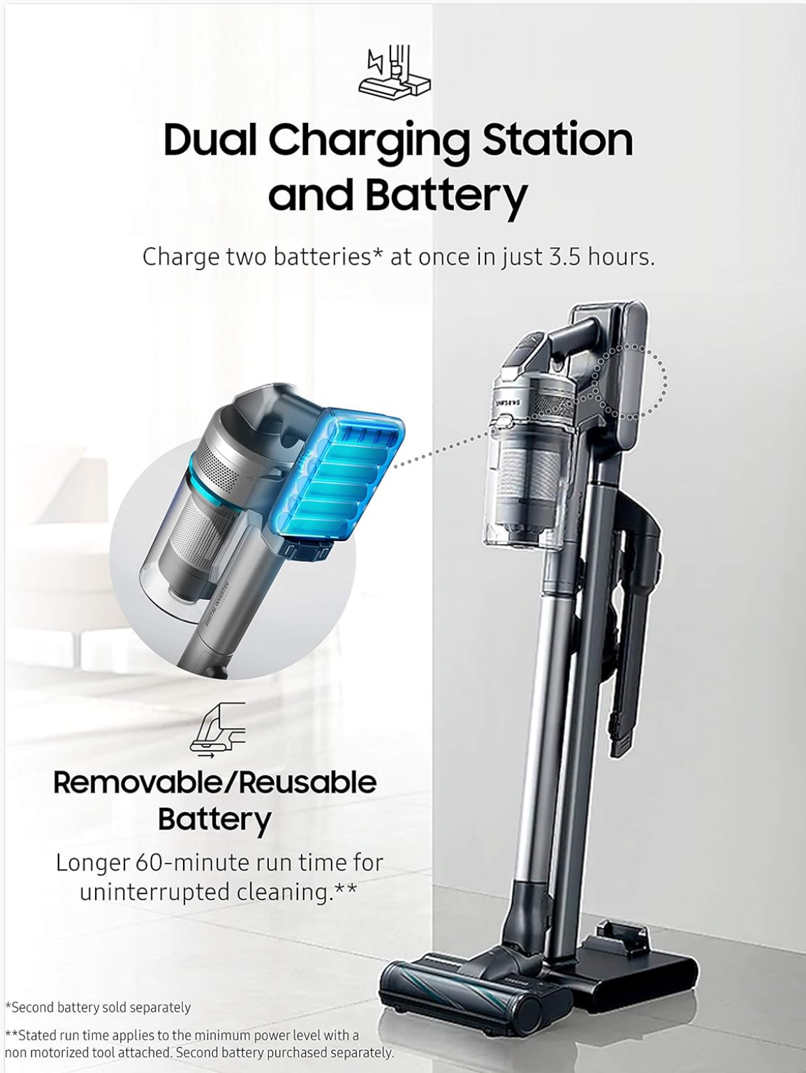
Image: The dual charging station allows for charging two batteries simultaneously.

The removable/reusable battery can be charged directly on the vacuum when docked on the charging stand, or separately on the dual charging station. A full charge takes approximately 3 hours.