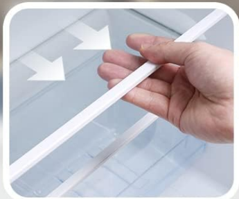
Removable Glass Shelf