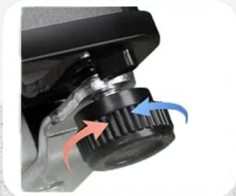
Adjustable leveling leg