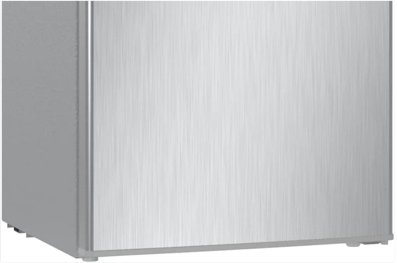
Image: Front view of the Frestec Mini Fridge, showcasing its sleek silver design.