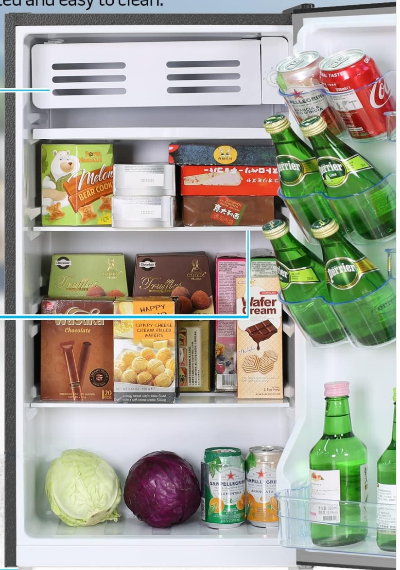
Image: Interior features of the refrigerator, including the drip tray, removable glass shelf, and a visual cue for the adjustable leveling leg.