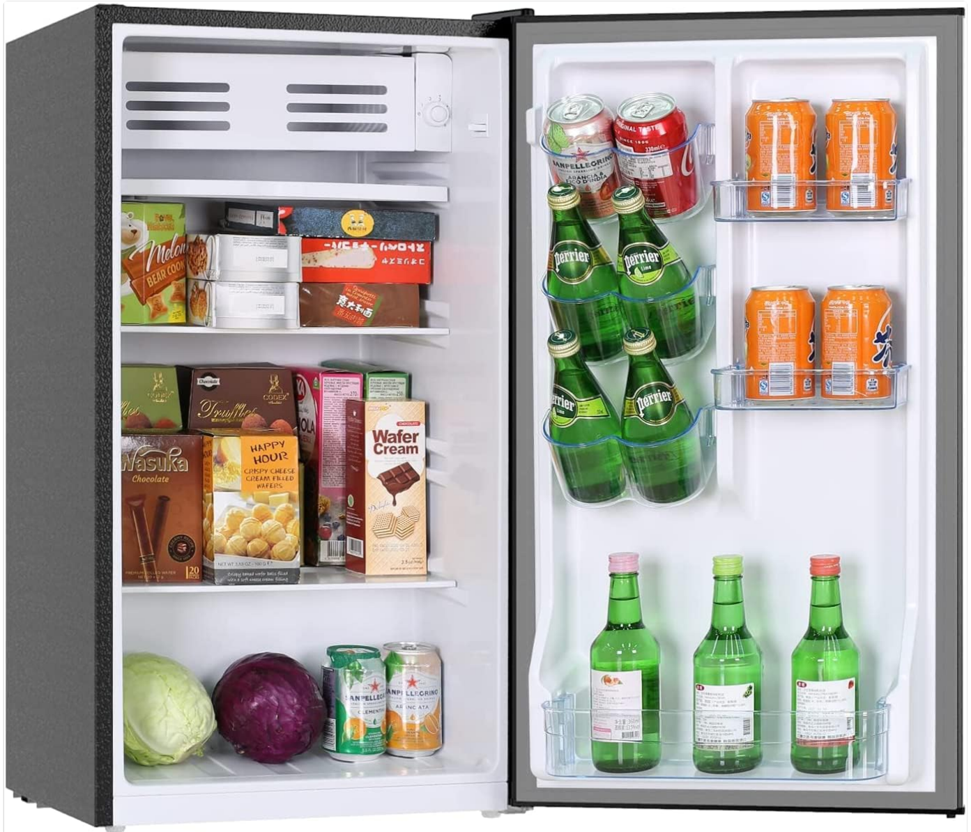
Image: Interior view of the Frestec Mini Fridge, showcasing its storage compartments, including glass shelves, a crisper drawer, and door racks for beverages.