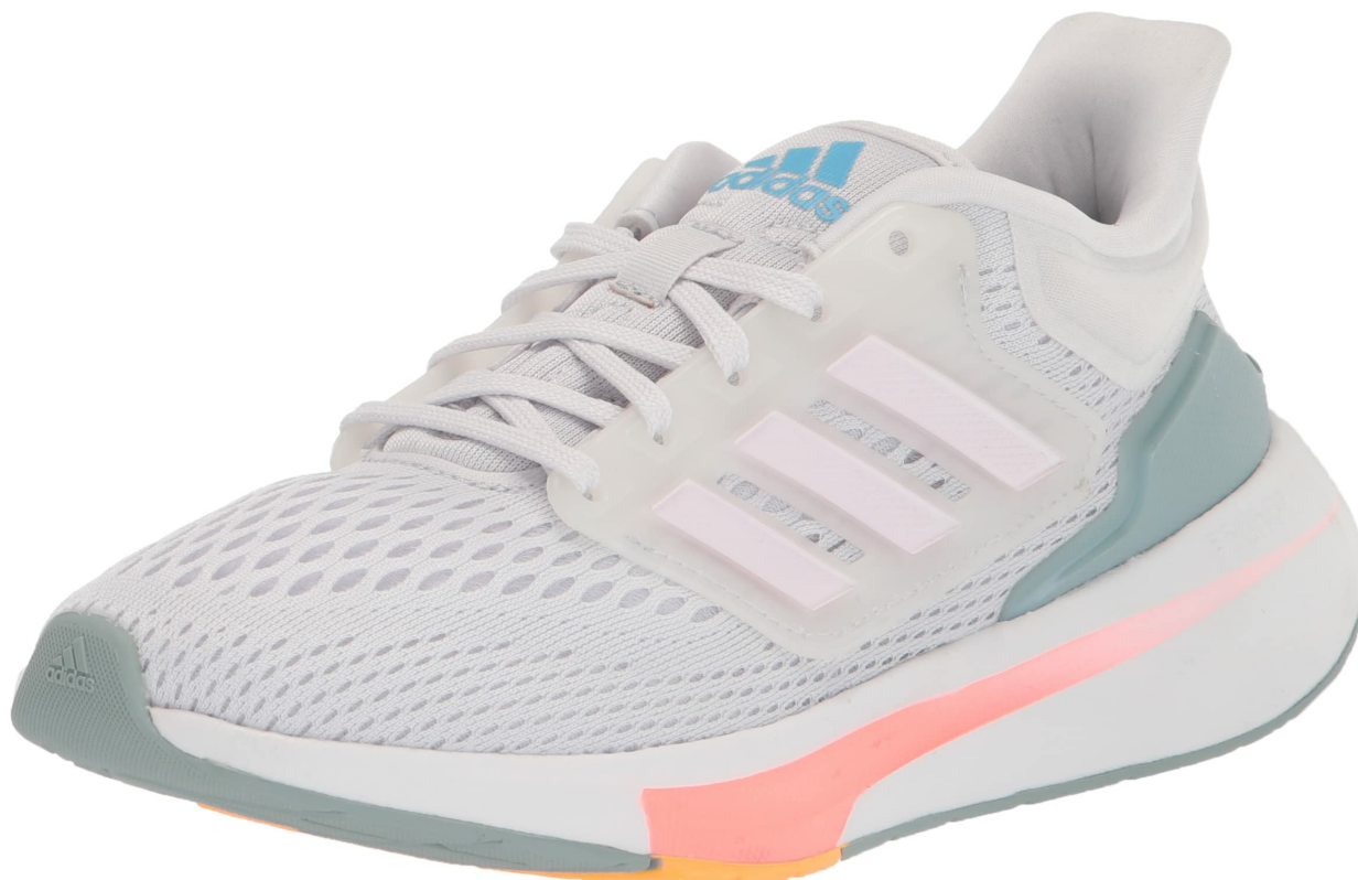
Image: A pair of adidas Women's EQ21 Running Shoes, showcasing the overall design and color scheme.

The adidas Women's EQ21 Running Shoes are designed for daily runners, offering a blend of comfort, flexibility, and stability. Featuring a breathable textile upper and lightweight Bounce cushioning, these shoes are engineered to keep your feet fresh and supported during both short and long runs.