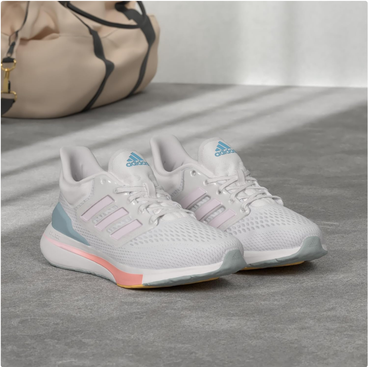
Image: Side profile of the adidas EQ21 Running Shoe, highlighting the sole and upper material.