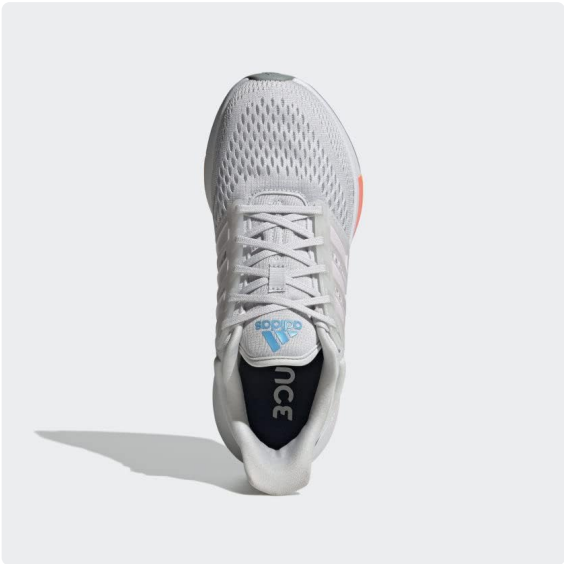
Image: Top-down view of the shoe, showing the lacing system and mesh upper.