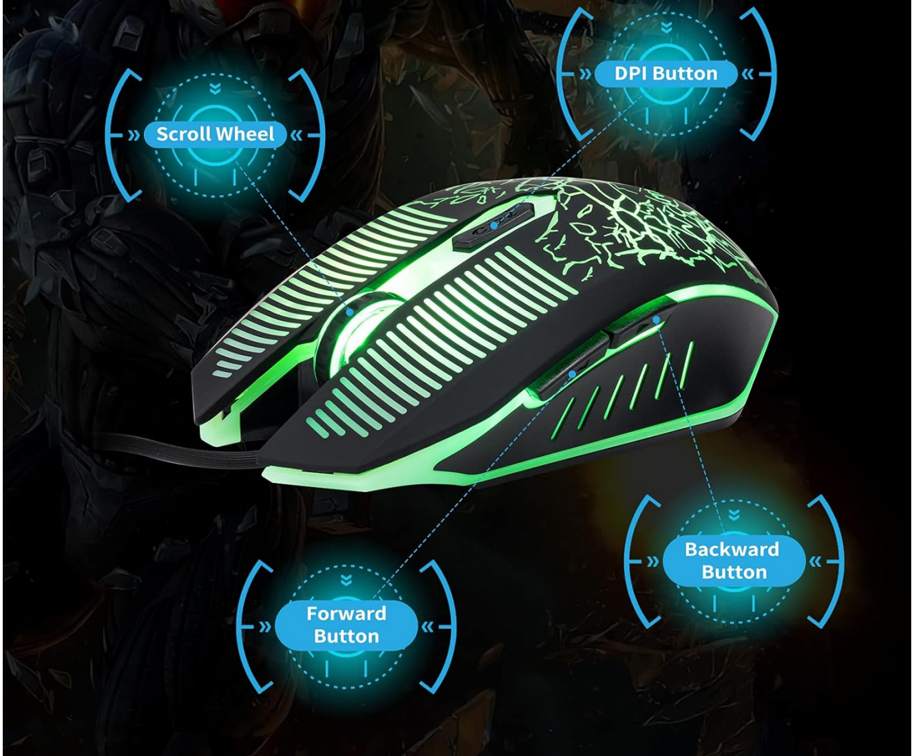
Image: The CHONCHOW 1910B gaming keyboard and mouse combo, featuring LED backlighting.