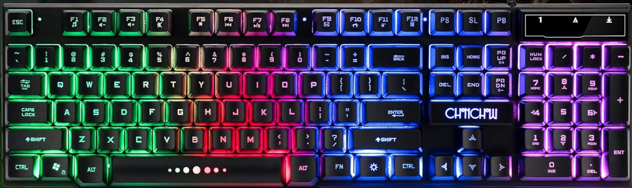
Image: Detail of the keyboard's luminous keycap design and adjustable rear feet.

Press again to restore the original setting