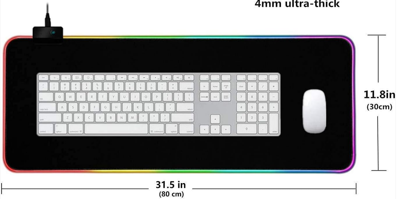
Image 5: GMS-X5 mouse pad illustrating its large size and 4mm thickness.