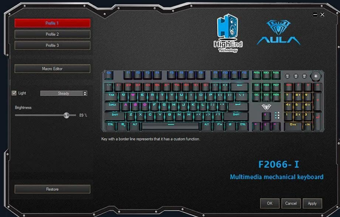
Image: The AULA F2066 keyboard software interface, showing options for custom programmable functions, profiles, macro editor, and brightness control.