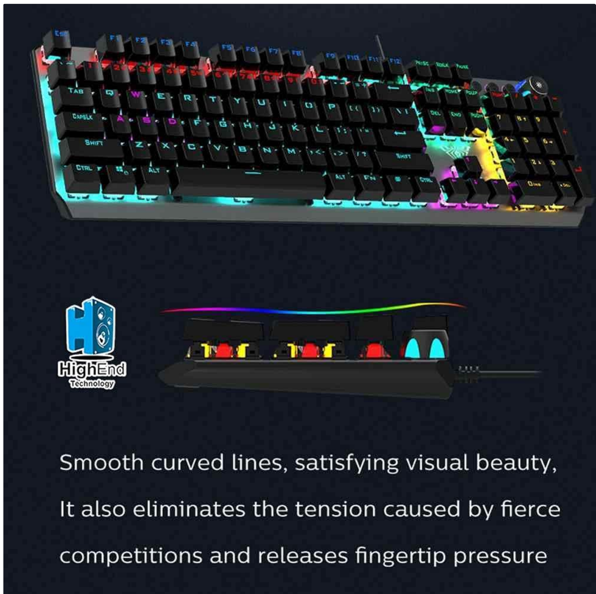
Image: An overview of the AULA F2066 Mechanical Gaming Keyboard, showcasing its full layout and LED backlighting.