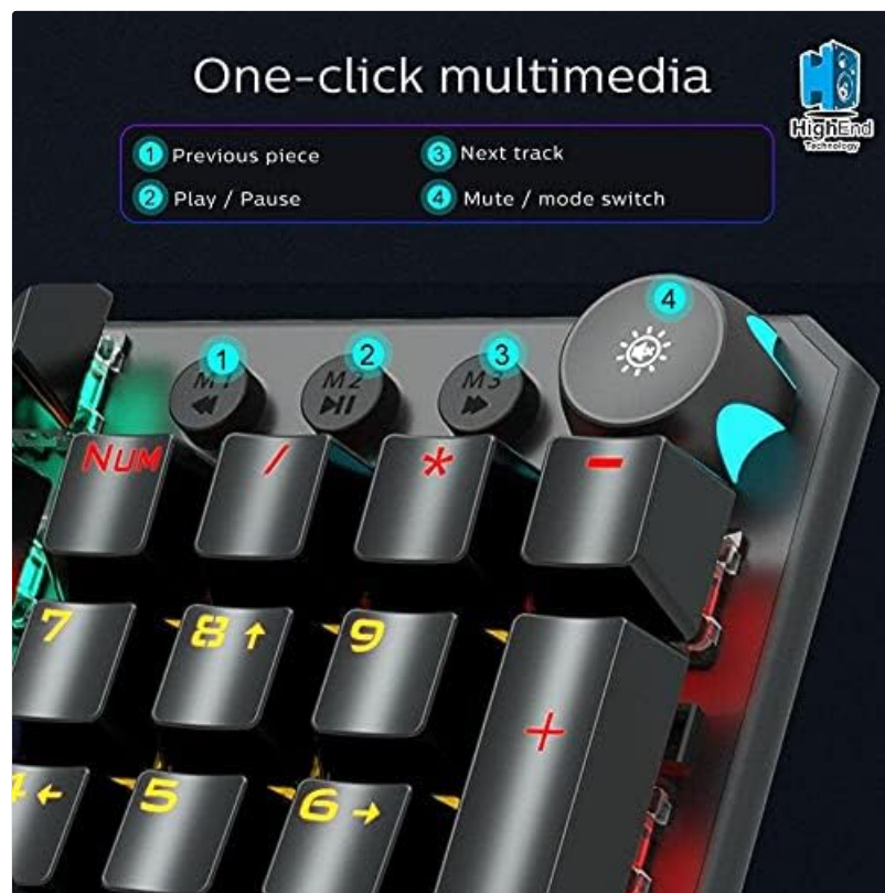
Image: A close-up view of the AULA F2066 keyboard's multimedia keys (M1, M2, M3) and the multi-function knob, with labels indicating their primary functions.