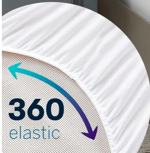
Image: The deep pocket design ensures a secure fit on mattresses up to 17 inches.