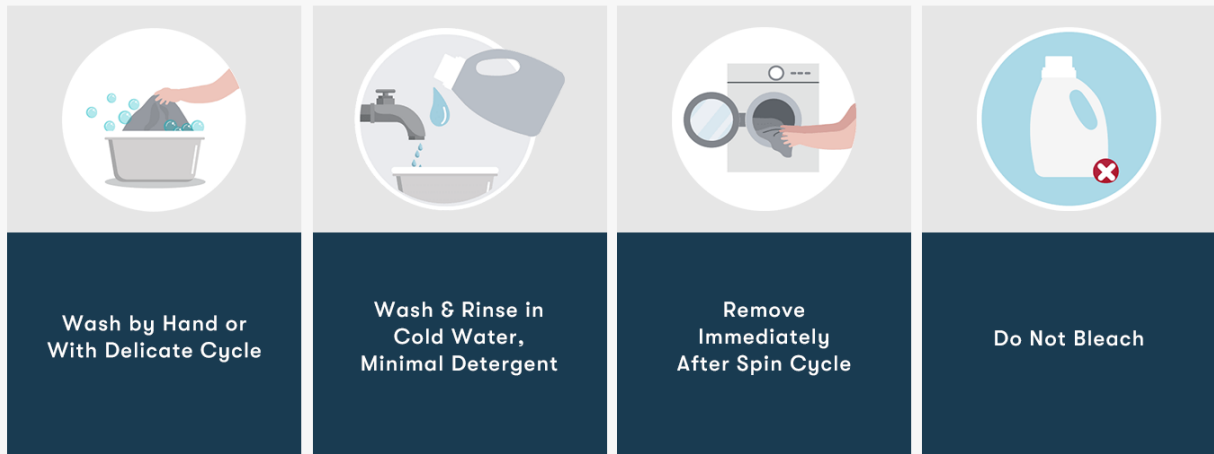
Image: Washing instructions for the Serta Heated Mattress Pad.