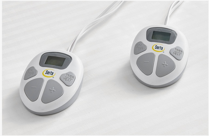
Image: Dual controllers for Queen and larger sizes enable individual temperature control.