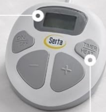
Image: The controller features 10 heat settings and a 1-12 hour auto shut-off timer.

ADJUSTABLE 1-12 HOUR AUTO SHUT-OFF TIMER (1 HOUR INCREMENT)