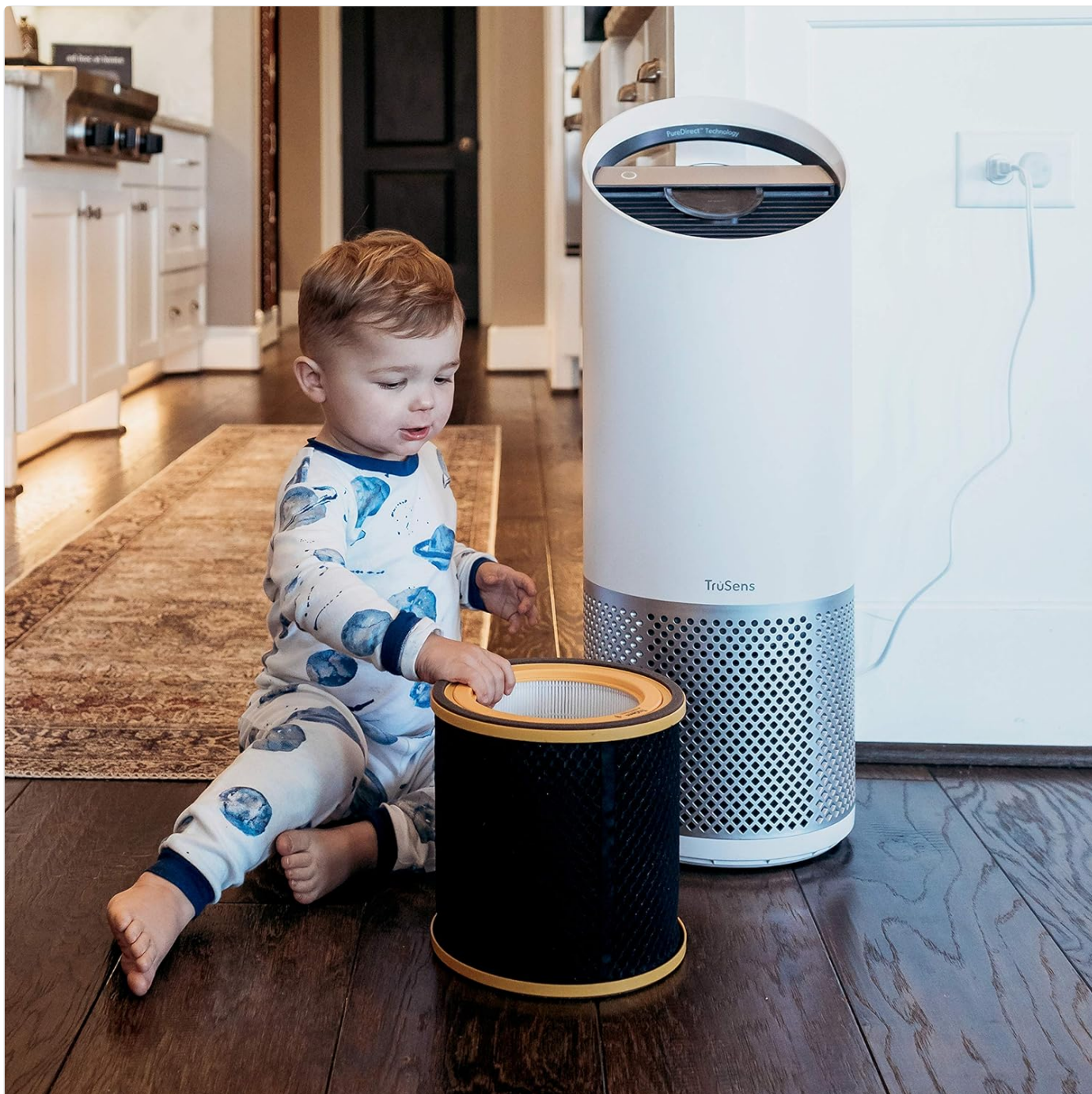
Image: A Leitz TruSens air purifier with its filter drum removed, placed on a wooden floor next to a child, illustrating the filter's size and how it fits into the unit.