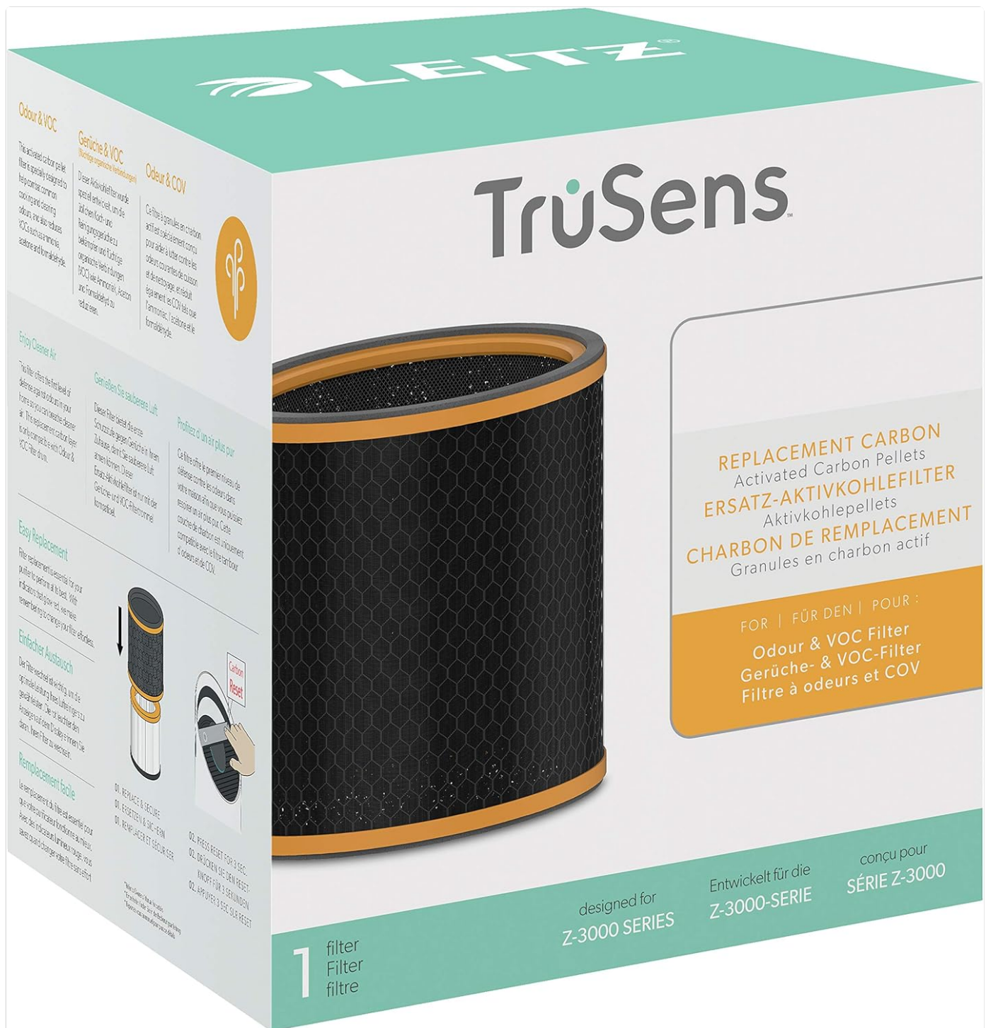
Image: Packaging of the Leitz TruSens Odour and VOC Replacement Filter, showing product details and compatibility with Z-3000 series.