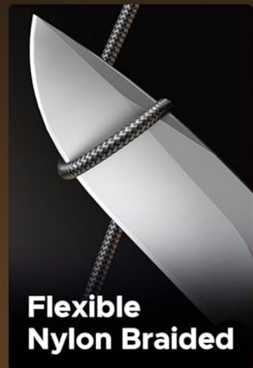
Figure 3: Detailed view of the cable's durable construction, featuring a Japan Toray Optical Fiber Core, 24K Gold-Plated Plug, Recyclable Aluminum Case, and Flexible Nylon Braided exterior.