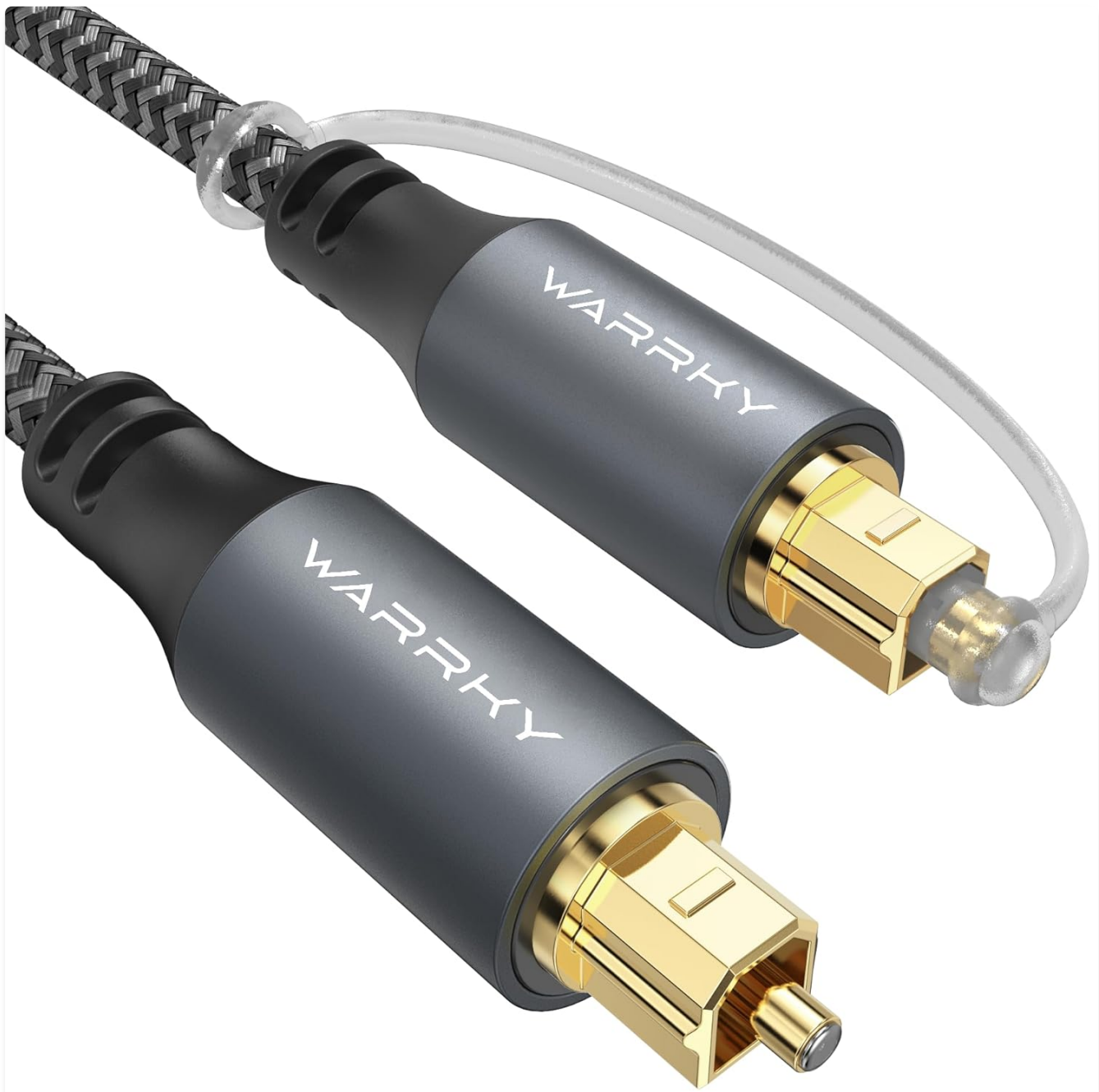
Figure 1: Warrky Optical Audio Cable, showcasing its gold-plated connectors and braided exterior.