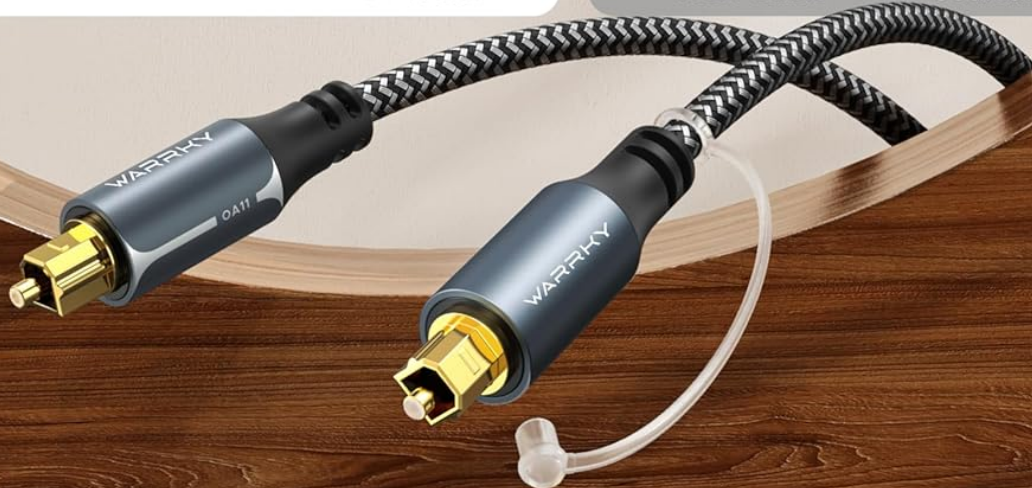
Figure 5: Broad compatibility with all Toslink-equipped devices, including projectors, TVs, DVDs, game consoles, Blu-ray players, soundbars, amplifiers, set-top boxes, and decoders.