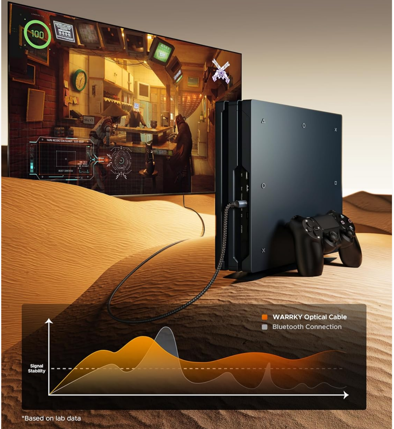
Figure 6: Experience unrivaed audio-visual quality with no lag or signal loss, ideal for gaming and high-fidelity audio.