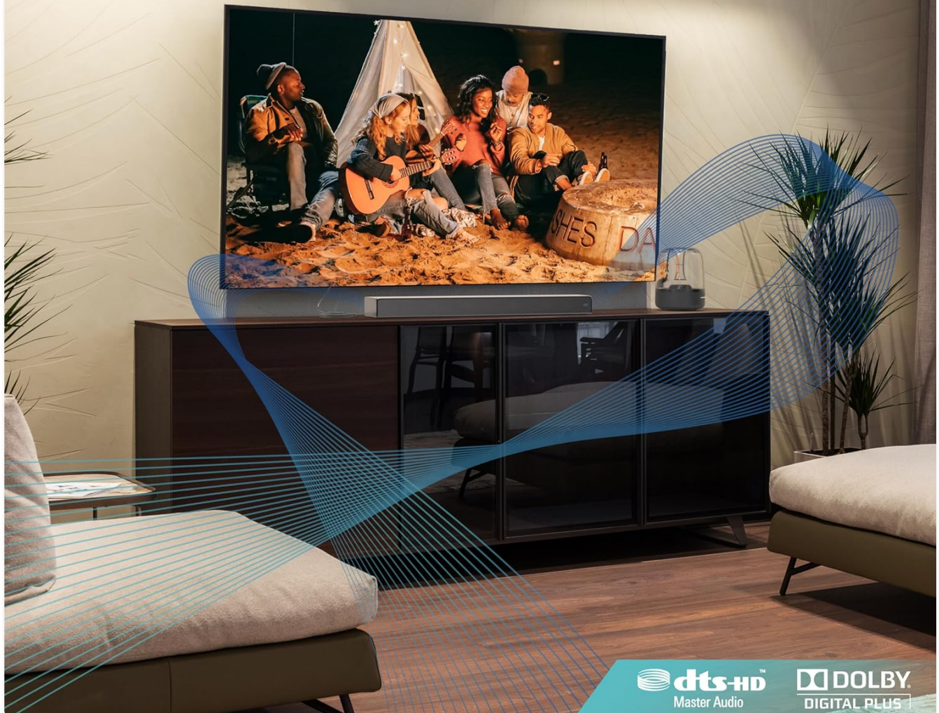
Figure 7: Enhance your home theater experience by immersing yourself in your favorite music, movies, and more with superior sound.

Immerse yourself in your favorite music, movie, and more