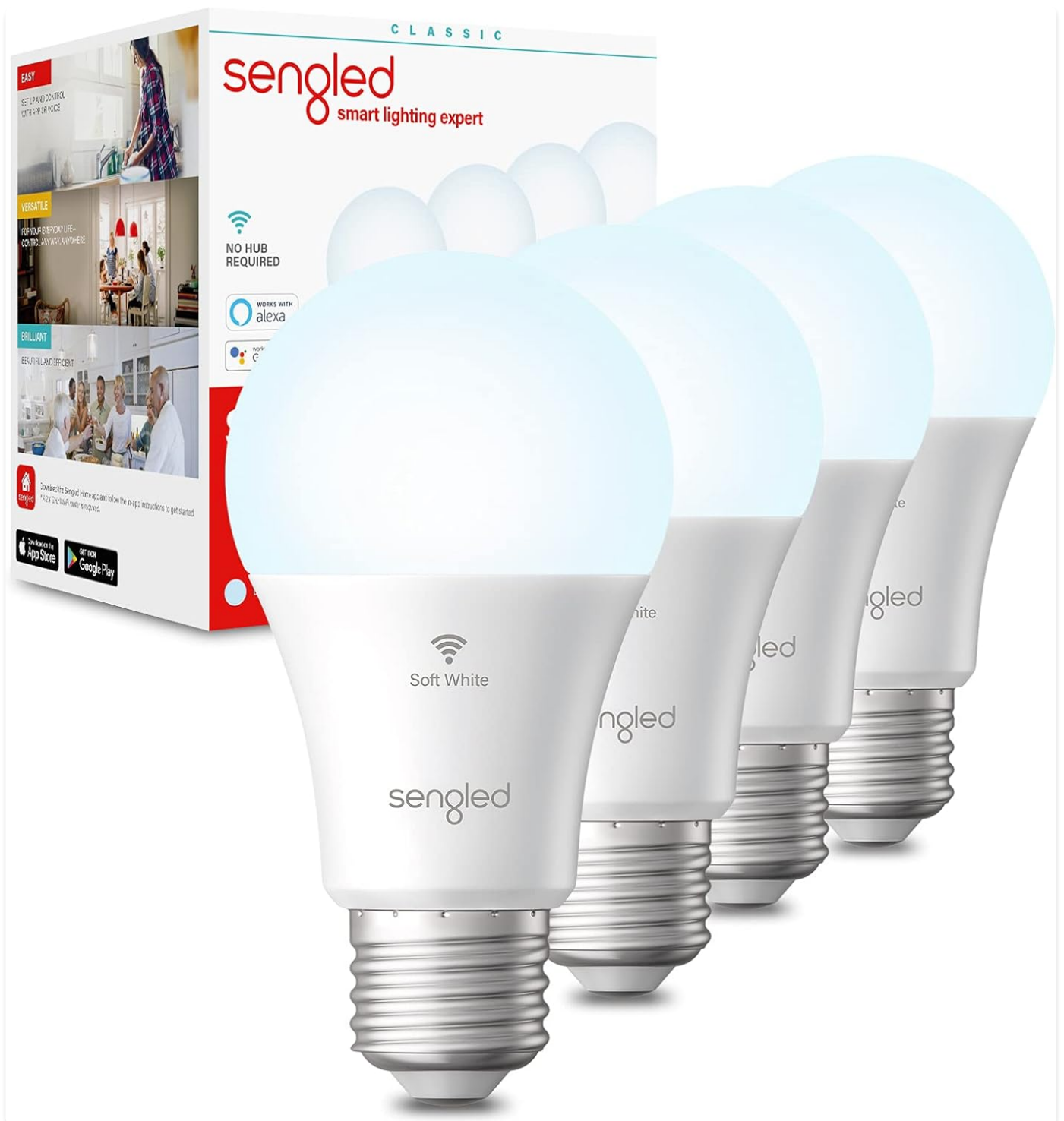
Image: Sengled WiFi Smart LED Light Bulb A19 4-pack packaging and bulbs.