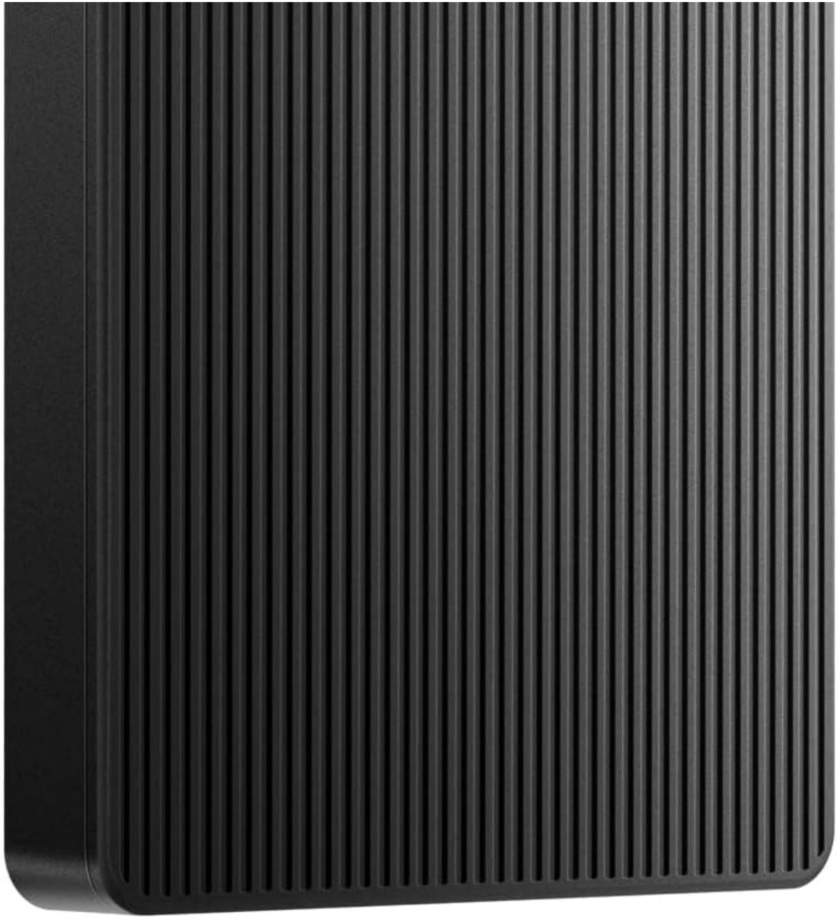
Image: The UnionSine HD-2510 external hard drive, showcasing its sleek black design.