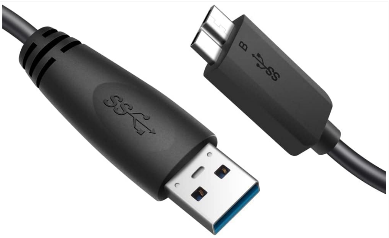
Image: Close-up of the USB 3.0 cable, showing both ends for connection to the hard drive and host device.

For detailed installation instructions, please refer to the quick installation guide included in the packaging.