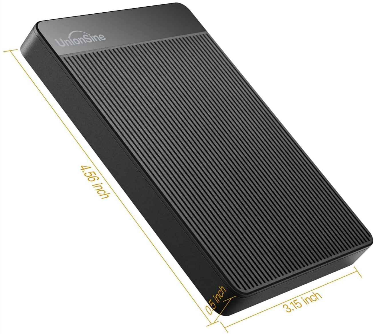
Image: Diagram showing the physical dimensions of the UnionSine HD-2510 hard drive.