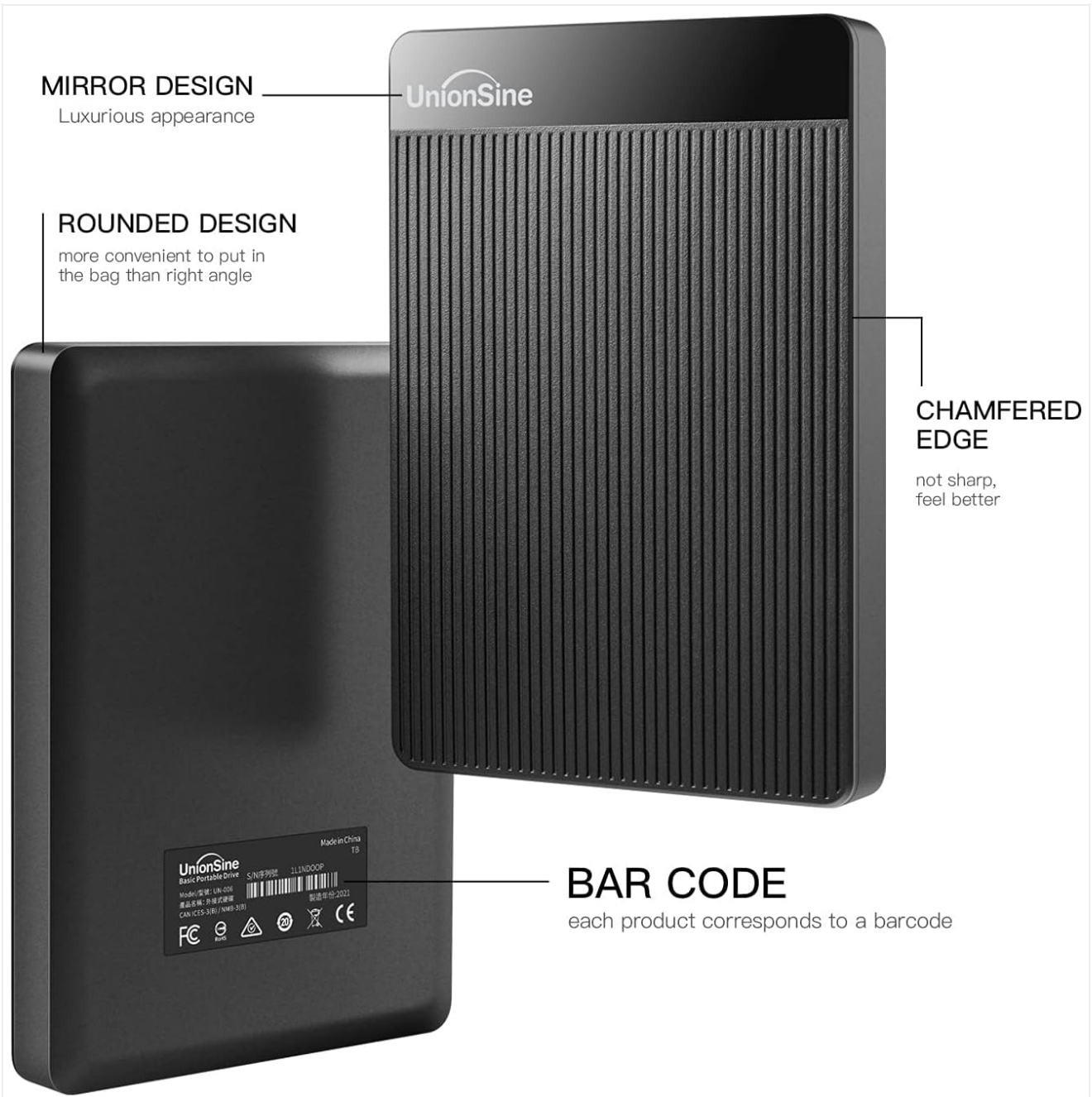
Image: Detailed view of the hard drive highlighting its mirror design, rounded edges, chamfered edge, and barcode.