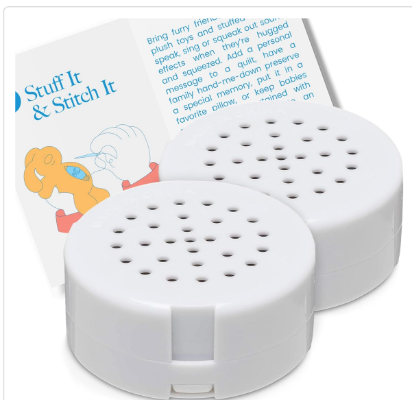
Image: Two VoiceGift MINI-ME voice recorders, showing their compact, circular design with speaker grilles.

The VoiceGift MINI-ME is a compact voice recorder designed for easy integration into soft items. It features a simple interface for recording and playback, offering a 60-second recording capacity and the ability to replay messages up to 500 times.