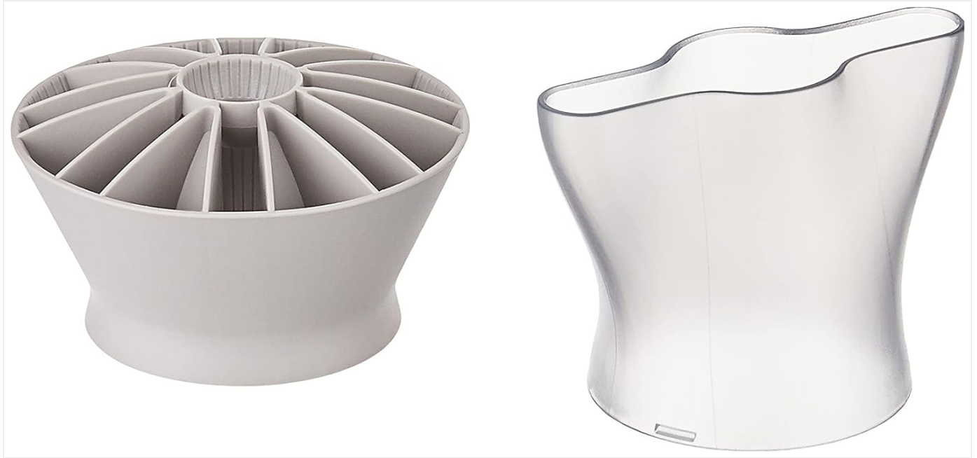
Image: The ThermoProtect attachment (left) and a standard concentrator nozzle (right). The ThermoProtect attachment is designed to mix warm and cool air for a lower drying temperature, while the concentrator nozzle directs airflow for precise styling.