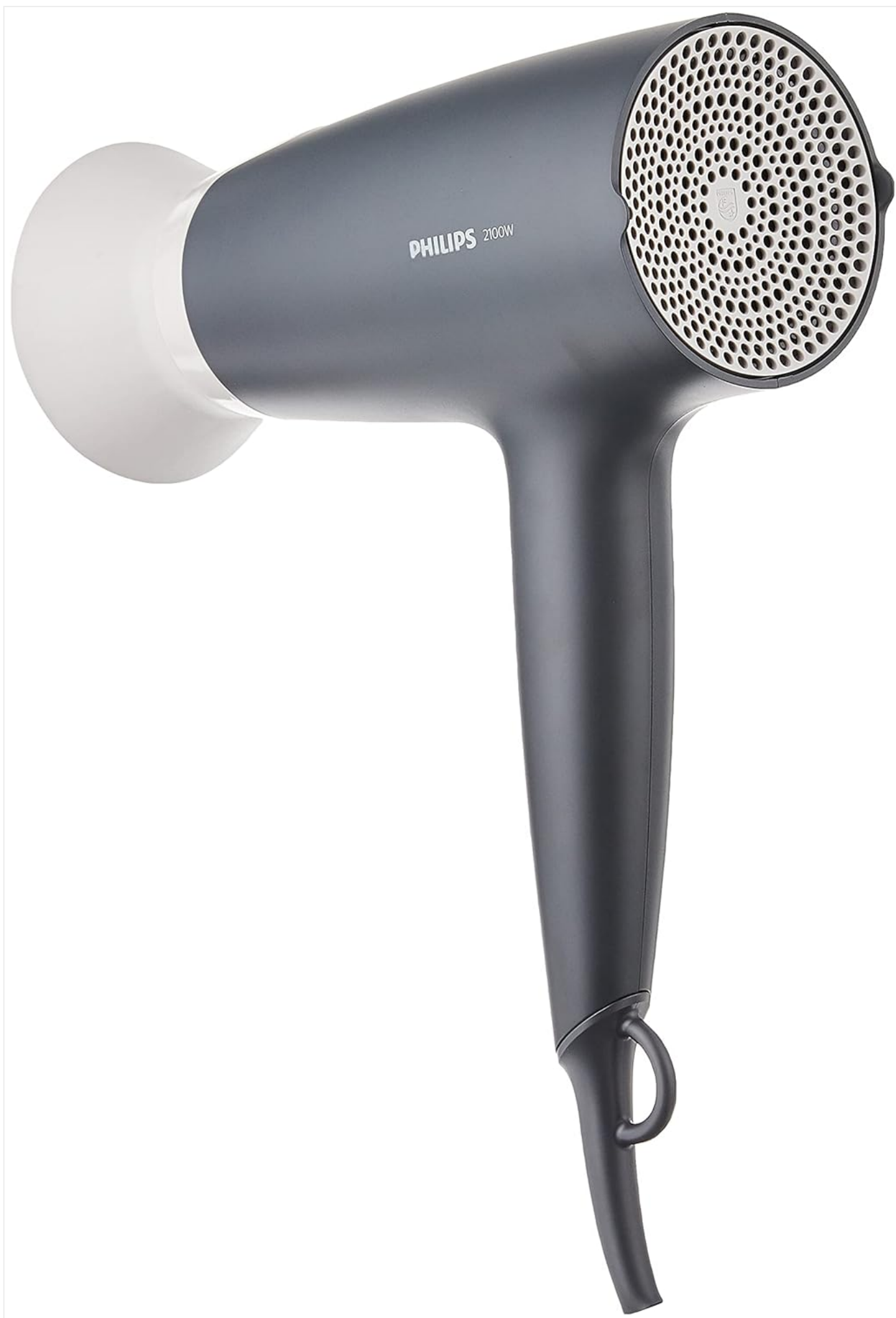
Image: The Philips Series 3000 Hair Dryer BHD351/10, showcasing its charcoal/grey black body and white rear filter. This image displays