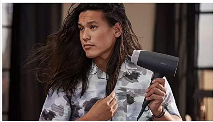
Image: A person using the Philips hair dryer to dry their hair. This demonstrates the typical use of the appliance for hair styling.