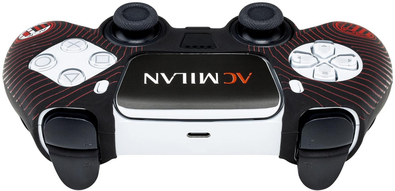
Figure 3.5: Bottom view of the controller skin, showing the opening for the USB-C charging port and other connectors.