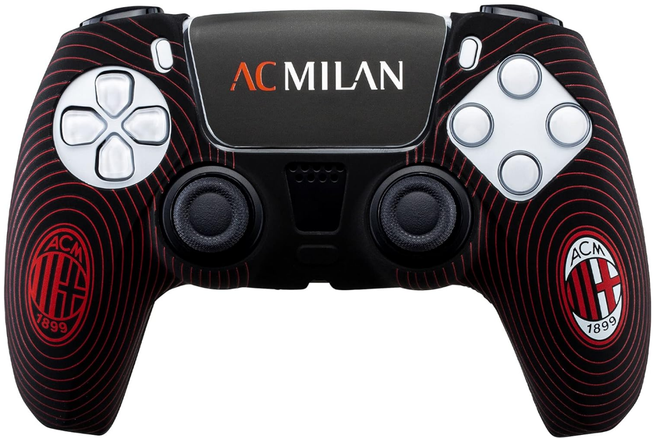
Figure 3.1: Front view of the Qubick AC Milan PS5 controller skin applied to a DualSense controller. Shows the AC Milan logo and red striped pattern.