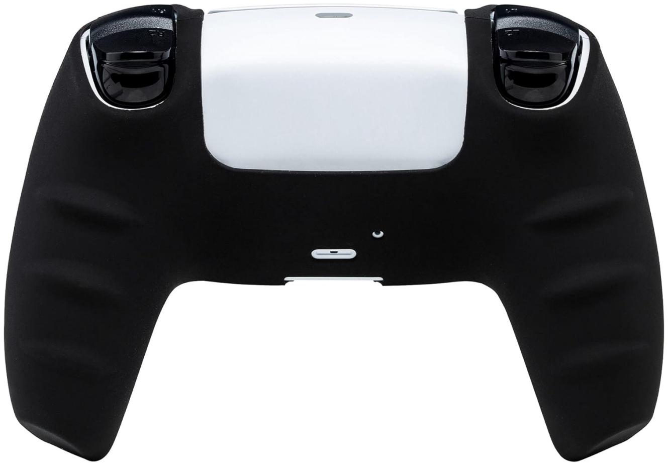
Figure 3.3: Back view of the controller with the skin, showing the ergonomic design and cutouts for rear buttons.