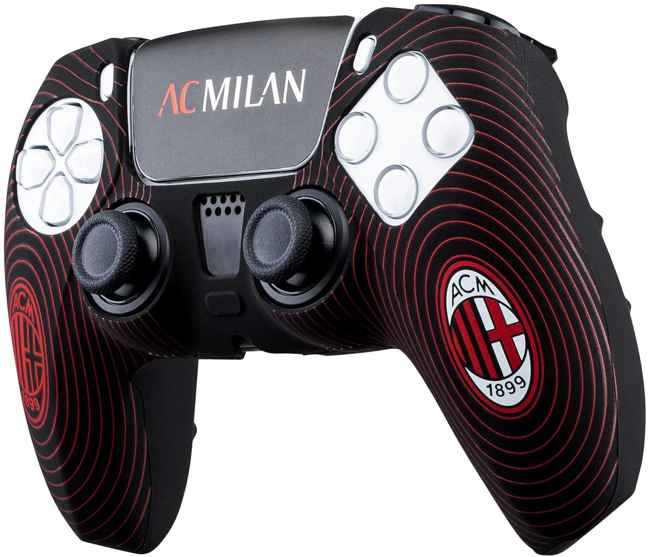
Figure 3.2: Angled front view of the controller skin, highlighting the texture and design from a different perspective.