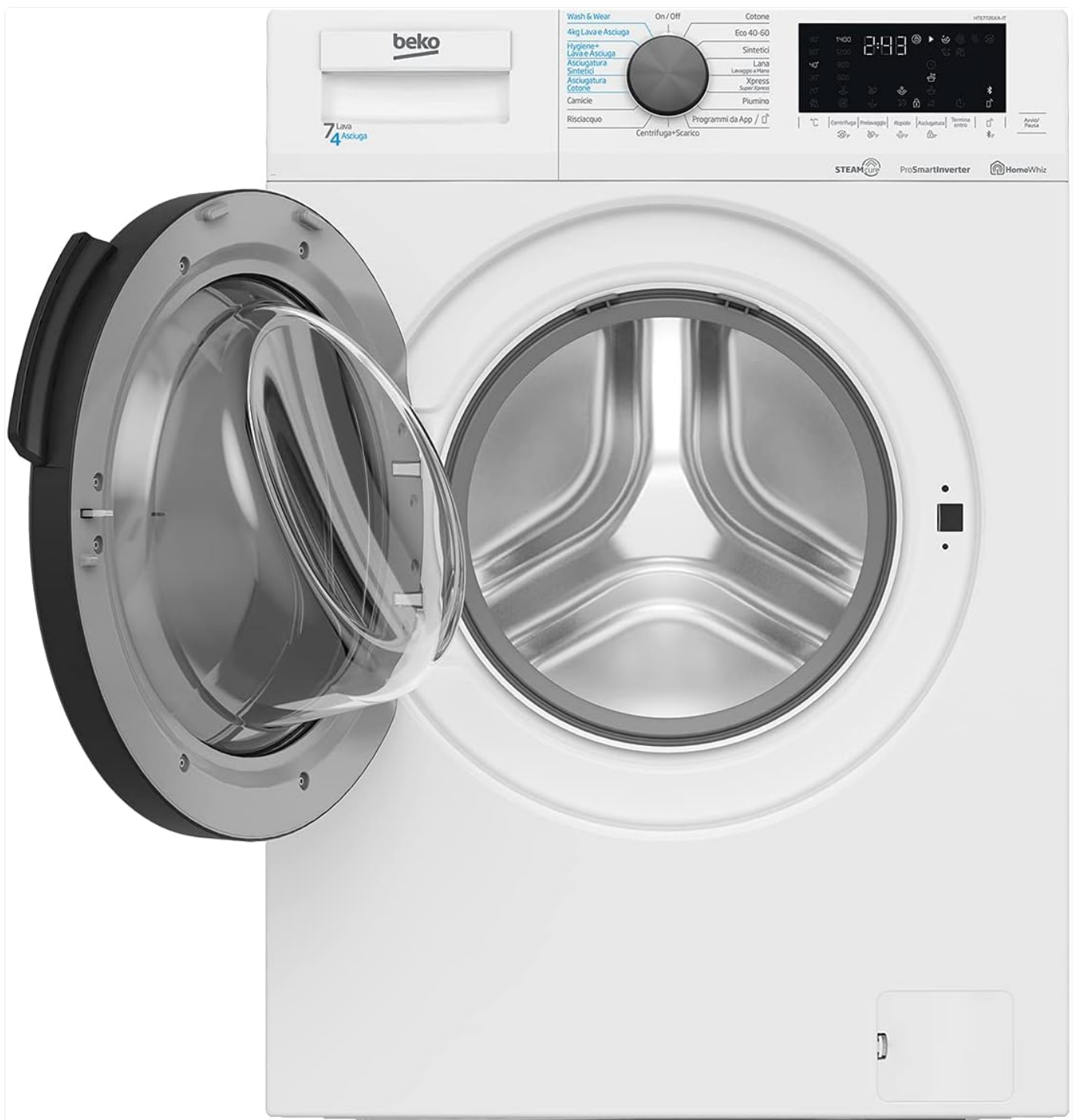
Image: The door of the Beko HTE7726XA-IT Slim Washer Dryer is open, revealing the stainless steel drum inside, ready for loading laundry.