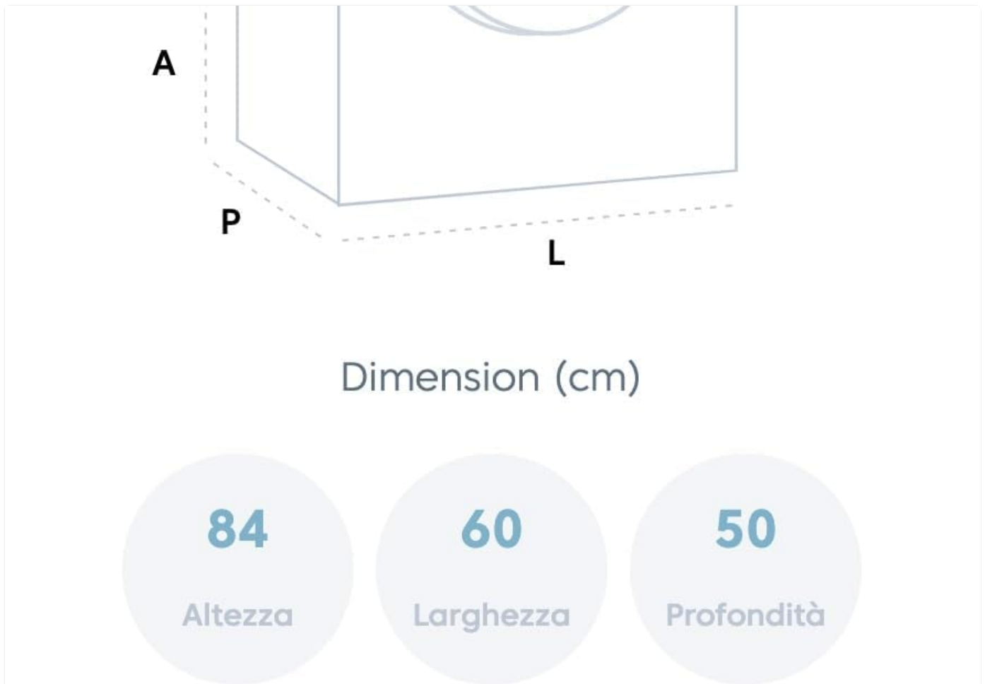
Image: Diagram illustrating the height (84 cm), width (60 cm), and depth (50 cm) of the Beko HTE7726XA-IT washer dryer.