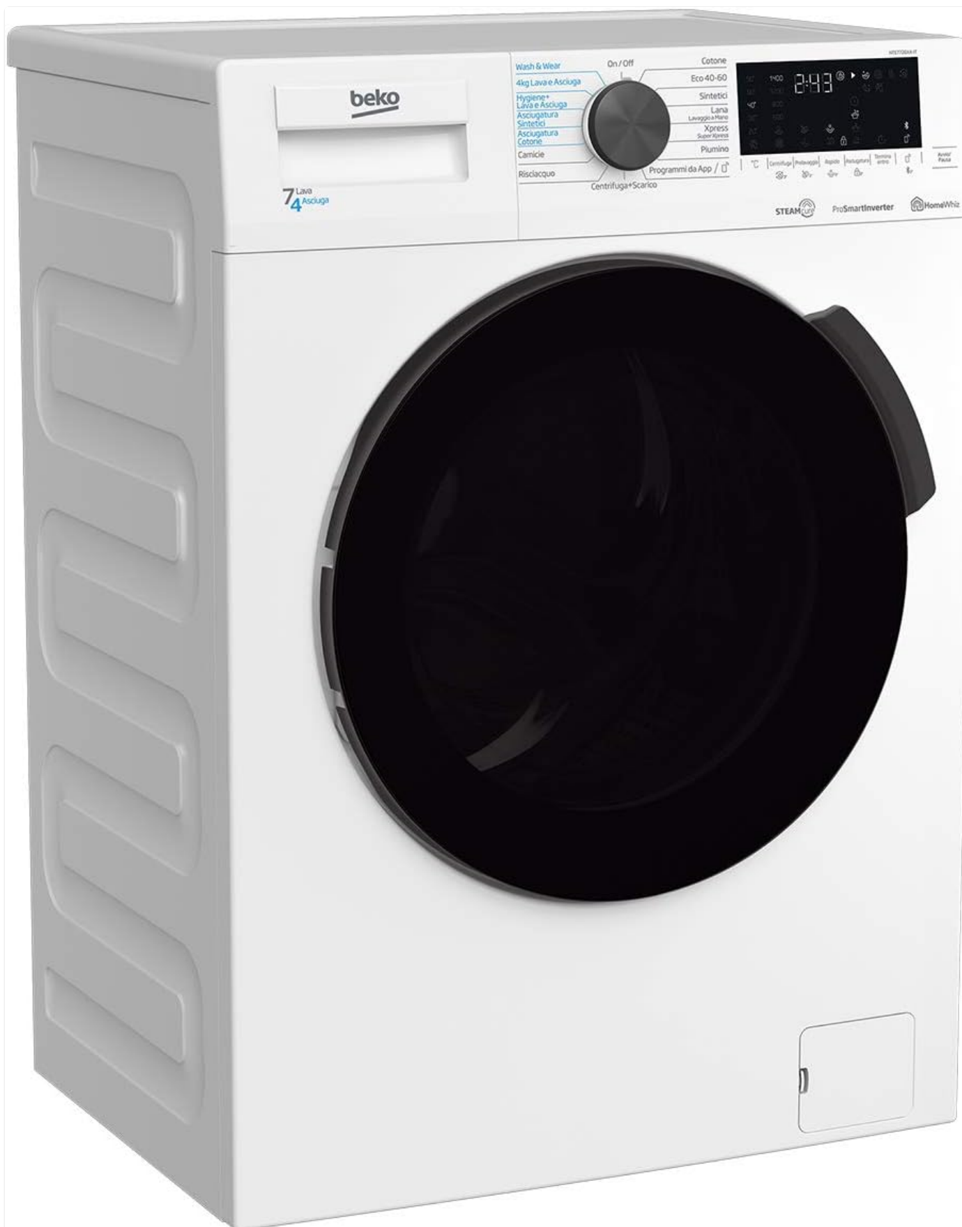
Image: Angled view of the Beko HTE7726XA-IT Slim Washer Dryer, highlighting the control panel with its program dial and digital display.