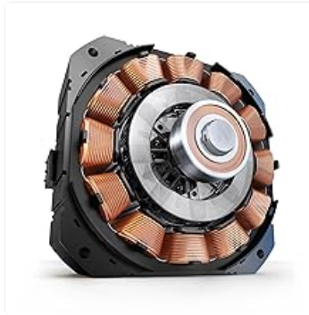
Image: A detailed view of the ProSmart Inverter Motor, showcasing its internal components and robust construction, indicative of its efficiency and quiet operation.

The appliance is equipped with a ProSmart Inverter Motor, which offers high energy efficiency, reduced noise levels, and extended durability compared to conventional motors.