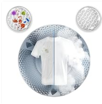
Image: An illustration depicting the SteamCure function, showing steam treating clothes inside a drum, indicating wrinkle reduction and refreshing capabilities.