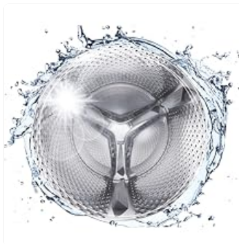
Image: An illustration of the DrumClean+ program, showing water splashing inside the drum, symbolizing a thorough cleaning cycle.