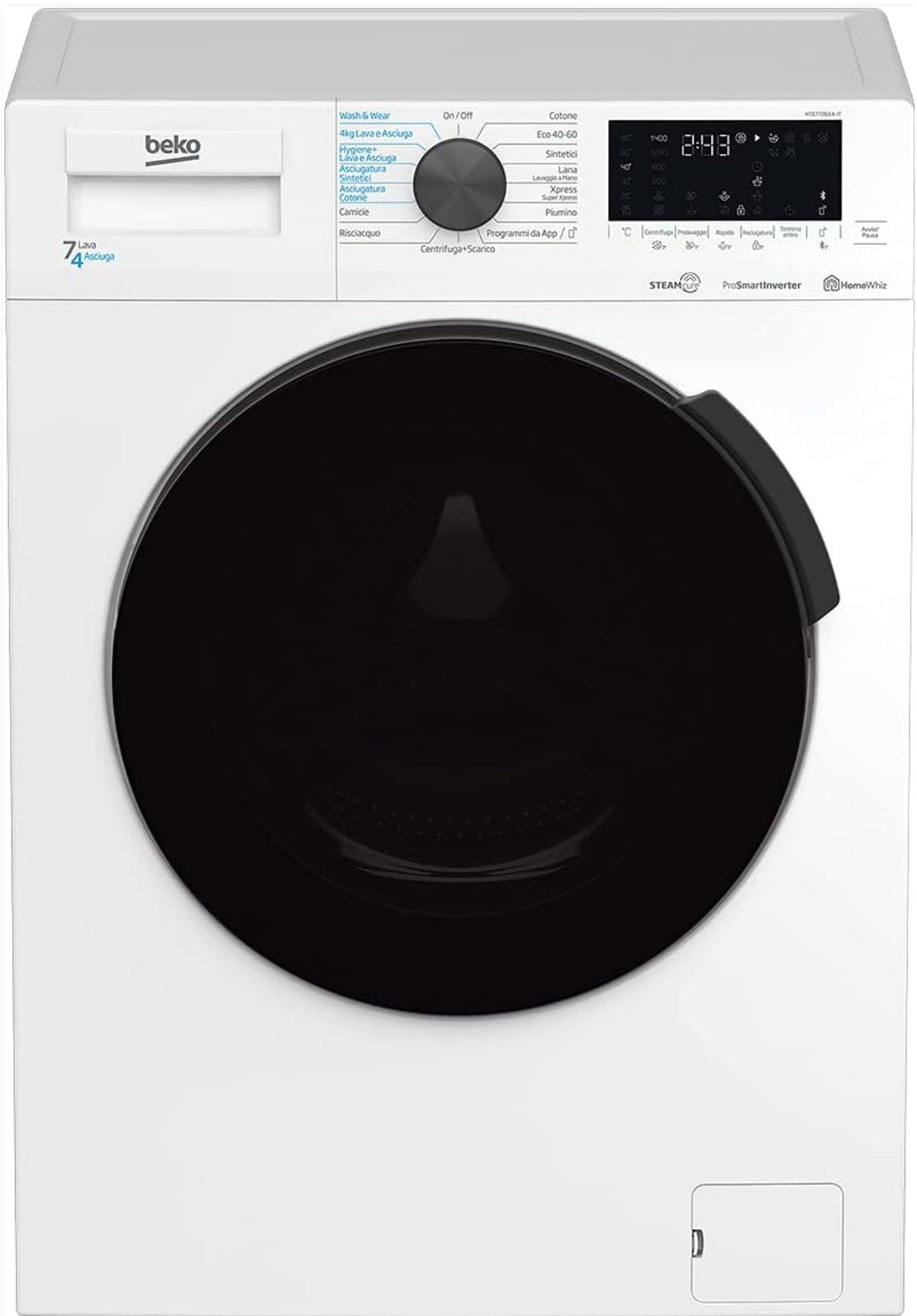
Image: Front view of the Beko HTE7726XA-IT Slim Washer Dryer. The appliance is white with a black door and control panel.