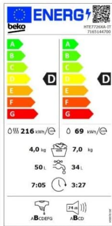
Image: The energy label for the Beko HTE7726XA-IT washer dryer, showing an energy efficiency class of D for both washing and combined washing/drying cycles, with energy consumption figures and capacities.