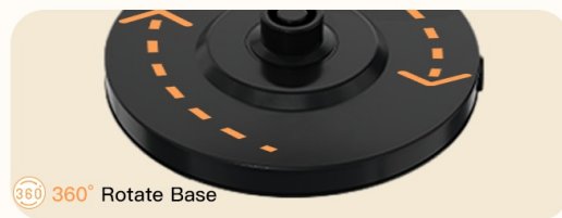
Image: Detailed view of kettle features such as the one-touch lid release, 360° rotatable base, food-grade materials, and LED indicator lights.