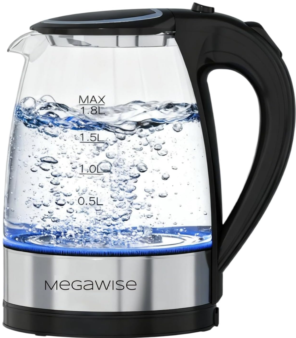
Image: The MEGAWISE 1.8L Healthy Electric Kettle, showcasing its clear glass body and stainless steel base.