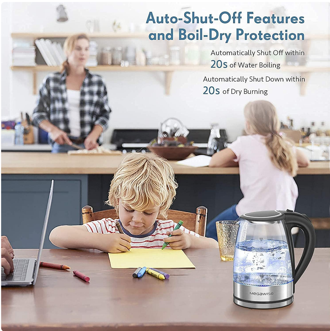
Image: The kettle with water boiling, illustrating the quick boil feature and water level markings.

Automatically Shut Down within 20s of Dry Burning